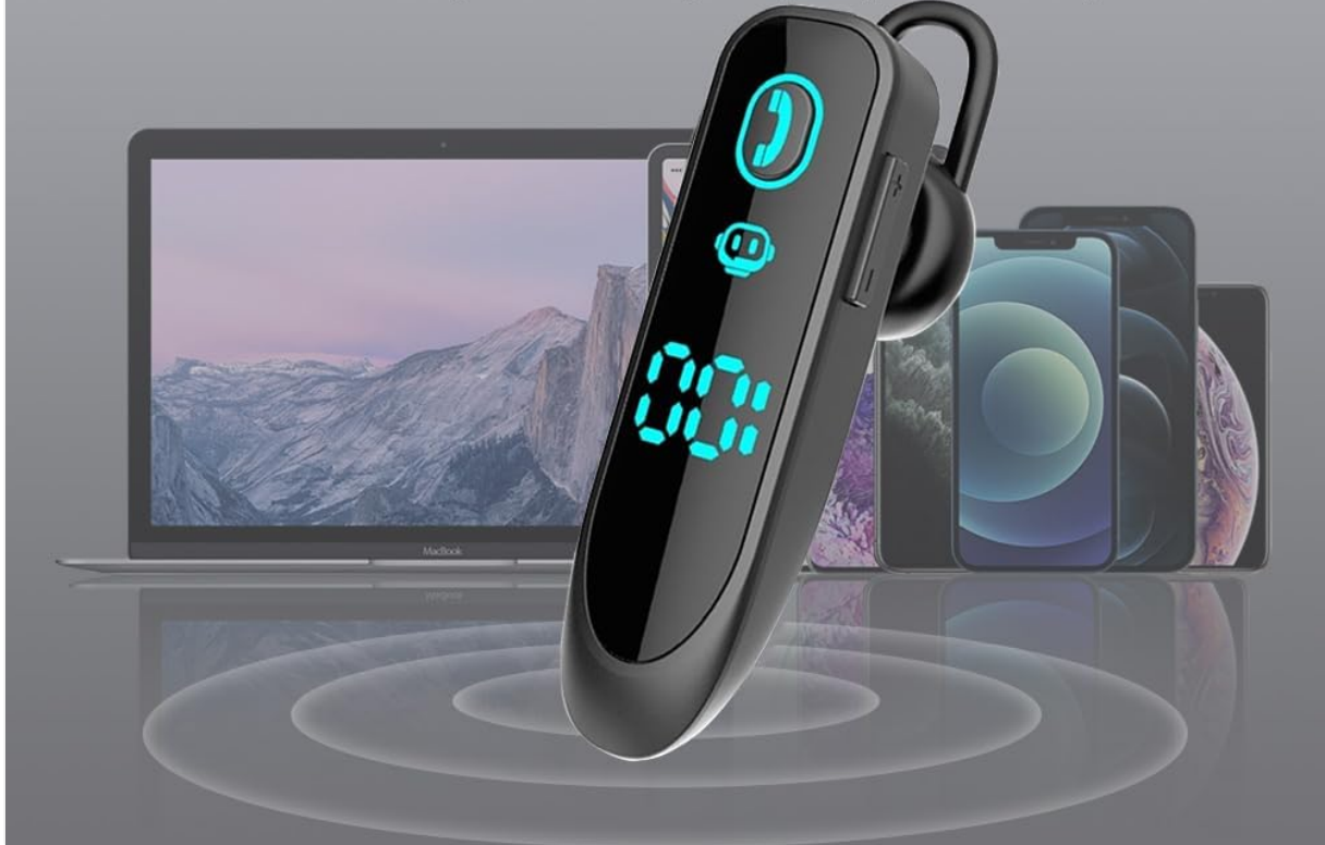
Image: The headset highlighting wide compatibility with Bluetooth V5.3 devices including smartphones, tablets, and laptops.

Compatible with most Bluetooth devices Smart Phones, Tablets, Laptops, Computers