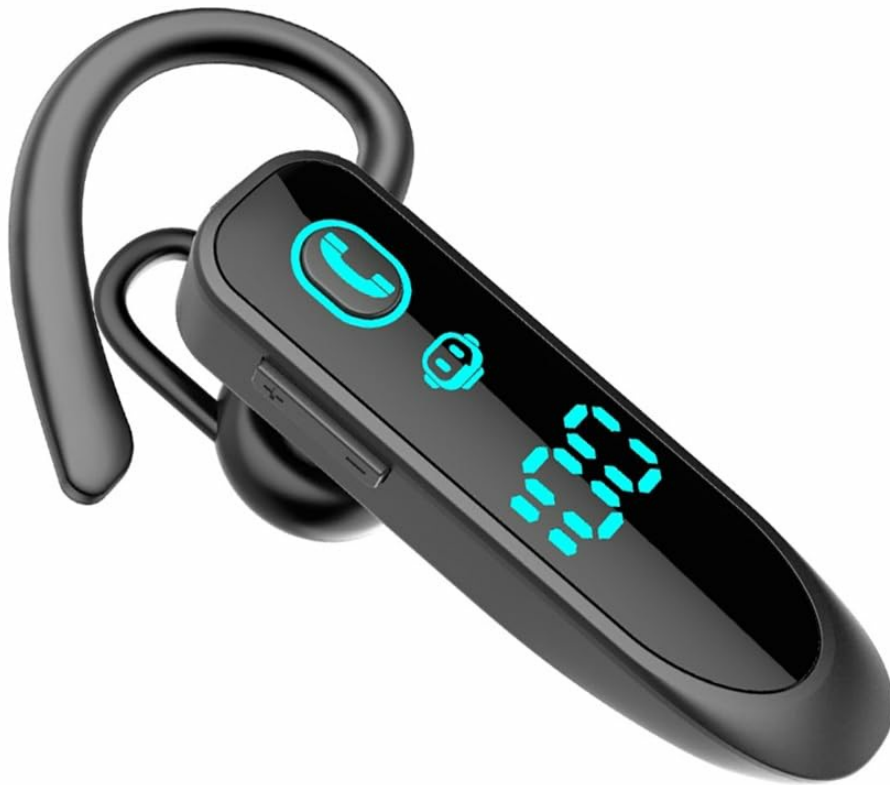
Image: The eppfun LS-00 ONE headset with its digital LED display indicating battery level.