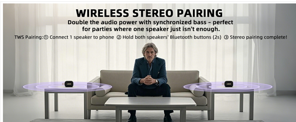
Image: Two LOBKIN 4GO speakers set up for wireless stereo pairing, creating an immersive audio experience in a home environment.