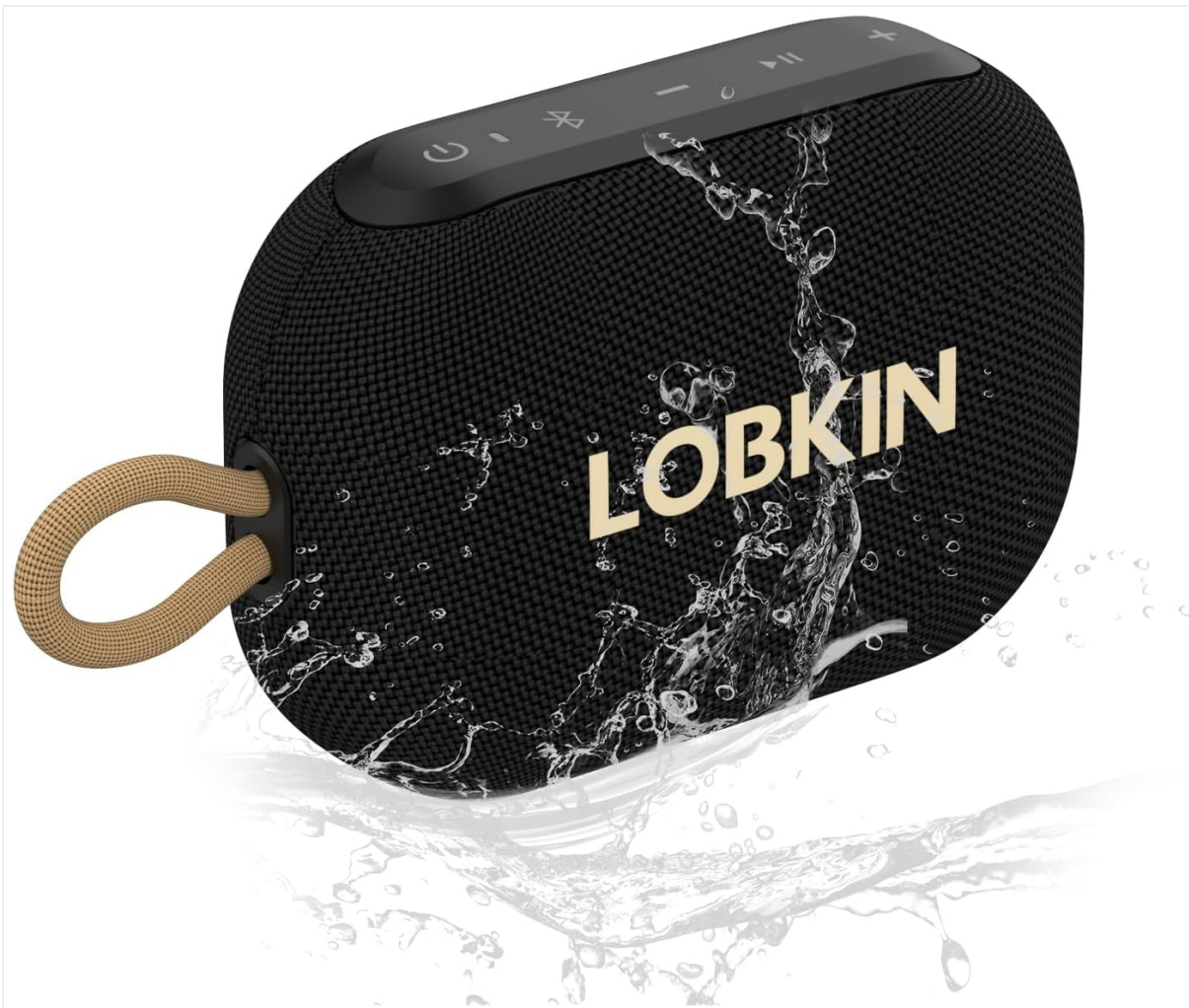
Image: The LOBKIN 4GO Portable Bluetooth Speaker, showcasing its waterproof design with water splashing around it.