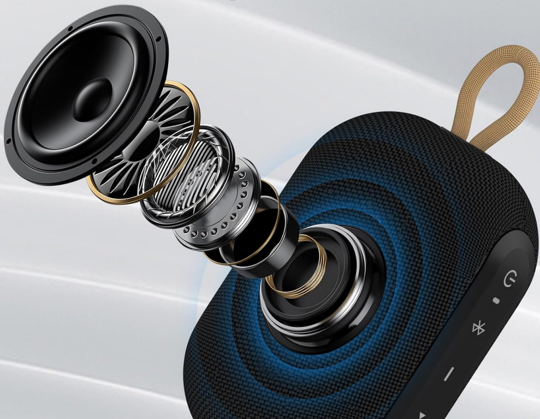
Image: An exploded view diagram of the LOBKIN 4GO speaker, highlighting its 43x47mm dynamic driver and 10W vibrant sound.