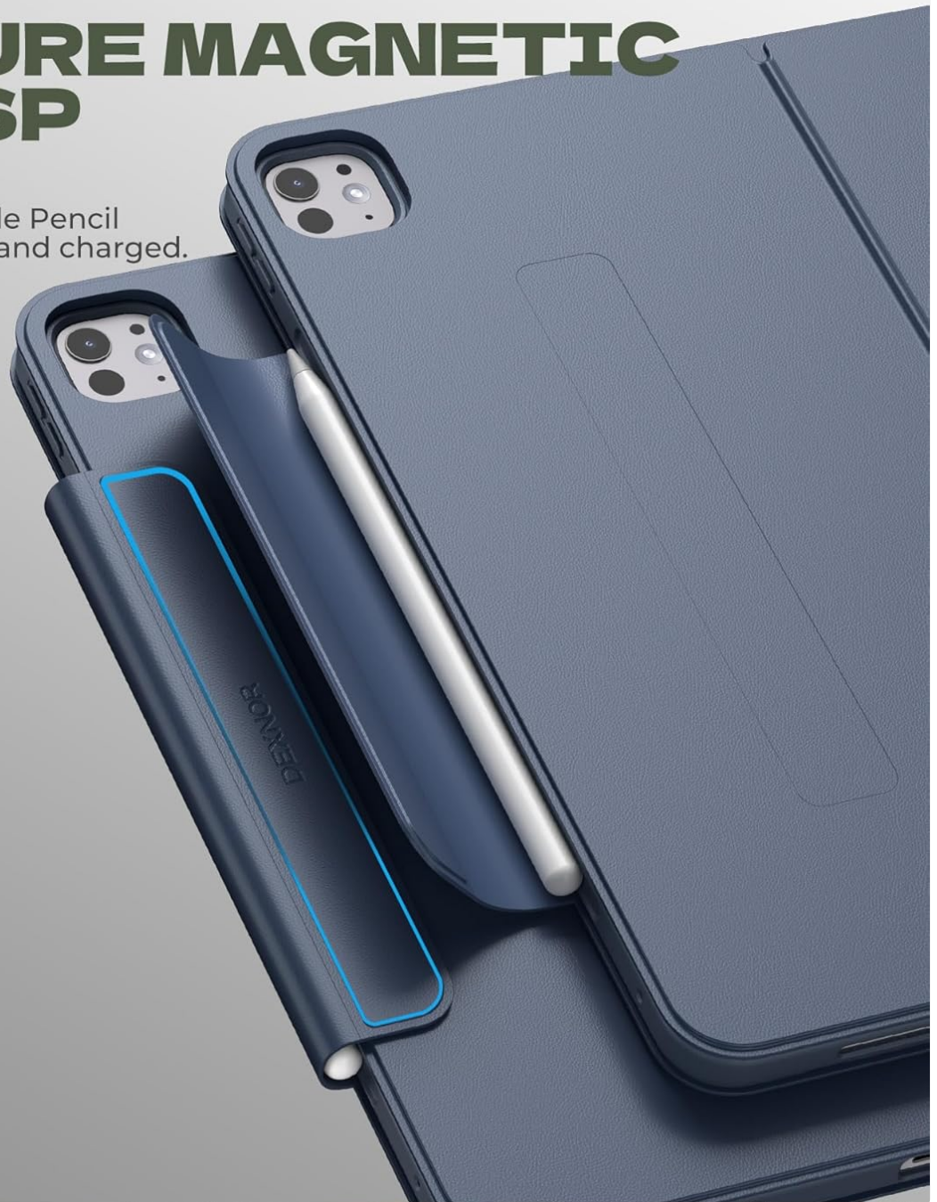
Figure 3.4: The magnetic clasp secures the Apple Pencil.

Keeps your Apple Pencil securely stored and charged.