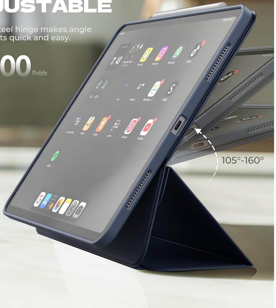
Figure 3.2: The durable stainless steel hinge allows for precise angle adjustments.