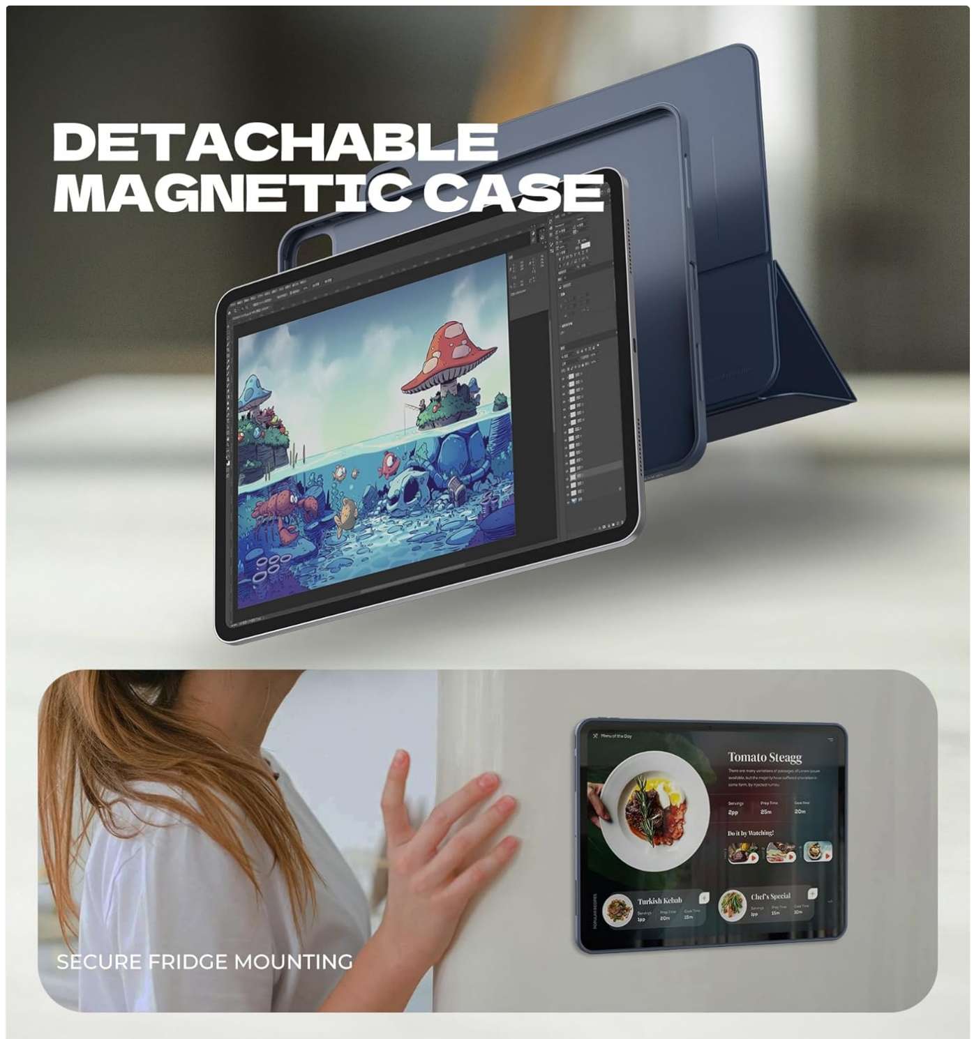
Figure 2.1: Demonstration of the detachable magnetic cover and its secure fridge mounting capability.

the cover. The strong magnets allow for easy removal when you wish to use the iPad without the full cover, or for fridge mounting.