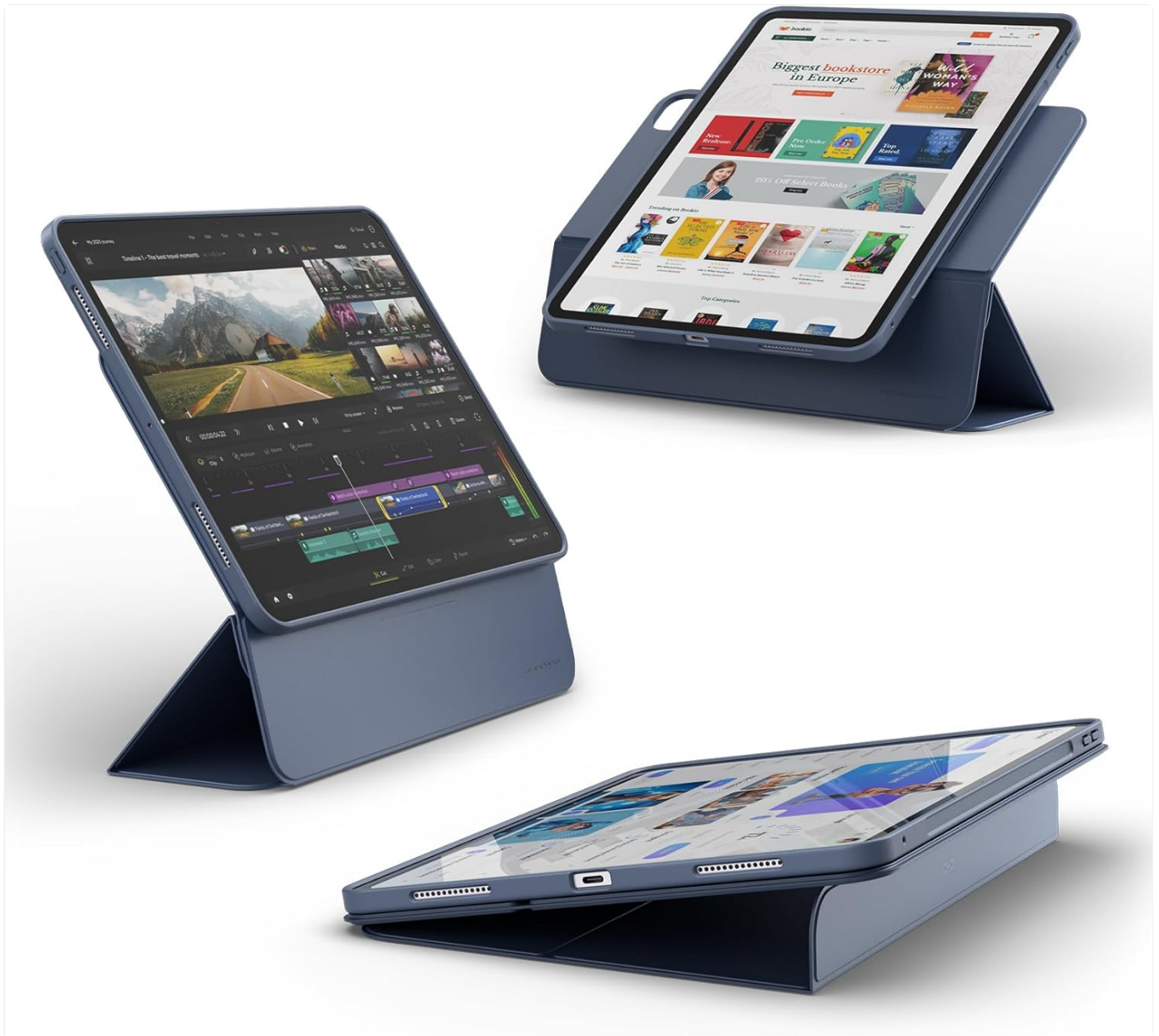
Figure 1.1: Dexnor Magnetic Floating Slim Case showcasing its versatile design and multiple viewing positions.