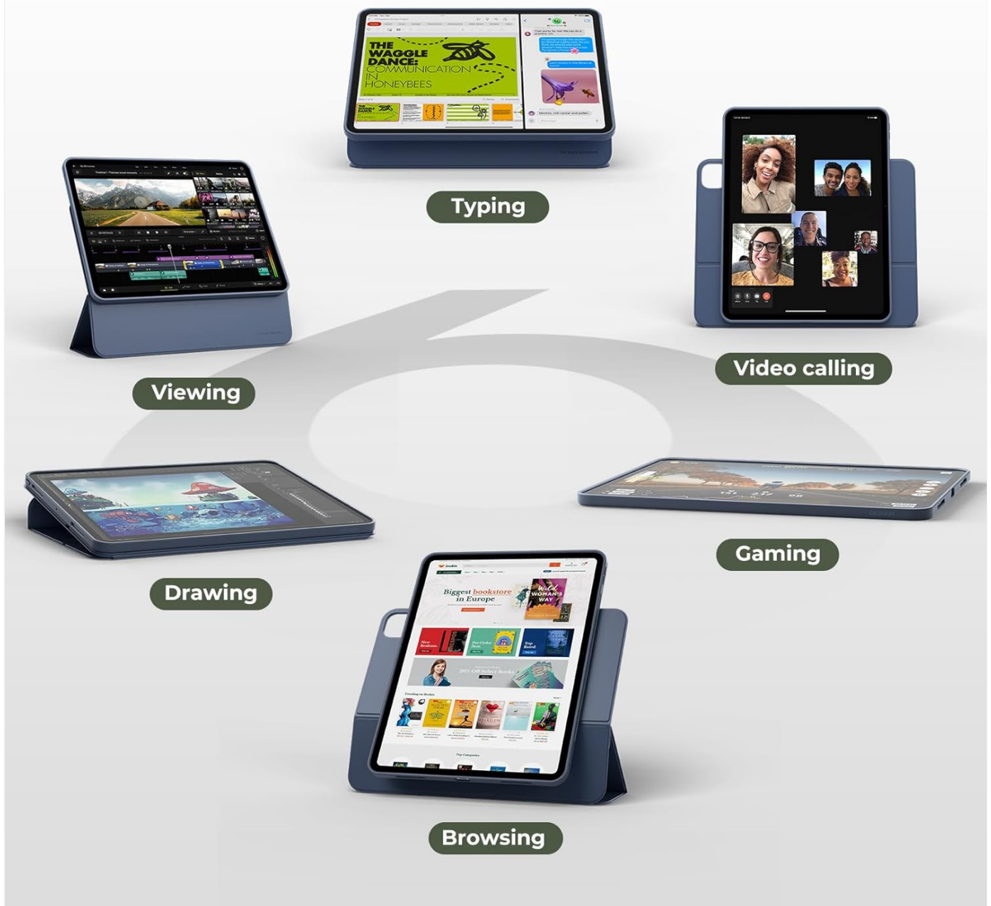
Figure 3.1: Different usage modes supported by the Dexnor case.