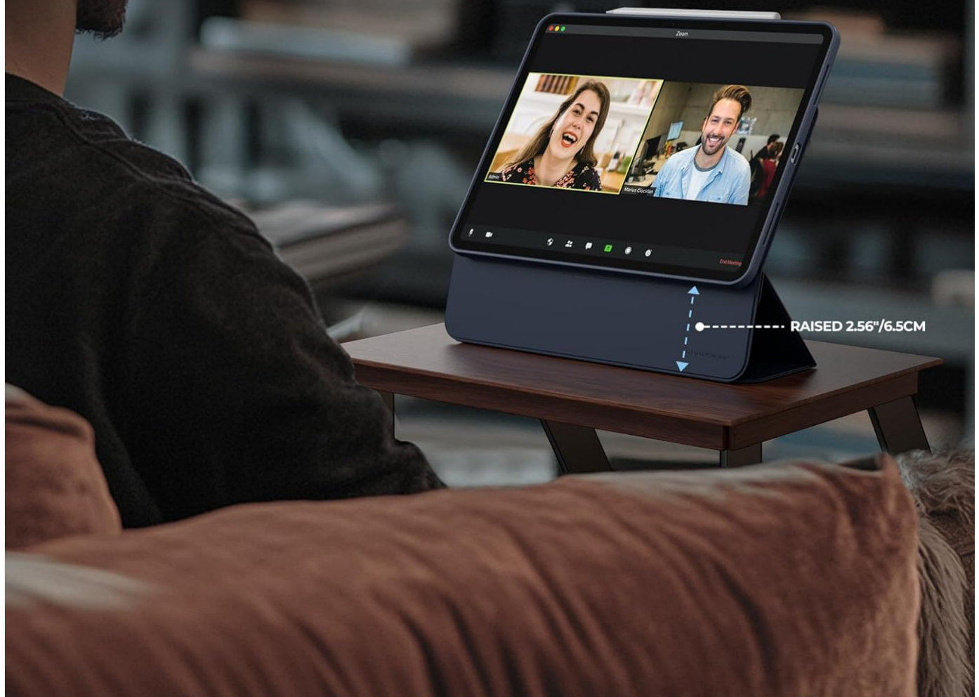
Figure 3.3: The ergonomic floating design provides a raised viewing height.

Raises your iPad to a more comfortable viewing height.