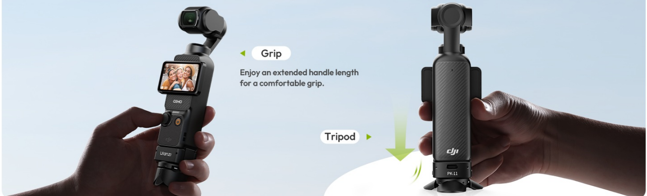
Image: The DJI Osmo Pocket 3 with the ULANZI PK-11 base, illustrating its use in both tripod and handheld grip modes for stable shooting.

Unfolded as a tripod and fold back as a hand grip, effortlessly switch modes for every shot.