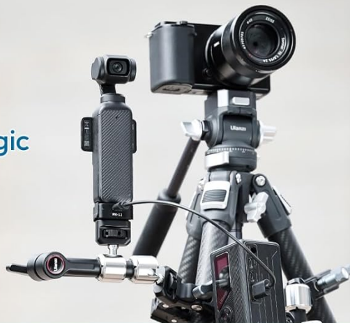
Image: Close-up of the ULANZI PK-11 base, highlighting the 1/4" thread and Arri locating hole for accessory attachment.