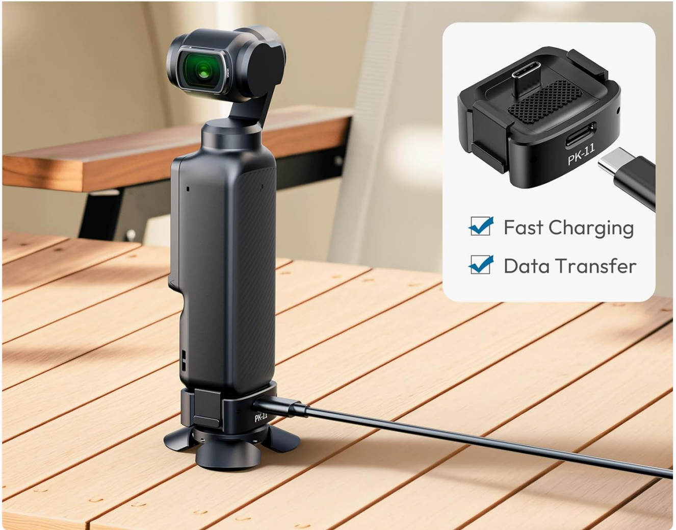
Image: DJI Osmo Pocket 3 connected to a charging cable via the ULANZI PK-11 base, illustrating the charging function.

Experience ultimate performance and seamless transmission with the full-function data port, supporting charging while in use.