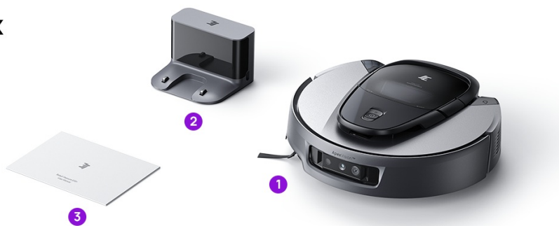
Image: A visual representation of the 3i G10+ robot vacuum and its charging station with their respective dimensions.