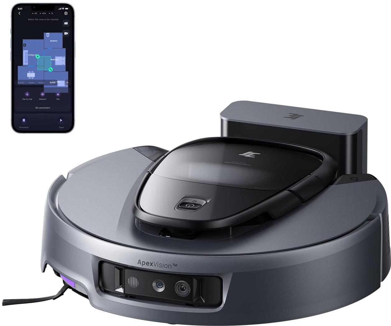
Image: The 3i G10+ Robot Vacuum and Mop Combo, showcasing its sleek design and an accompanying mobile app interface for control.