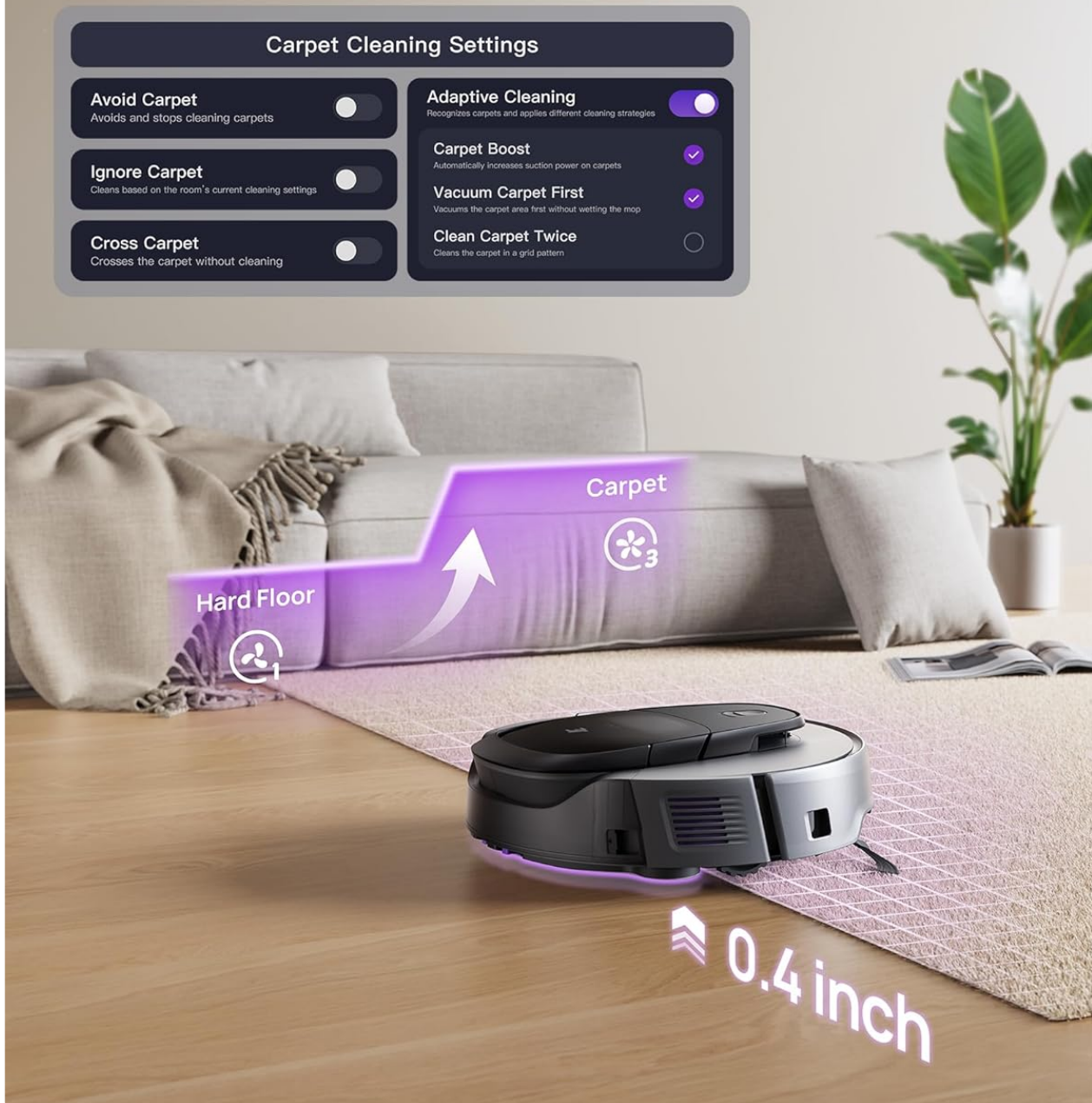
Image: The 3i G10+ robot vacuum moving from a hard floor onto a carpet, illustrating its ability to automatically lift the mop for carpet protection.

Control how each carpet and rug is cleaned via 3i app.