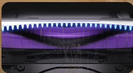
Built-in Comb Clearing Roller Brush Tangles