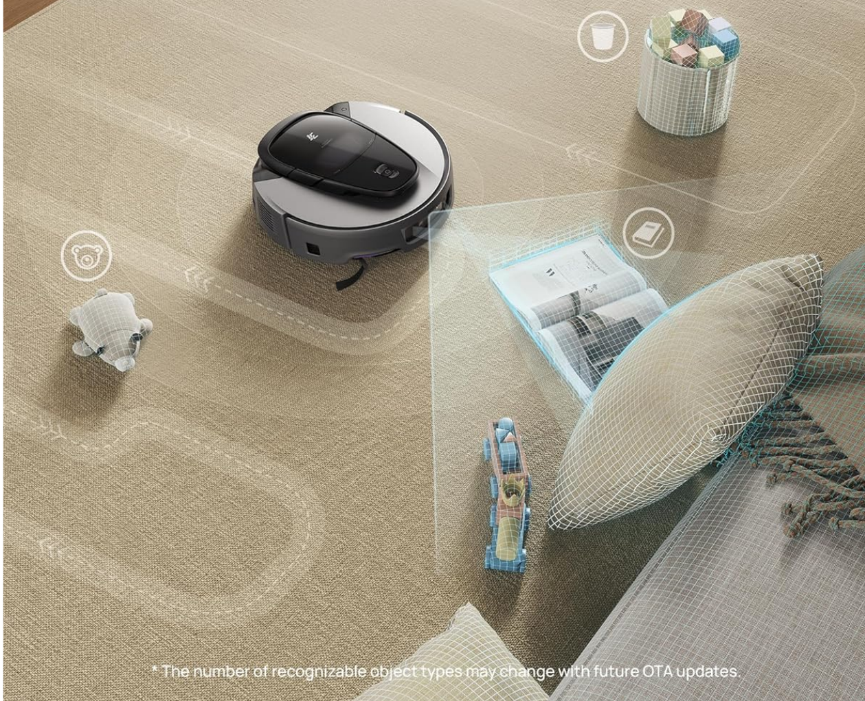
Image: The 3i G10+ robot vacuum navigating a carpeted area, demonstrating its ApexVision technology to recognize and avoid objects like toys and furniture.