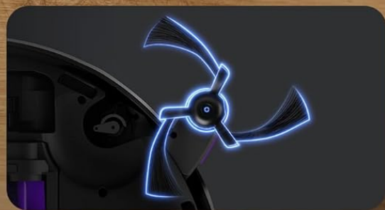
Side Brush with Anti-Tangle Design

Image: A close-up of the 3i G10+ roller brush, showing its built-in comb designed to prevent hair tangles and ensure smooth operation.