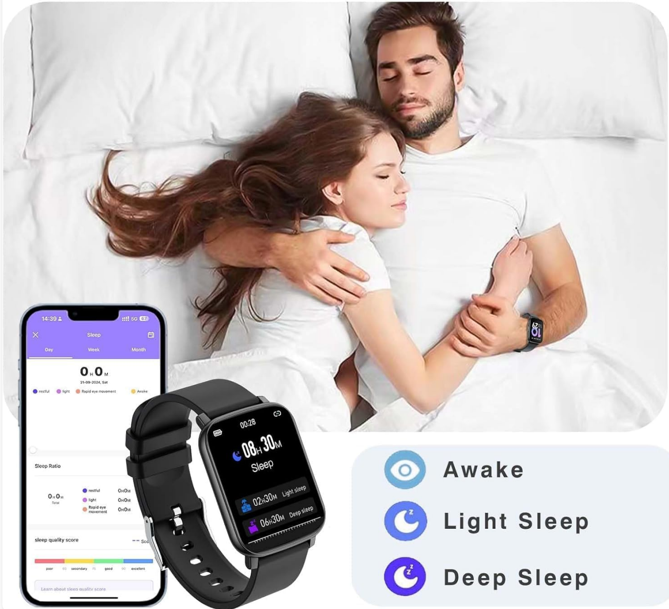
Image 4.1: The Paukila P40 Smart Watch displaying sleep data, with an accompanying smartphone app interface showing detailed sleep analysis.