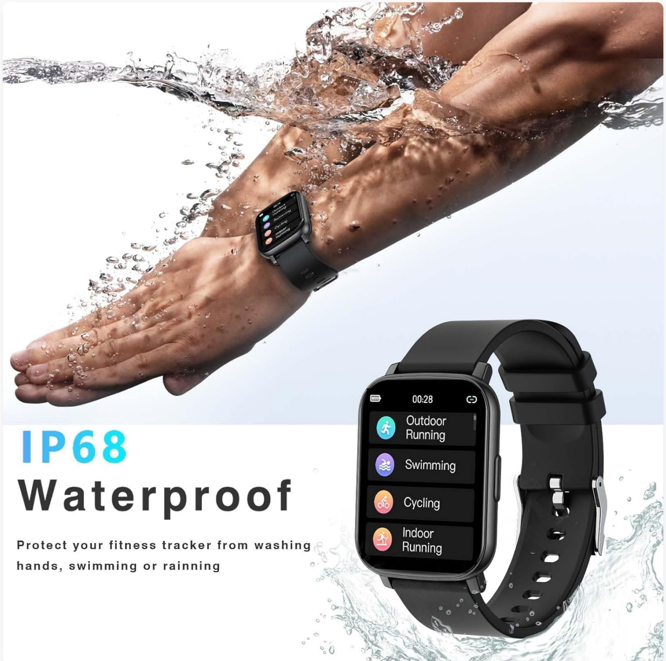
Image 5.1: A hand wearing the Paukila P40 Smart Watch submerged in water, demonstrating its IP68 waterproof capability.