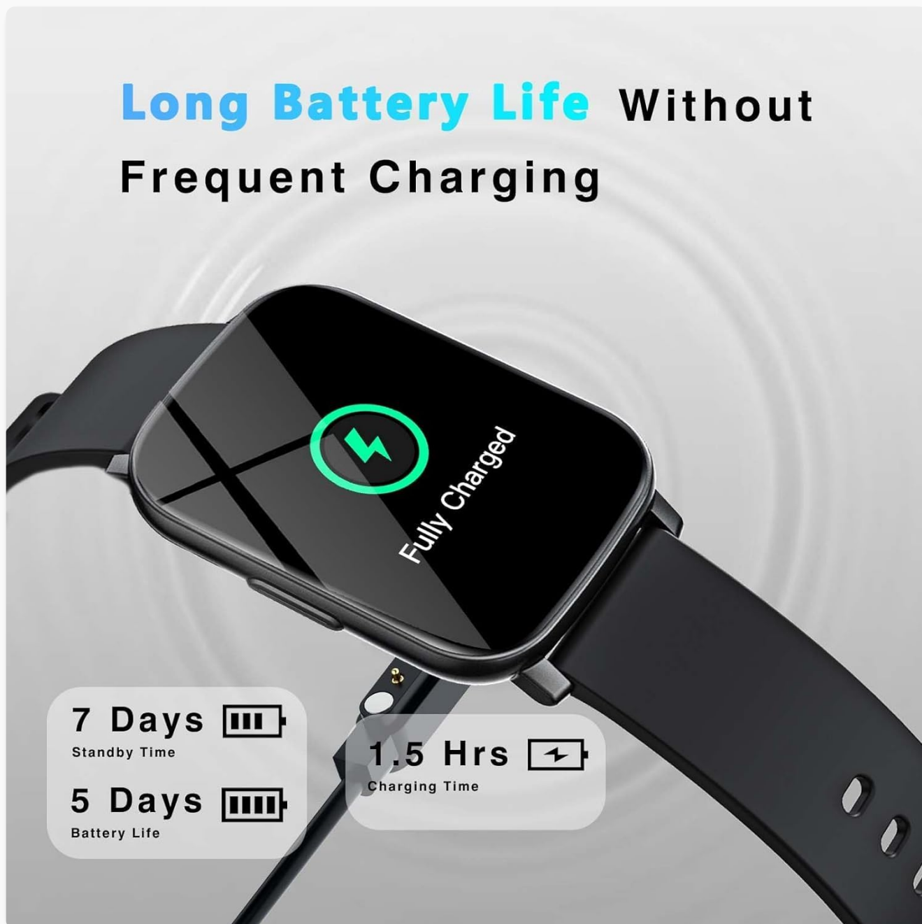
Image 3.1: Illustration of the Paukila P40 Smart Watch being charged with its magnetic charging cable, highlighting battery life and charging time.

A full charge provides up to 5-7 days of typical use or 7 days of standby time.