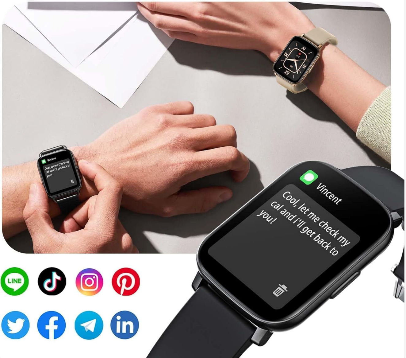
Image 4.4: The Paukila P40 Smart Watch showing an incoming message notification, with icons of various social media and messaging apps.