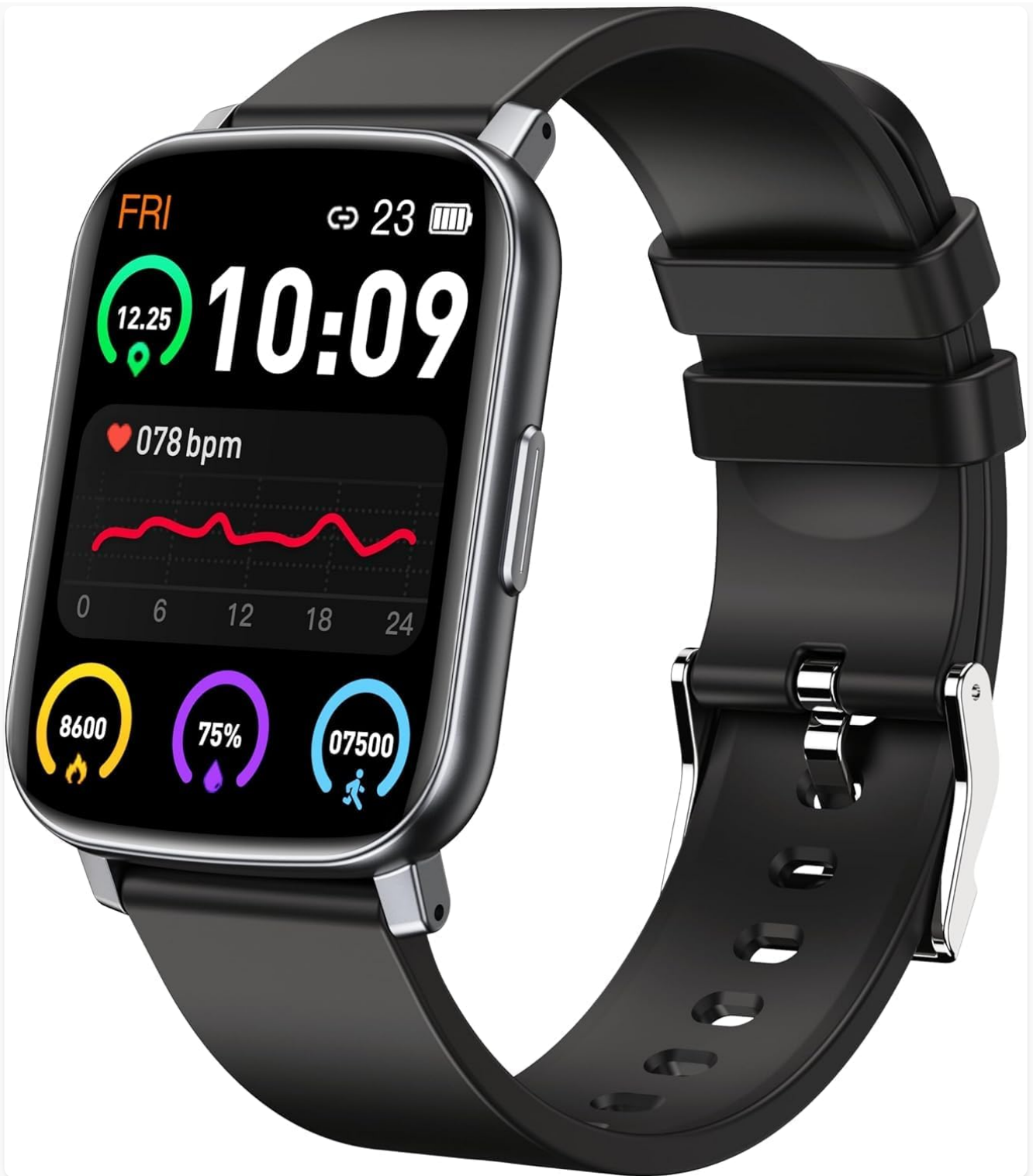
Image 1.1: Front view of the Paukila P40 Smart Watch, displaying time, date, heart rate, and activity metrics.