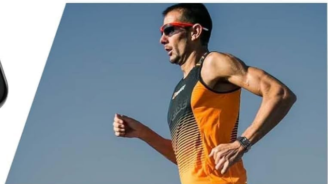
Image 4.3: The Paukila P40 Smart Watch tracking various sports activities, showing metrics like calories, distance, and heart rate, with examples of users engaged in cycling and running.