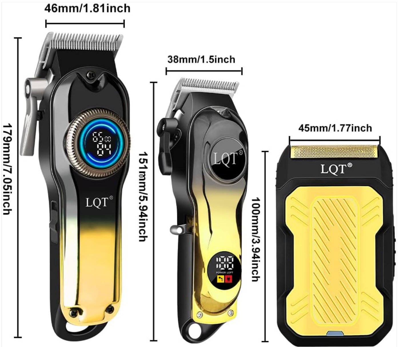
Figure 8.2: Physical dimensions of the LQT hair clipper, trimmer, and shaver.