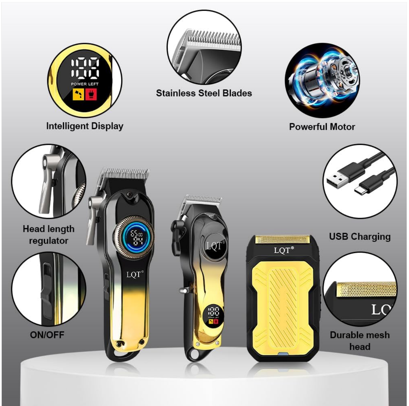
Figure 8.1: Key features of the LQT grooming kit, including intelligent display, stainless steel blades, powerful motor, and USB charging.