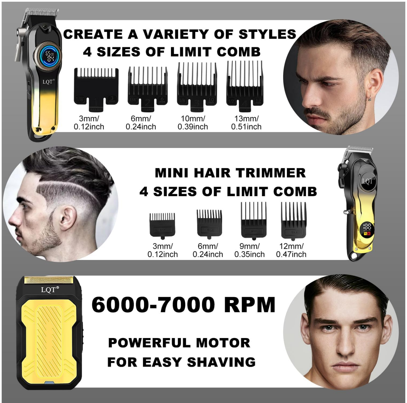
Figure 4.3: Available limit comb sizes for the main clipper and mini hair trimmer.

Select the desired guide comb for your preferred hair length. Align the comb with the blade and firmly push it until it clicks into place. Ensure it is securely attached before operating the device. To remove, gently pull the comb away from the blade.