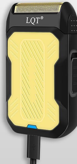
Figure 4.1: USB charging details and battery capacities for each device.