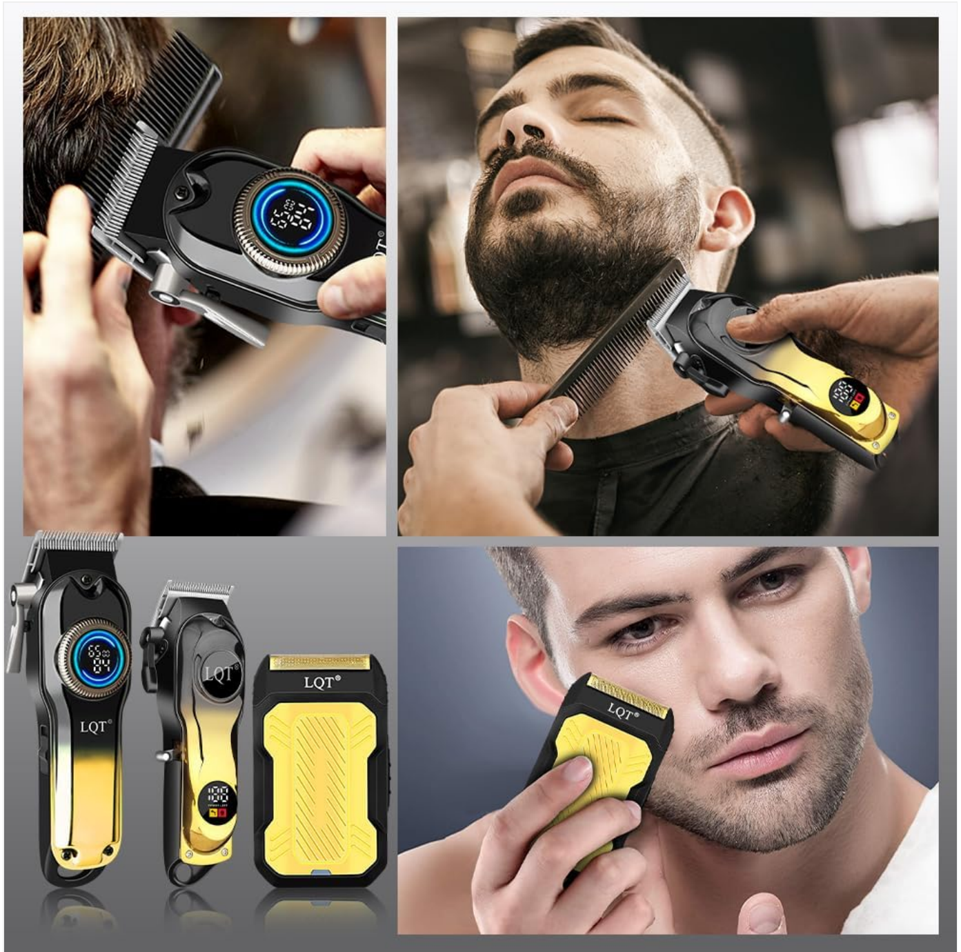
Figure 5.1: Demonstrations of the LQT grooming kit for various uses including hair cutting, beard trimming, and close shaving.

The men's shaver provides a smooth, close shave for facial hair and can also be used for trimming sideburns. It features a durable mesh head for comfortable skin contact. For sideburns, utilize the pop-up blade feature. Turn on the shaver and gently glide it over the skin in short, circular motions.