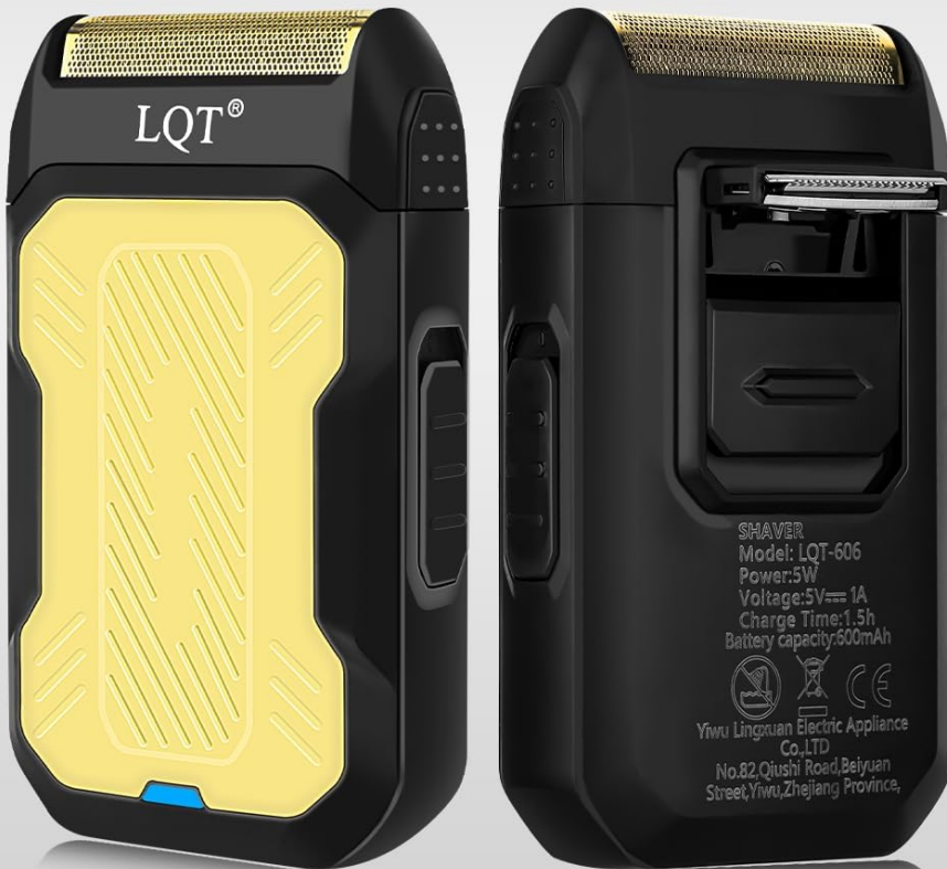
Figure 5.2: Detailed view of the LQT shaver, highlighting its detachable isolation cover and applications for trimming sideburns and shaving the beard.