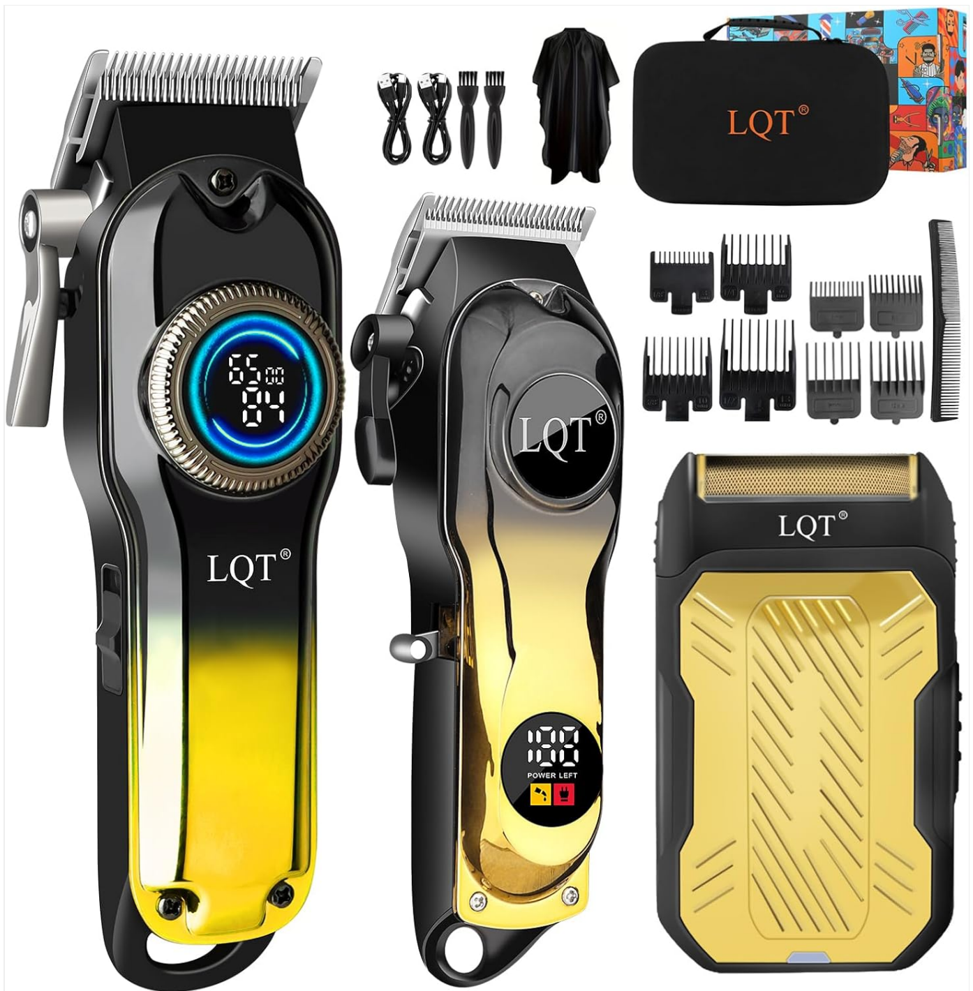
Figure 1.1: Overview of the LQT Hair Clipper, Trimmer, and Shaver Kit, showing the main clipper, T-blade trimmer, and shaver along with accessories.