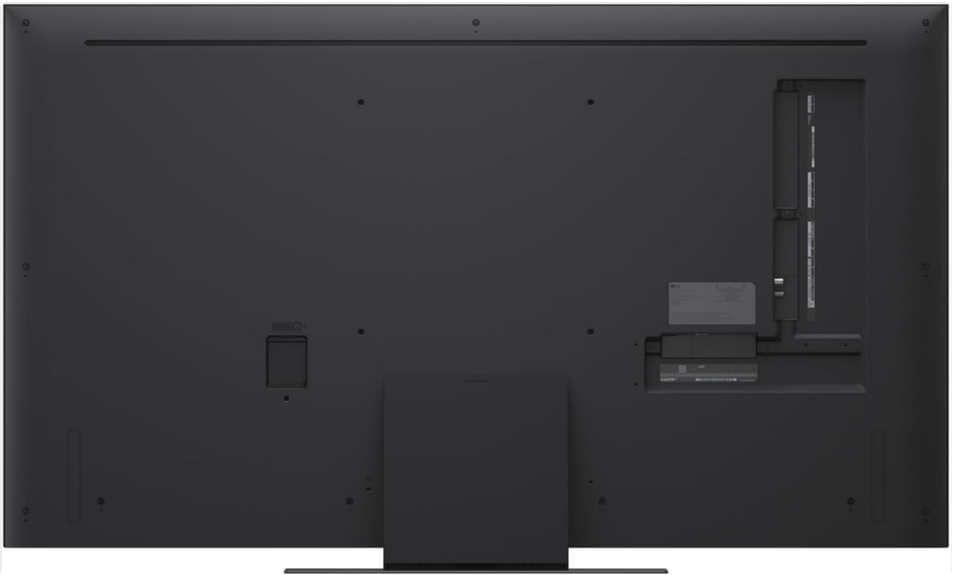
Figure 3.2: Rear view of the LG QNED evo AI TV, highlighting the arrangement of HDMI, USB, and other connectivity ports.