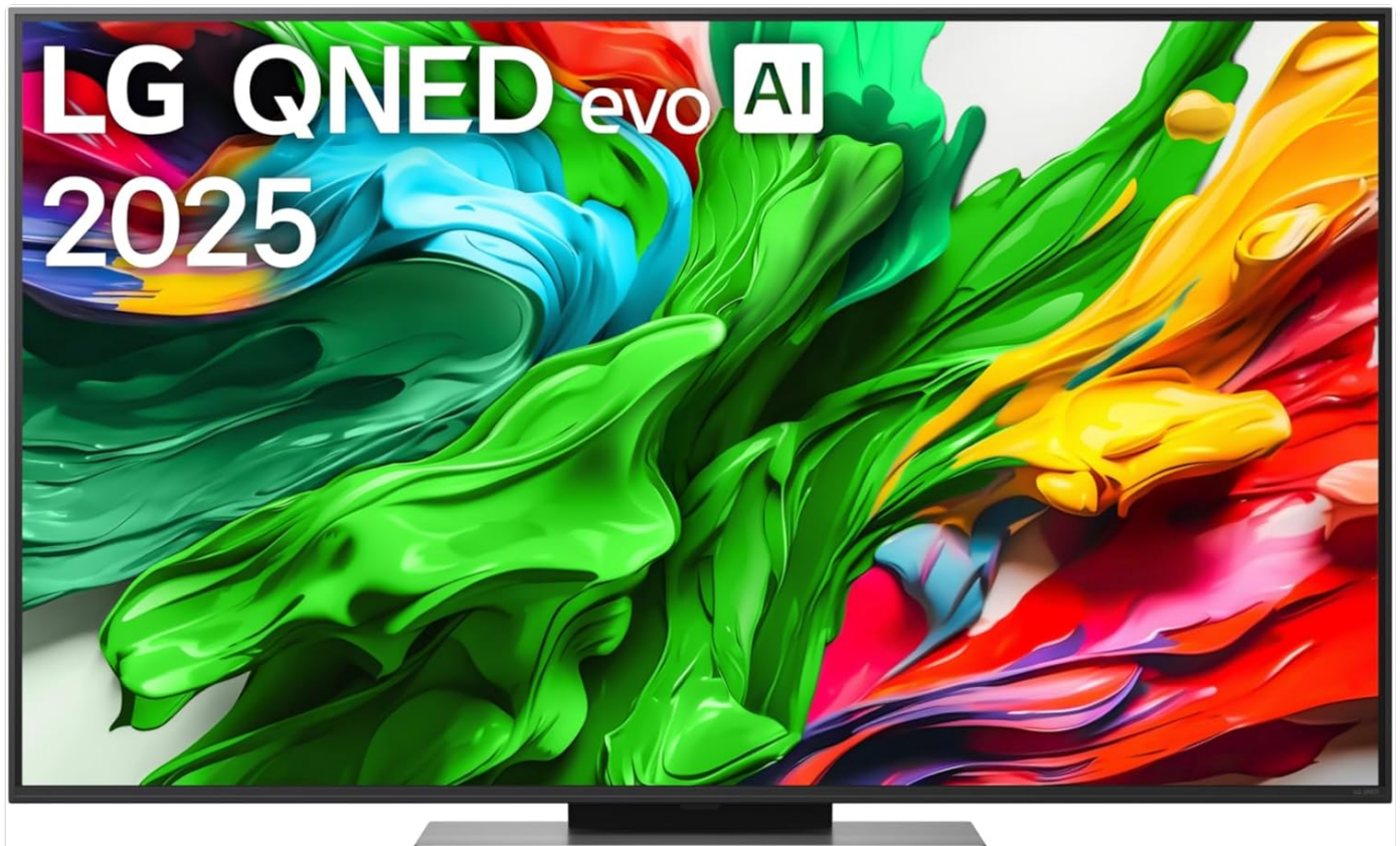
Figure 1.1: Front view of the LG QNED evo AI TV 55QNED86A, showcasing its slim bezel and vibrant display.

The LG QNED evo AI TV 55QNED86A is a 55-inch 4K Smart TV designed to deliver an immersive viewing experience. Featuring QNED evo display technology, an \alpha 8 AI Processor Gen2, and webOS 25, this television offers advanced picture and sound capabilities, along with smart functionalities for seamless entertainment.