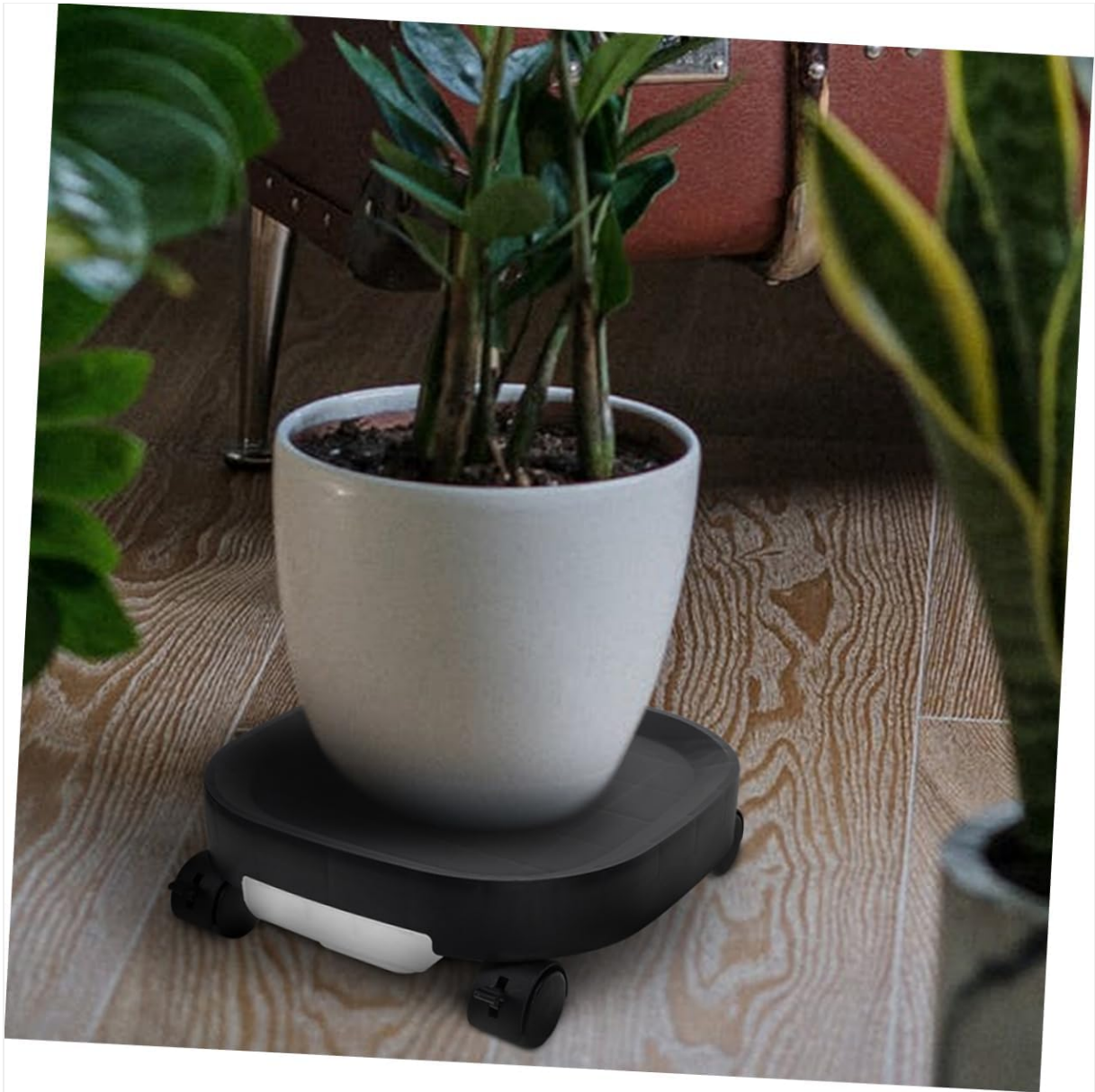
Image: A potted plant positioned on the planter tray, ready for use.