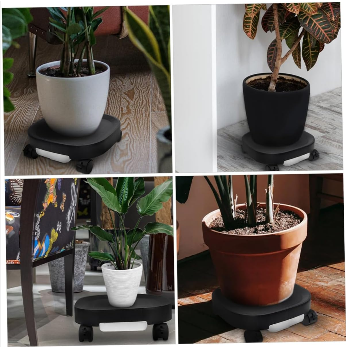
Image: The ibasenice Mobile Planter Tray supporting various potted plants in different environments, showcasing its versatility.