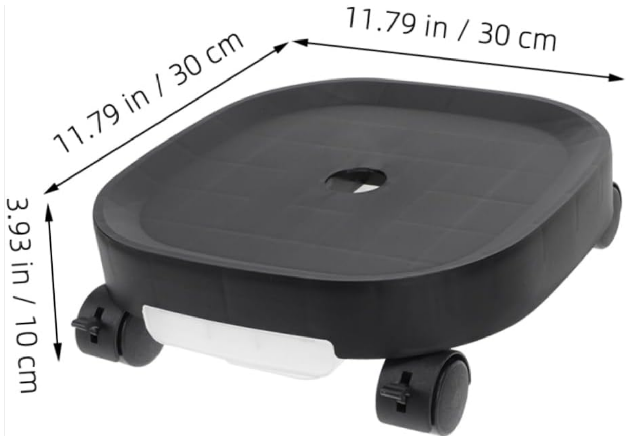
Image: Detailed dimensions of the ibasenice Mobile Planter Tray.