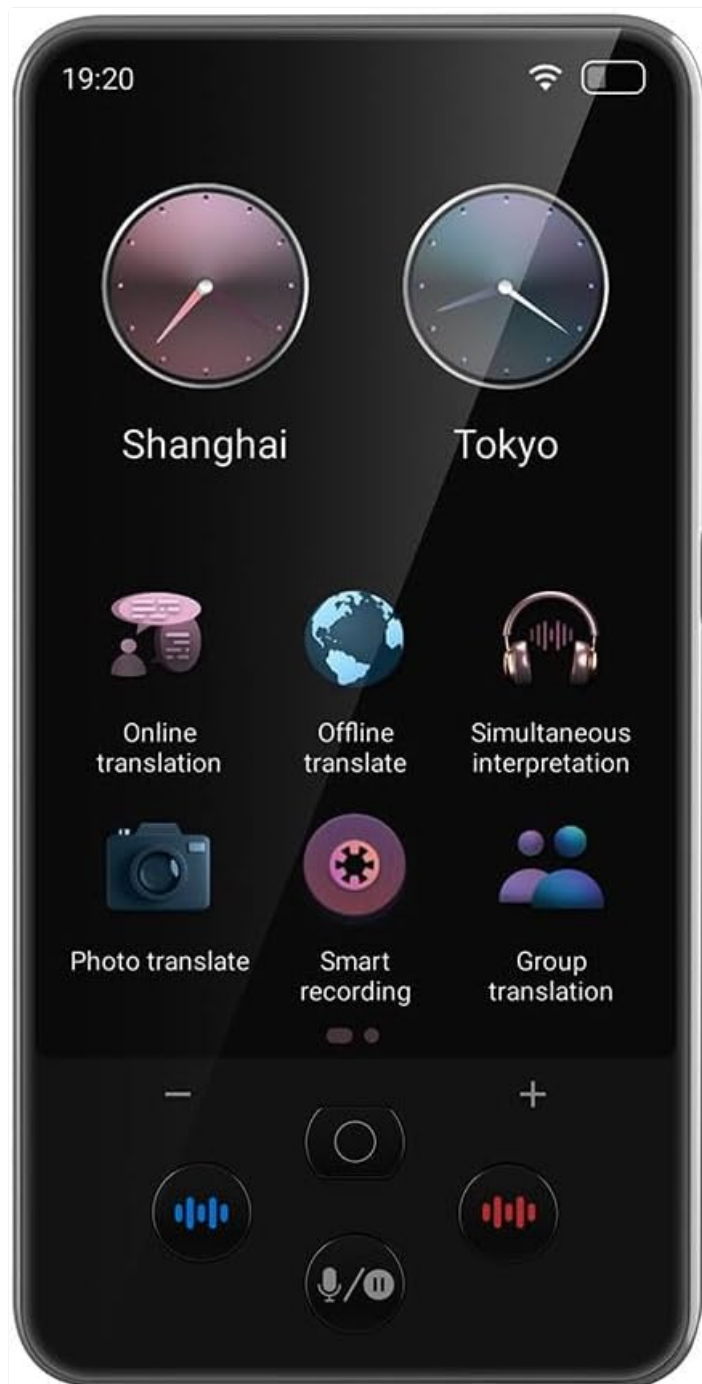
Image 5.1: The main screen of the S85 Pro translator displays various function icons. These include 'Online translation', 'Offline translate', 'Simultaneous interpretation', 'Photo translate', 'Smart recording', and 'Group translation'. Two clock widgets show different time zones.