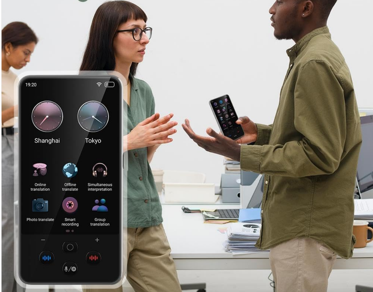
Image 1.1: The S85 Pro Portable Audio Translator in a usage scenario. The device features a clear display with various function icons, designed for intuitive interaction.