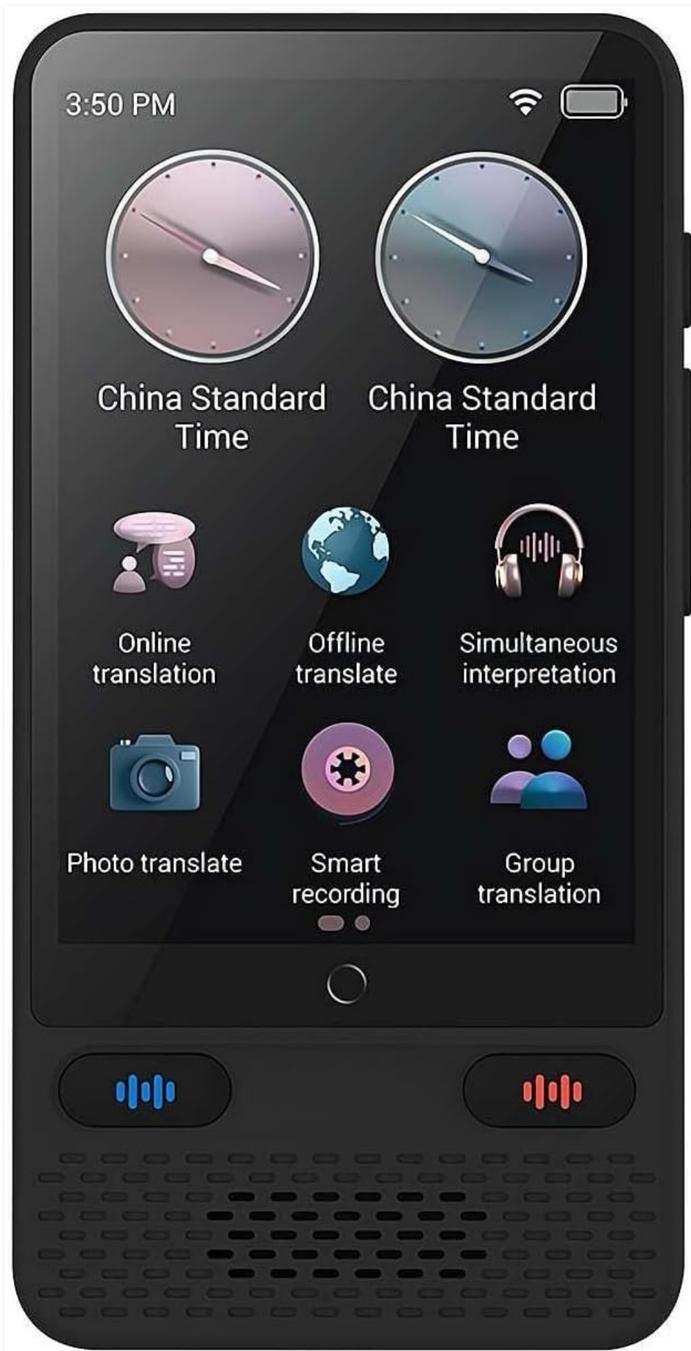
Image 3.1: This diagram illustrates the various buttons, ports, and features of the S85 Pro translator. On the top, you'll find the charging port, headphone jack, and microphone. On the right side, from top to bottom, are the power switch, volume up key, and volume down key. The left side features a memory card slot. The front panel includes the display, a