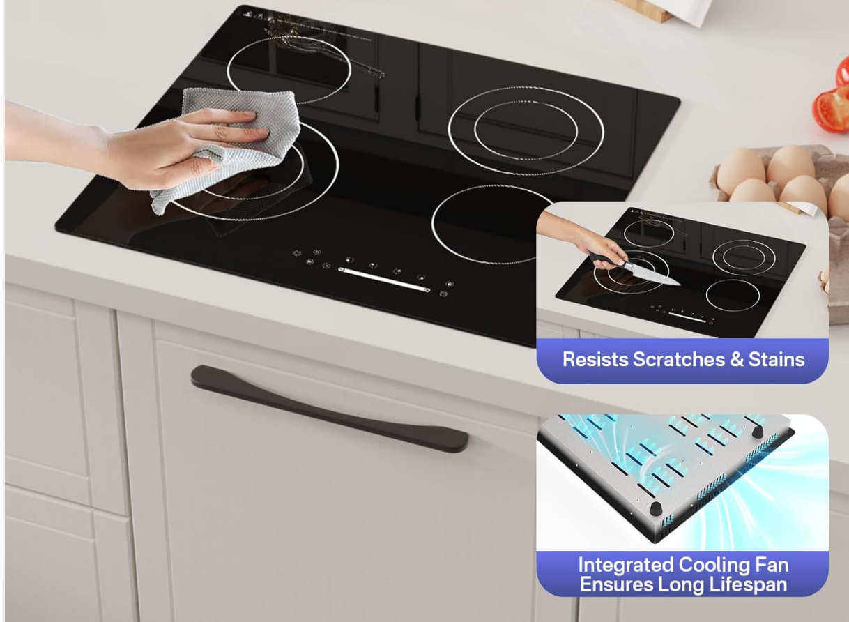
Image: The GRACEALL electric ceramic hob being cleaned, highlighting its tough glass surface that resists scratches and stains. An inset shows the integrated cooling fan for extended lifespan.