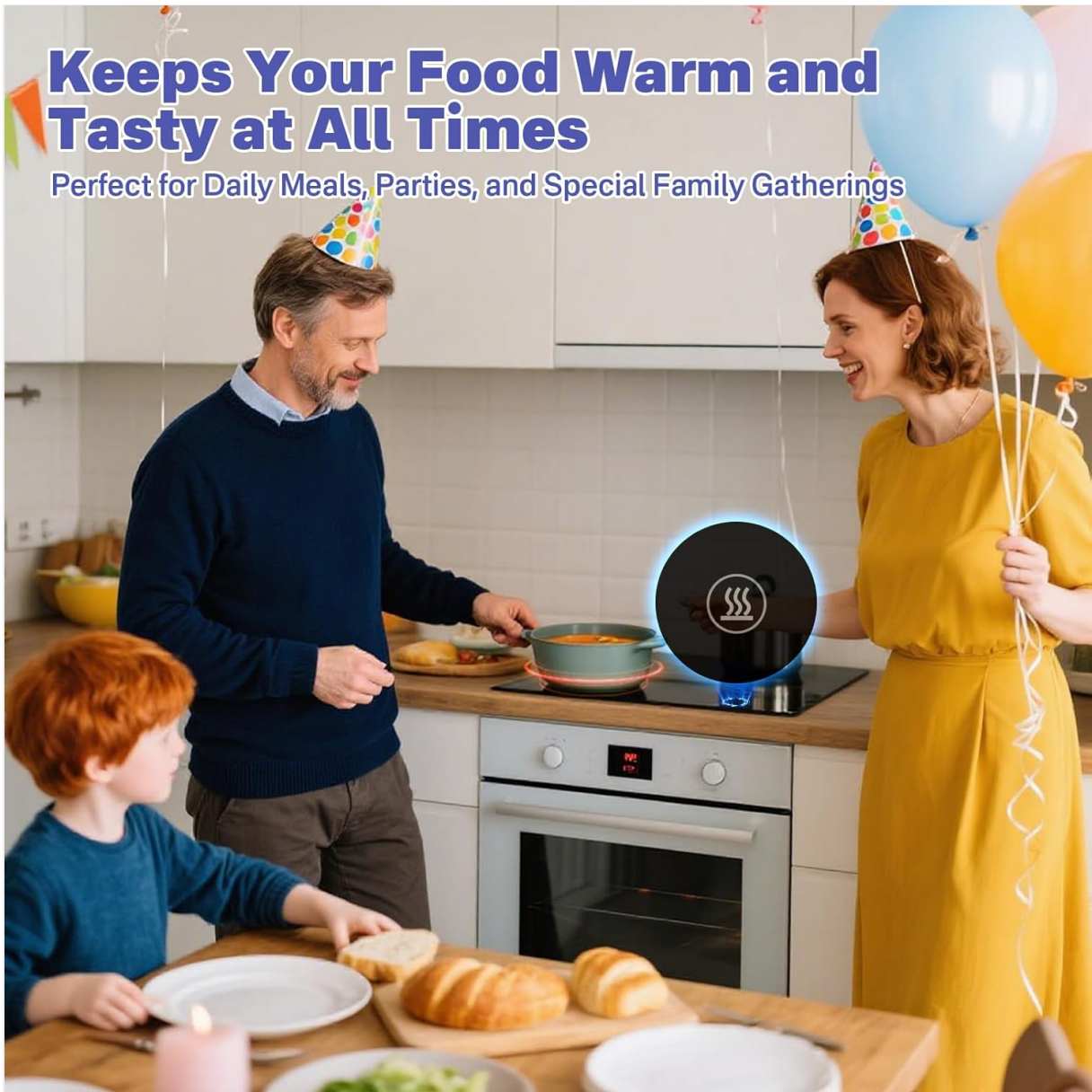
Image: A family scene showing the GRACEALL electric ceramic hob in use, highlighting the "Keep Warm" function icon (SSS) on one of the burners, indicating that food can be kept warm after cooking.

Perfect for Daily Meals, Parties, and Special Family Gatherings