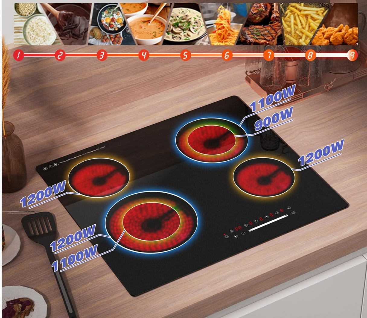
Image: The GRACEALL electric ceramic hob illustrating its four heating zones with individual power levels (e.g., 1200W, 1100W, 900W) and a visual representation of 9 heating levels.