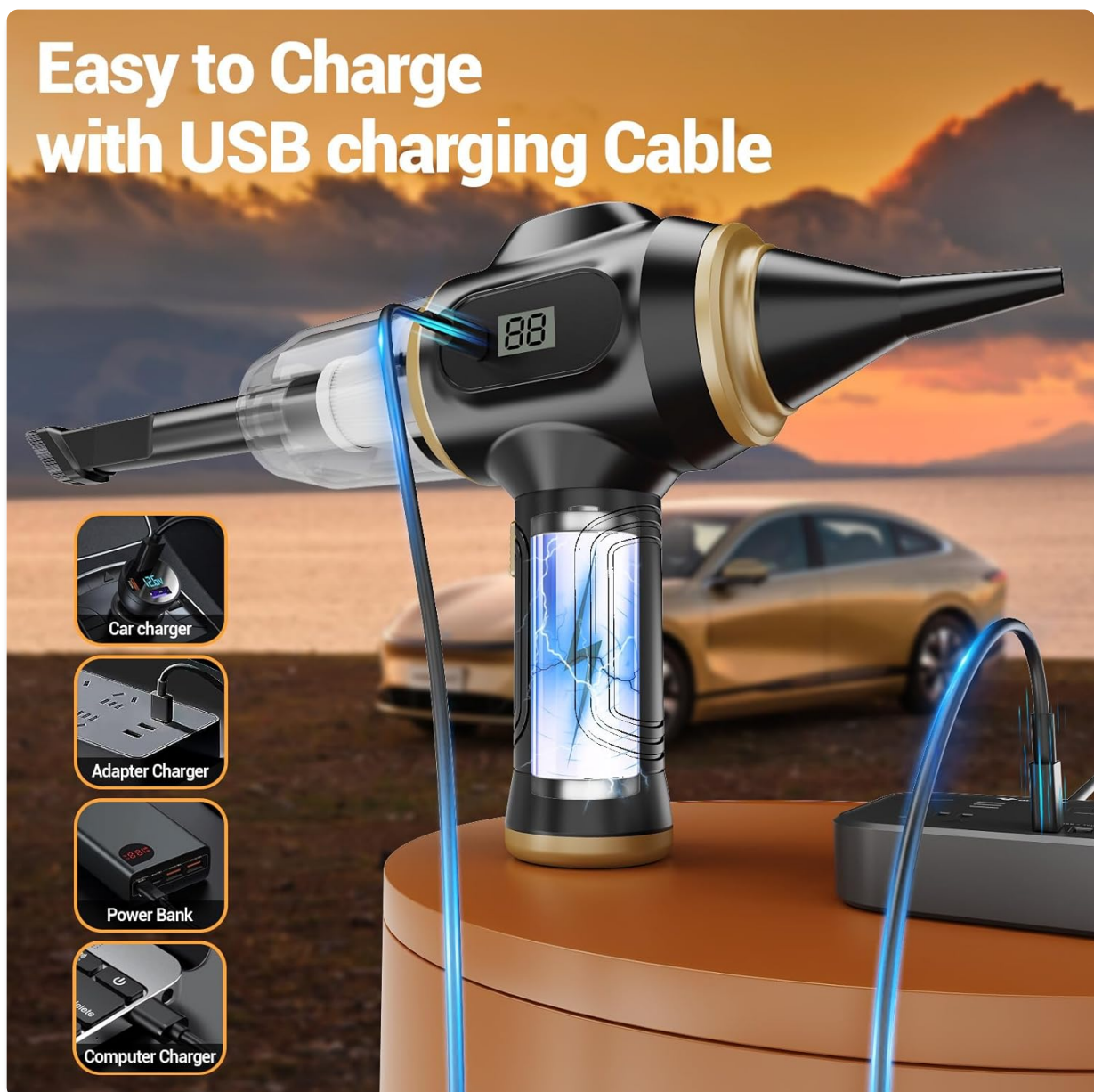
Figure 3.1: The vacuum cleaner being charged using the USB-C cable, illustrating various compatible power sources such as a car charger, adapter, power bank, and computer.