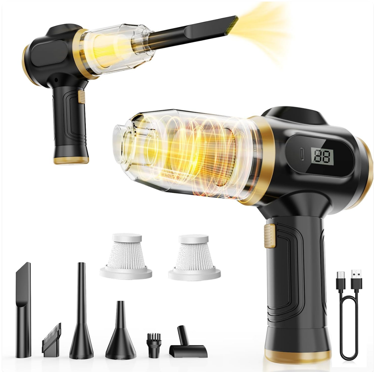
Figure 2.1: The BELIBUY YACQ-1308 Portable Car Vacuum Cleaner shown with all included accessories, including various nozzles, filters, and charging cable.