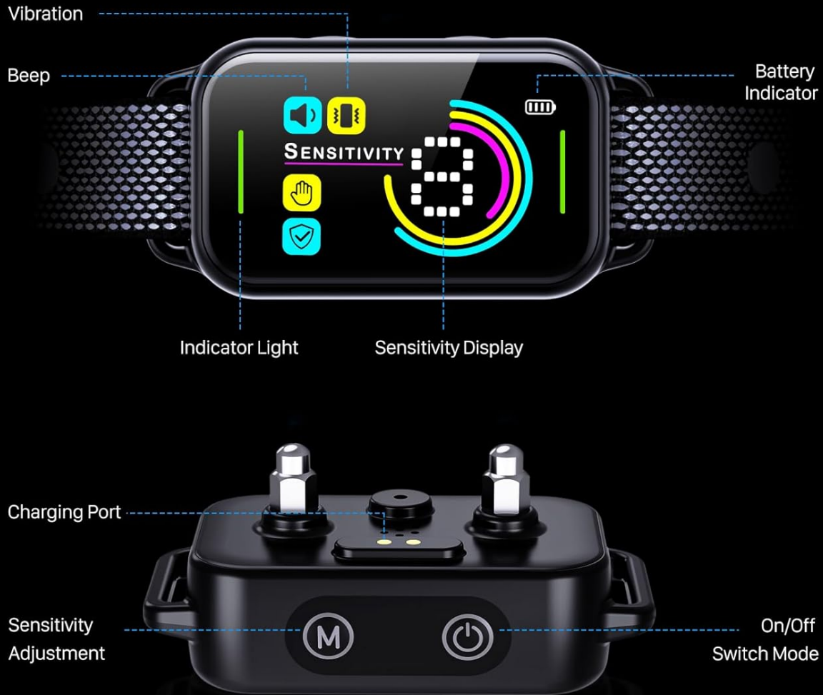
Image: A detailed view of the collar's display and main unit, highlighting key features such as the sensitivity display, battery indicator, and control buttons.