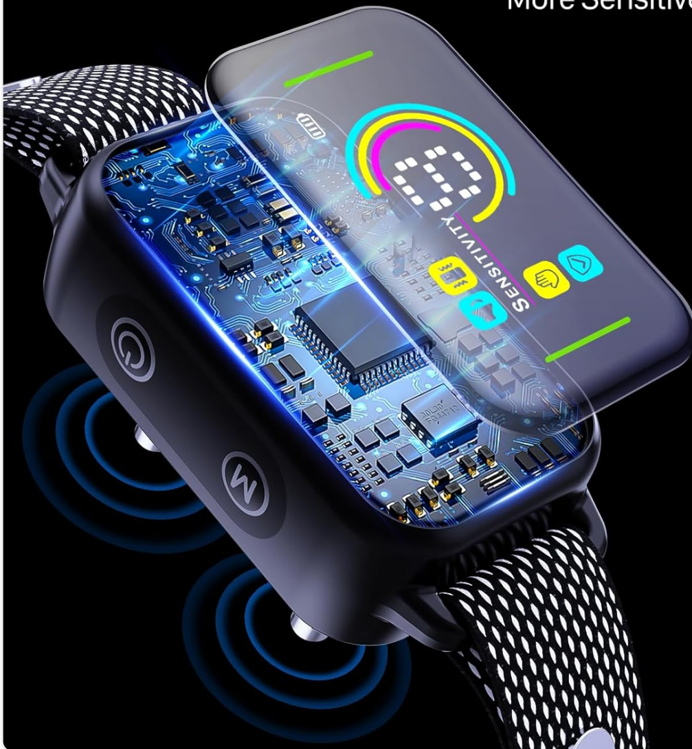
Image: An illustration of the collar's internal smart chip and the upgraded color screen, emphasizing its advanced technology.