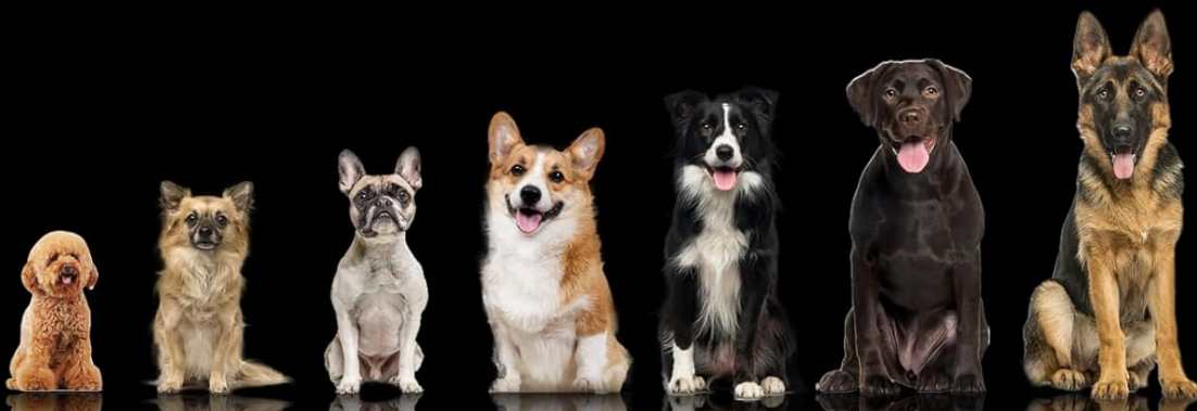
Image: An illustration demonstrating the adjustable nature of the collar and its suitability for a wide range of dog sizes and weights.