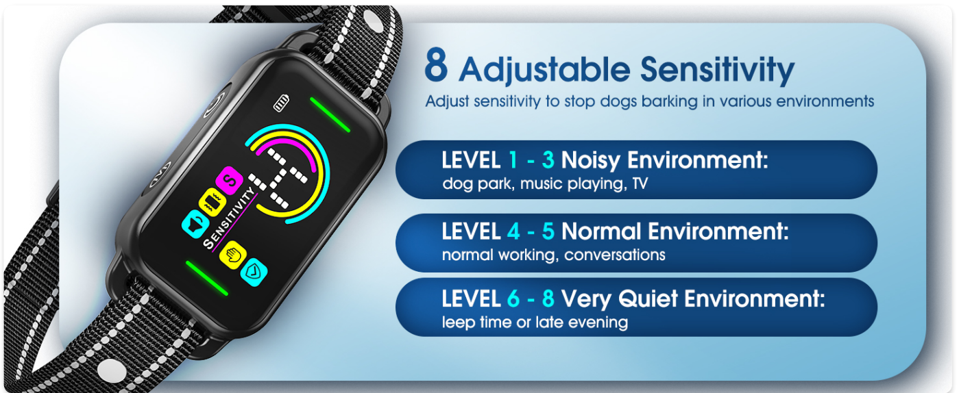
Image: A diagram explaining the different sensitivity levels and when to use each, from noisy to very quiet environments.