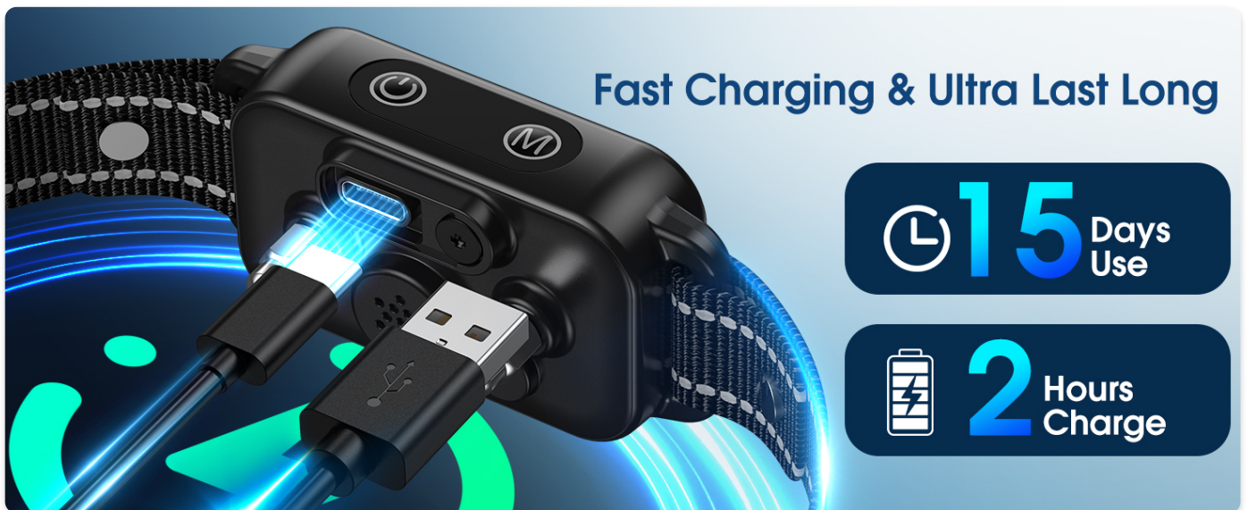
Image: Visual representation of the collar's fast charging capability and long-lasting battery life.