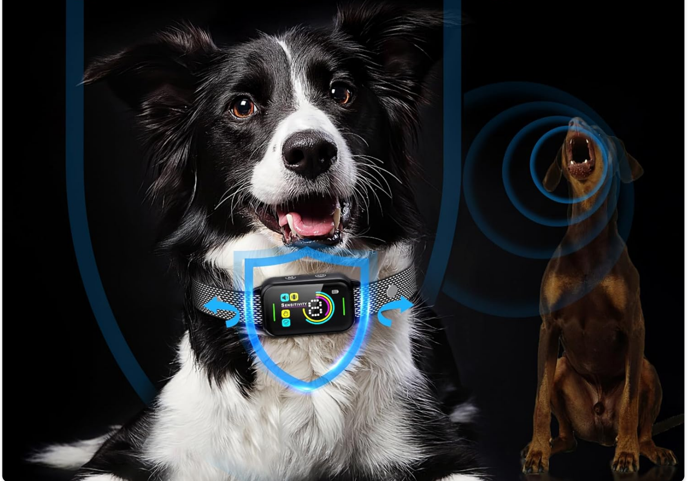
Image: An illustration demonstrating the collar's smart anti-interference feature, which prevents false activations from external sounds or movements.