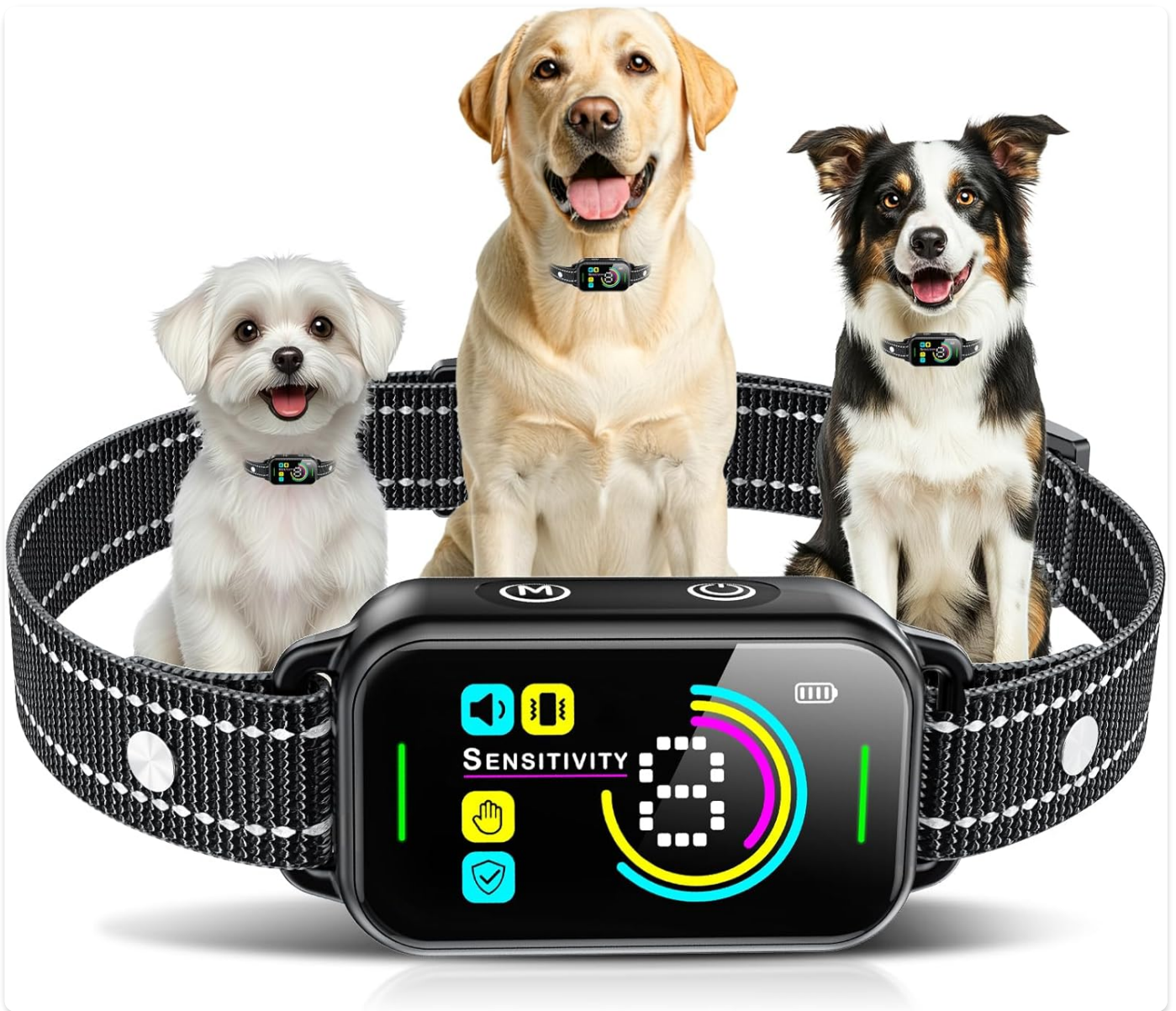
Image: The DINJOO Bark Collar displayed prominently with three dogs of different sizes wearing similar collars, illustrating its suitability for various breeds.