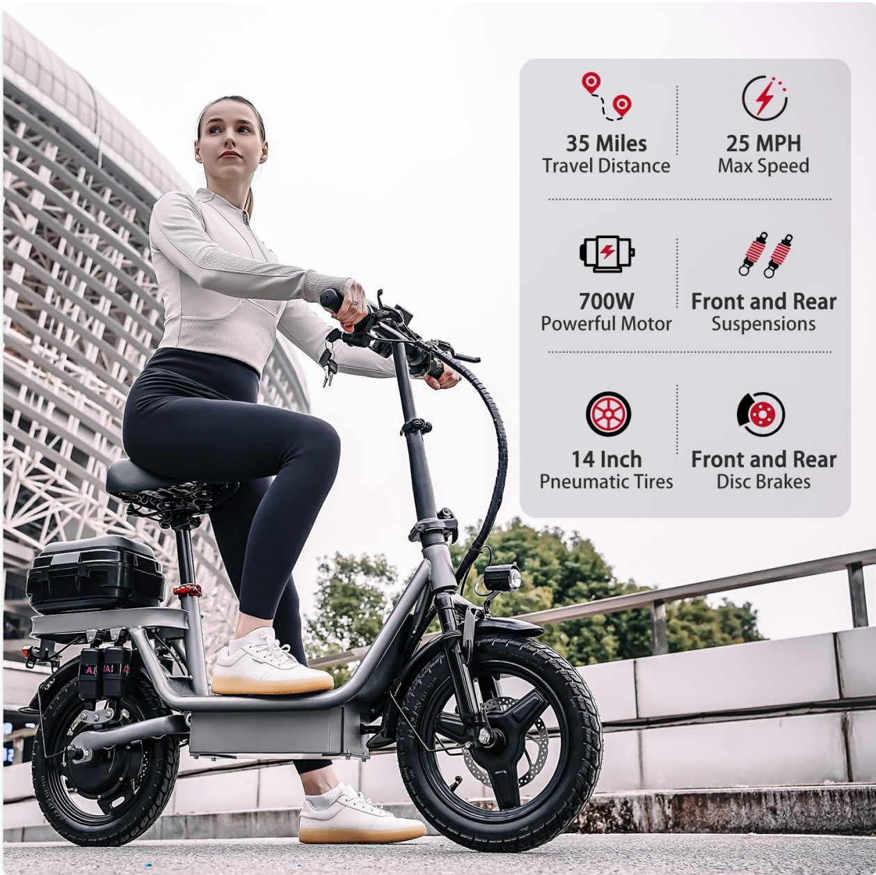
Figure 4.1: Overview of key features and specifications, which are important to understand during initial setup and inspection.