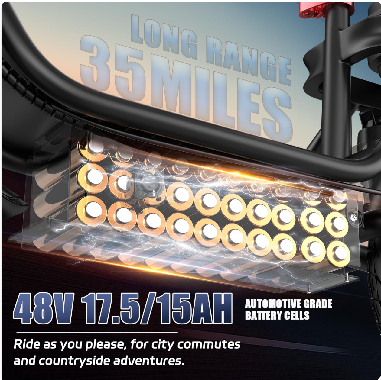
Figure 6.1: The high-capacity 48V 17.5Ah battery, providing extended range for your commutes.