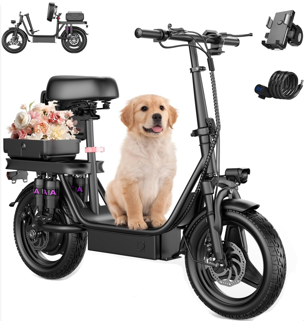
Figure 1.1: The X-koala GQ8 Electric Scooter, highlighting its design and features like the removable seat and storage box.