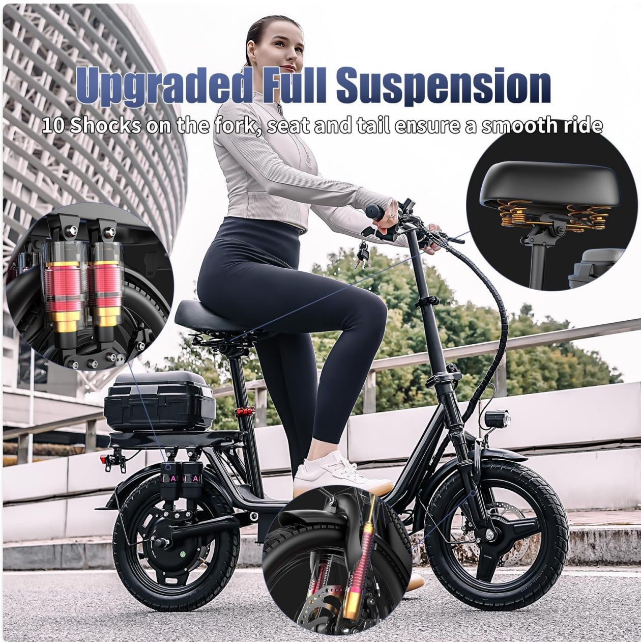
Figure 5.2: The scooter's upgraded full suspension system, designed to efficiently filter vibrations for a smooth ride.