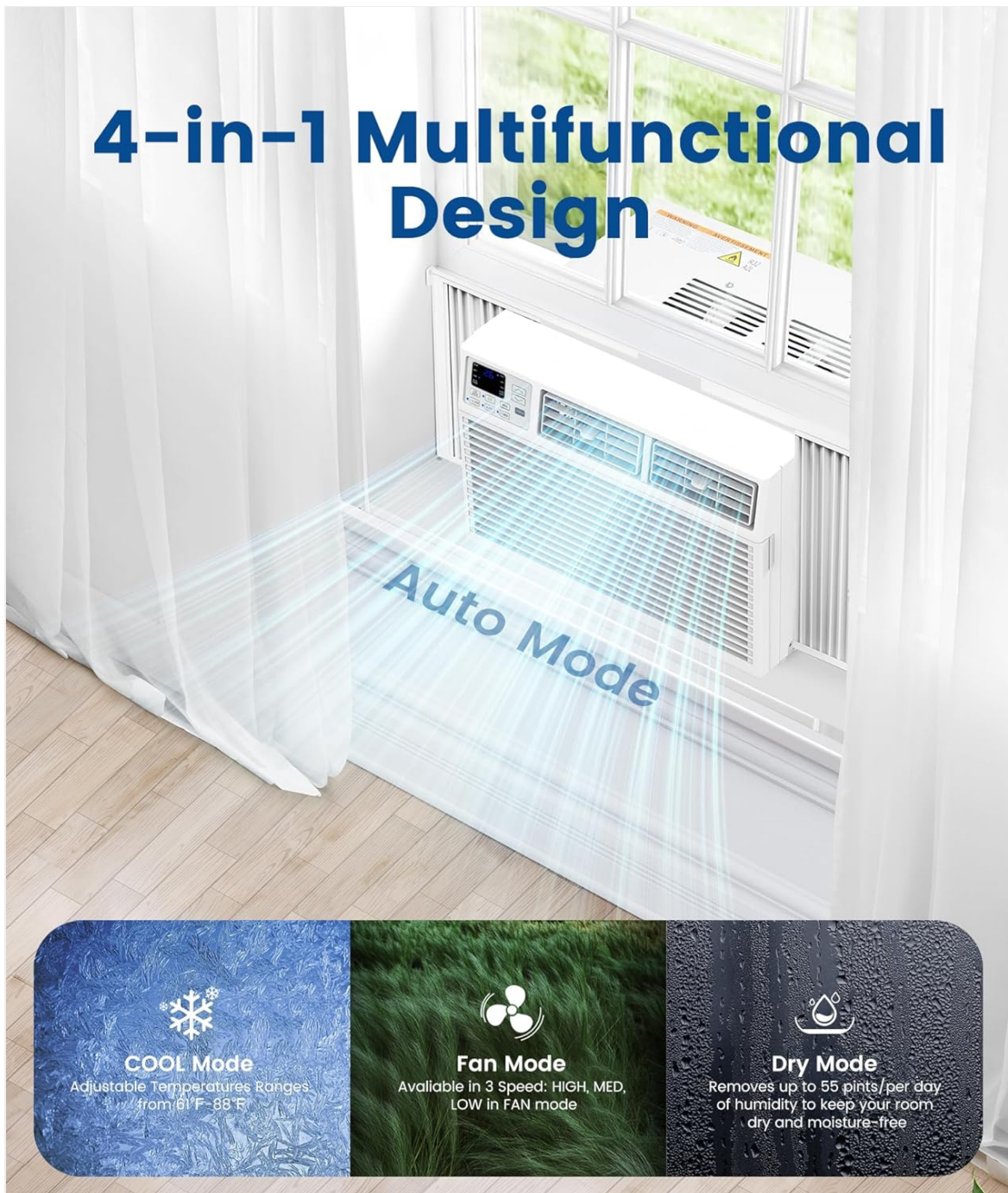
Figure 1: Front view of the COWSAR 10000 BTU Window Air Conditioner.