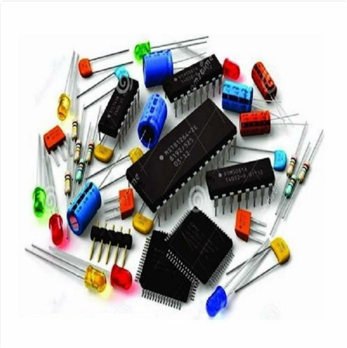
Figure 2: An assortment of electronic components, illustrating the typical environment and parts used in projects with this OLED module. This image represents the broader context of electronic components often used alongside the display.