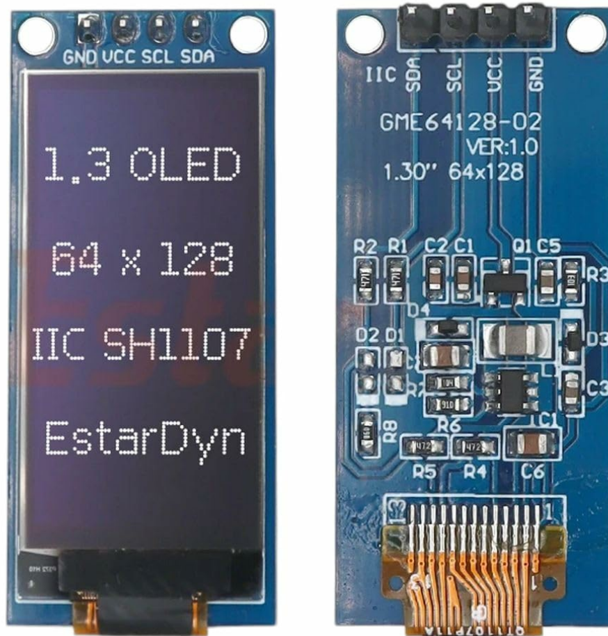
Figure 1: Front and back view of the IEMALORIET 1.3 Inch OLED Display Module. The front shows the 1.3 OLED 64x128 IIC SH1107 display, while the back reveals the circuit board with components and pin labels (GND, VCC, SCL, SDA).