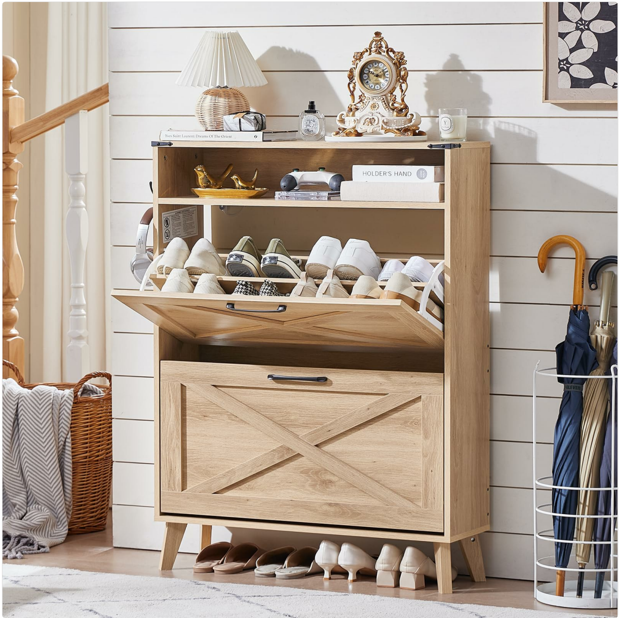
Figure 2: Product View. The Joaxswe 2-Drawer Shoe Storage Cabinet in Natural Oak, featuring its farmhouse design and top shelf for decorative items or small essentials.