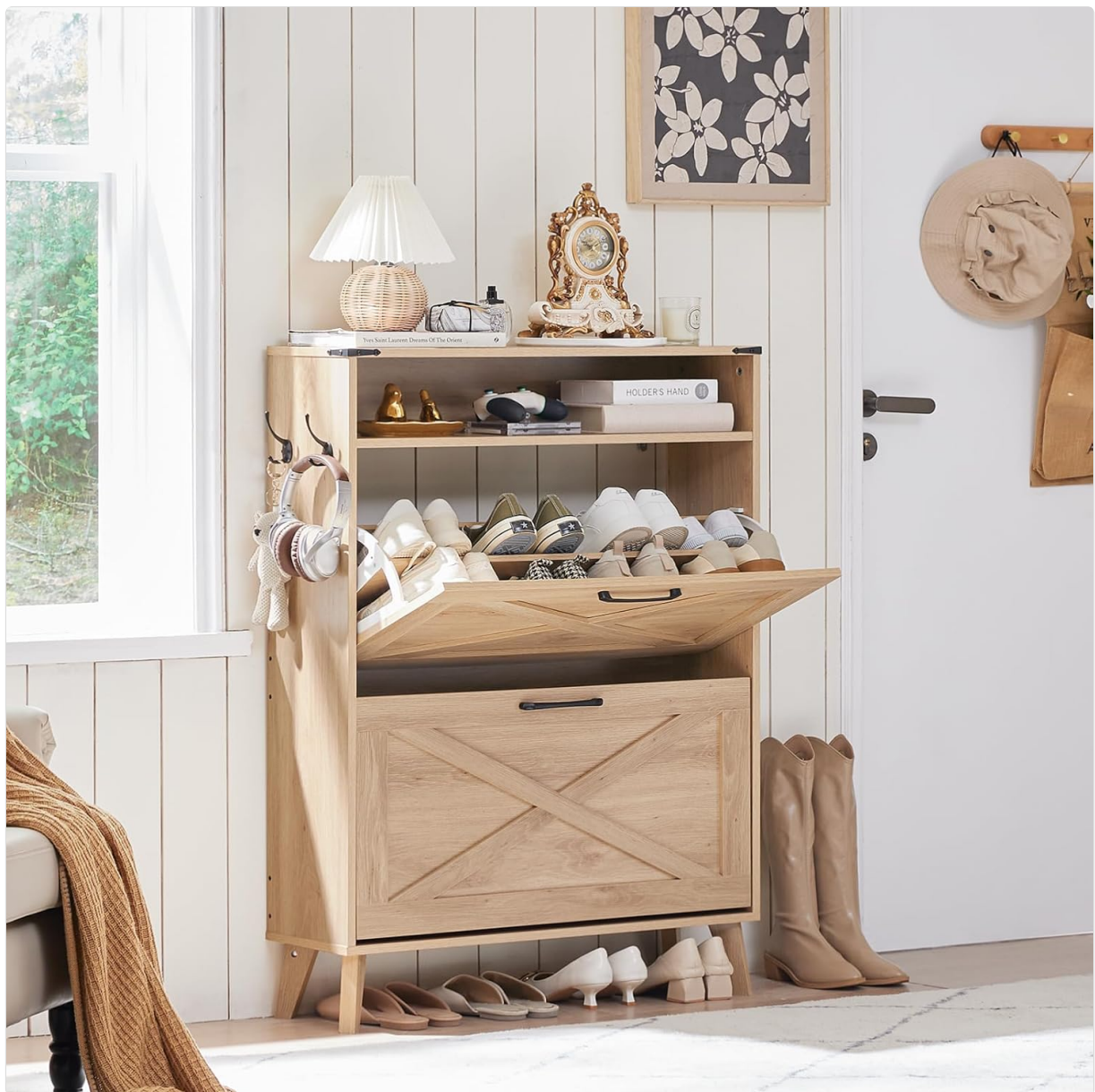
Figure 4: Open Drawer View. The top flip-down drawer is open, displaying shoes neatly organized on its two tiers. This demonstrates the easy access and storage capacity.