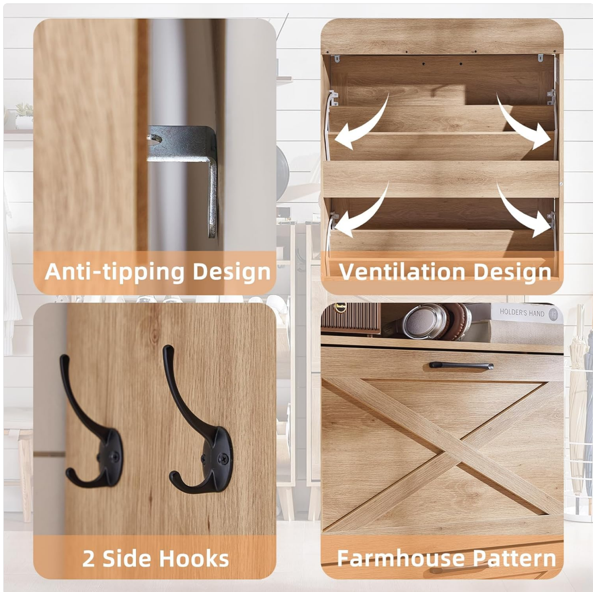
Figure 3: Detailed Features. This image highlights the practical side hooks for hanging items, the ventilation design within the drawers, and the decorative farmhouse pattern on the drawer fronts.