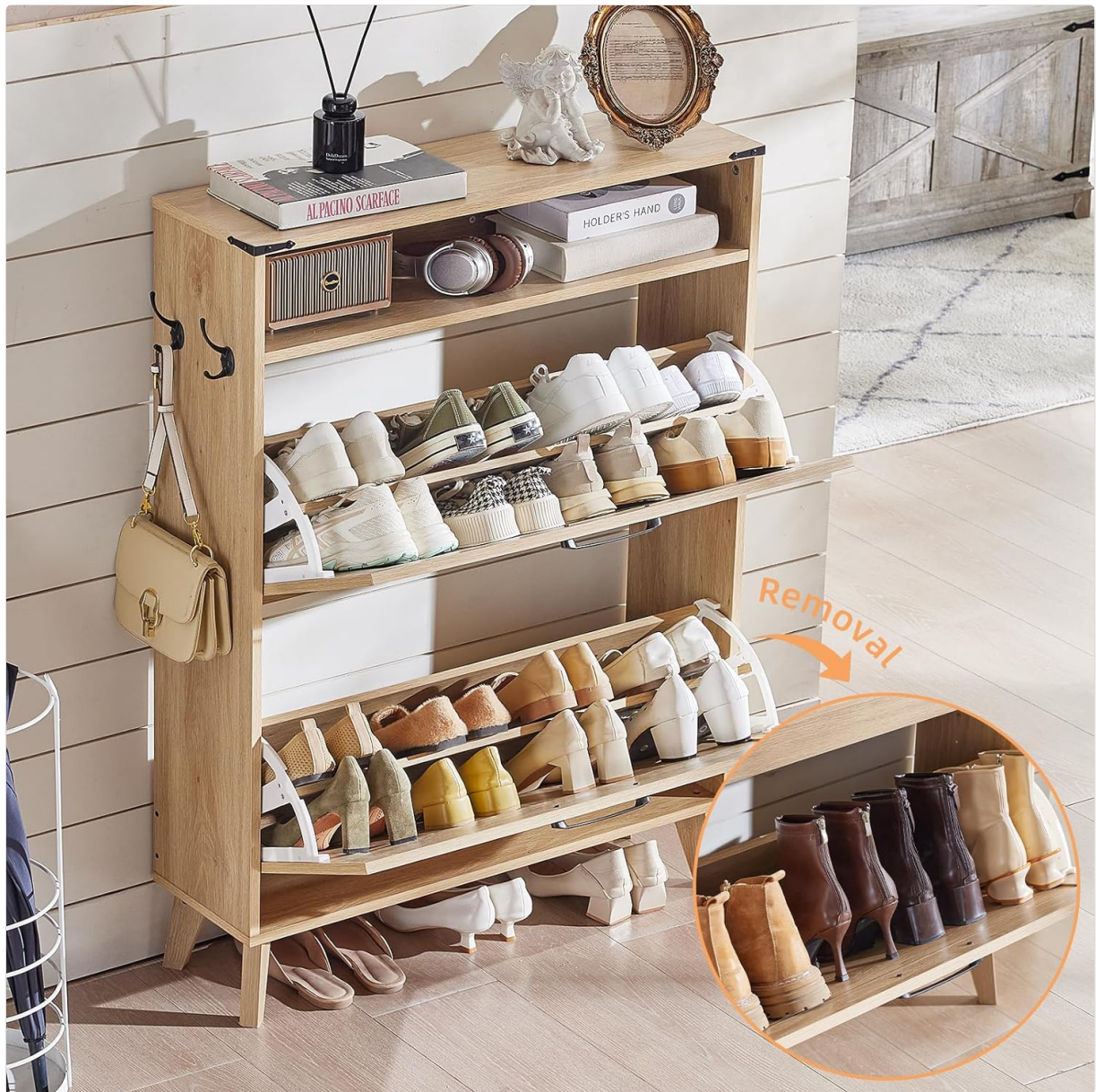
Figure 5: Adjustable Shelf. A detailed view of the adjustable shelf mechanism within a drawer, illustrating how it can be moved to accommodate various shoe heights.