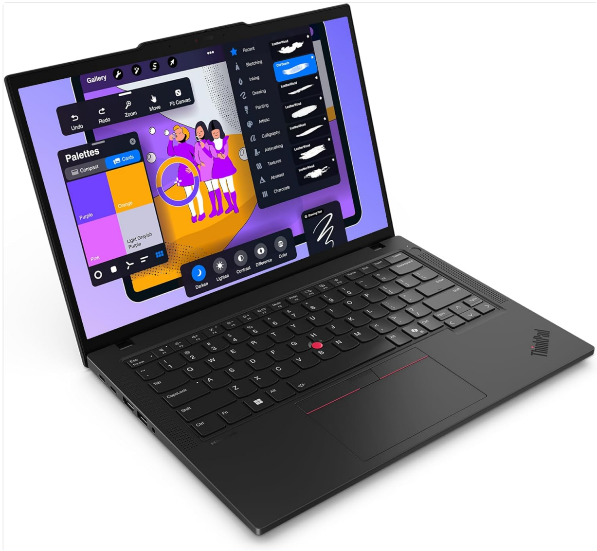
Figure 3: Detailed view of the keyboard and TrackPoint, highlighting the ergonomic design for efficient input.