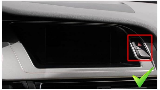
For Audi A4 S4 RS4 B8 8K MMI 3G High (2008-2009) Without AUX Or AMI,Add MOST Adapter.HL8870-1