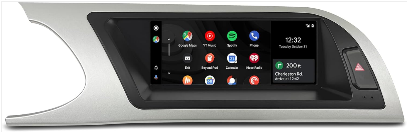
Image: A dynamic representation of various Android applications, including navigation, music, and social media, available on the Hualingan touch screen.