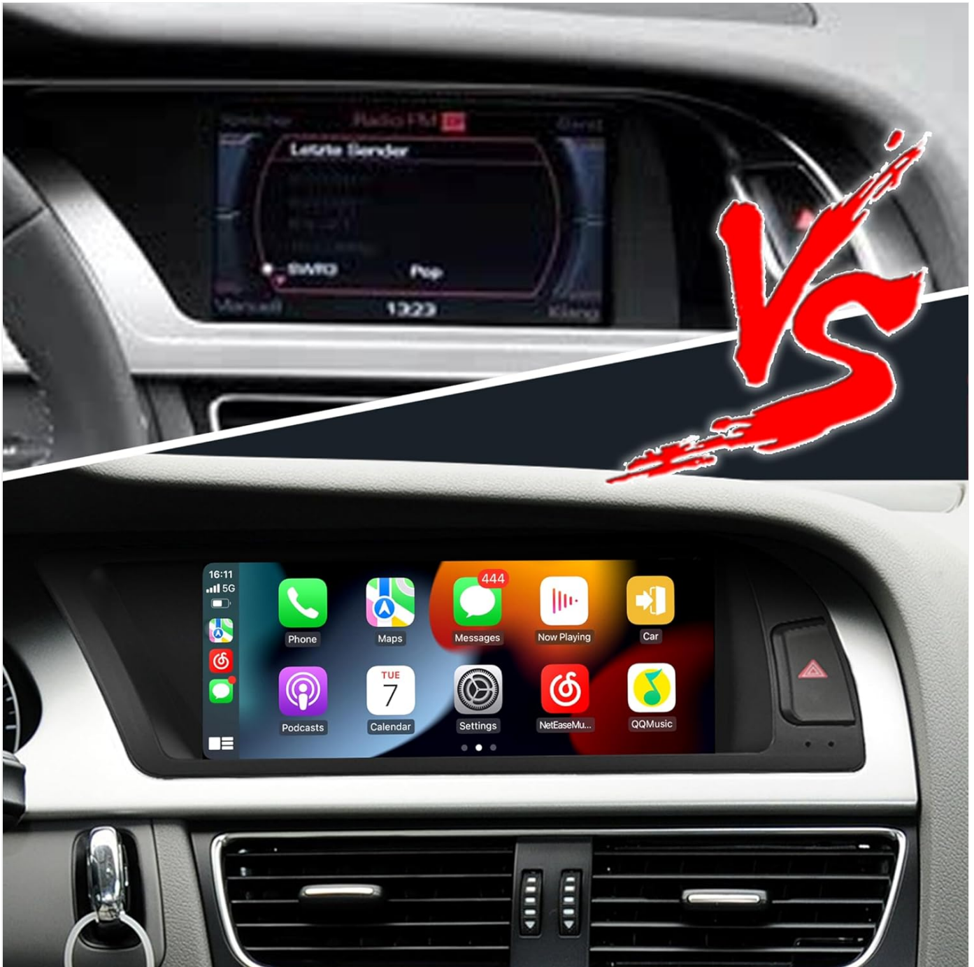
Image: Demonstrates full-screen display of Apple CarPlay and Android Auto, along with AirPlay and Autolink mirroring functionalities.