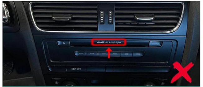
Audi cd changer