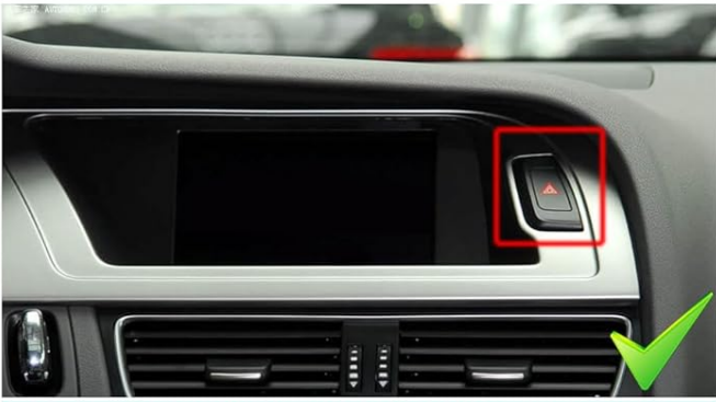
For Audi A4 S4 RS4 B8 8K MMI 3G High (2008-2009) Without AUX Or AMI,Add MOST Adapter.HL8870-1