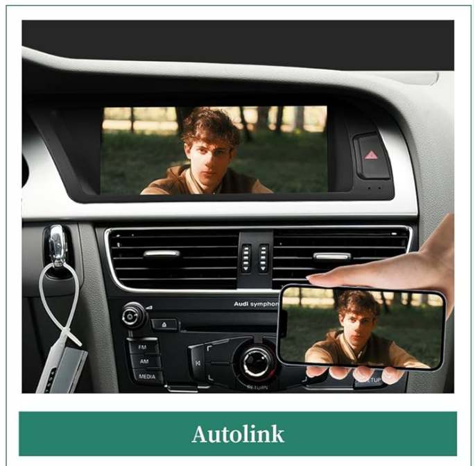
Image: Examples of multimedia functionalities such as video playback, gaming, network TV, online navigation, and music streaming on the Hualingan unit.