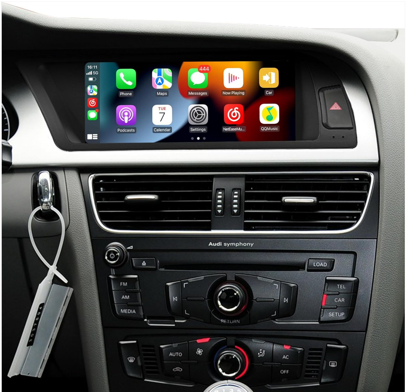
Image: The Hualing 8.8-inch touch screen installed in an Audi dashboard, displaying the Apple CarPlay interface.