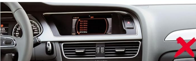
The plastic material beside the emergency light is black