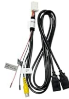
Two USB Cable

Image: A visual comparison highlighting the upgrade from the original Audi screen to the new Hualingan 8.8-inch touch screen with enhanced features.