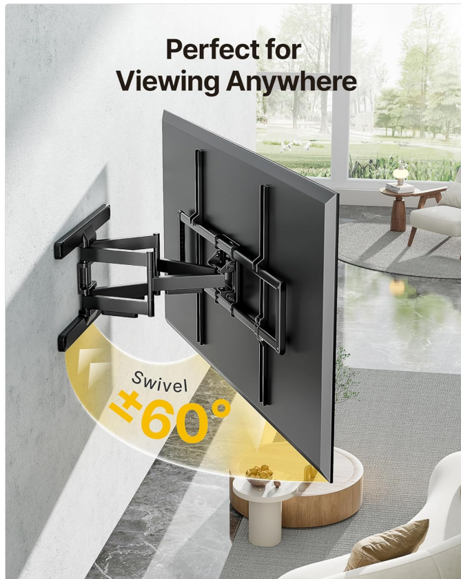
Image: A TV mounted on the monTEK mount, demonstrating the \pm 60^\circ swivel capability.