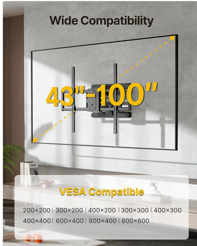
Image: Rear view of a TV with the vertical mounting brackets attached, showing VESA compatibility.