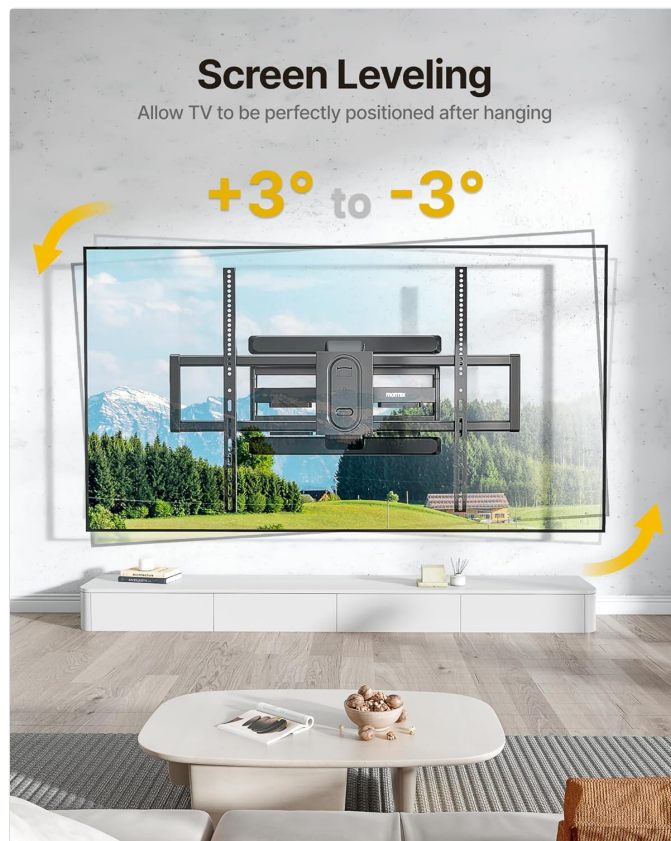
Image: A TV mounted on the wall, demonstrating the \pm 3^\circ screen leveling adjustment feature.

Your browser does not support the video tag.