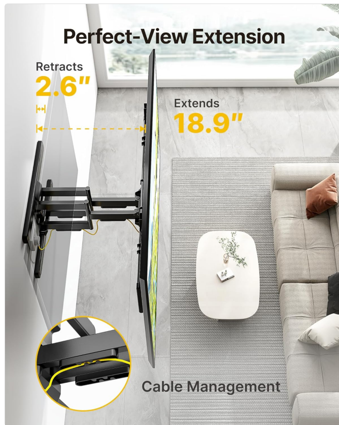
Image: The TV mount showing its extension (18.9") and retraction (2.56") capabilities, along with integrated cable management.