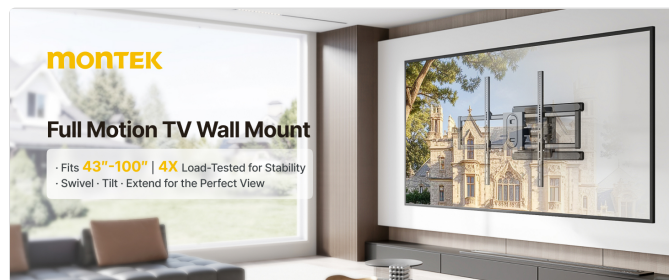
Image: Visual guide for VESA compatibility (200x200mm to 800x600mm) and supported TV sizes (43-100 inches).