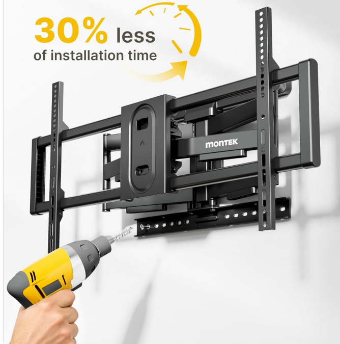
Image: The pre-assembled design of the monTEK TV wall mount, showing ease of installation with a drill.