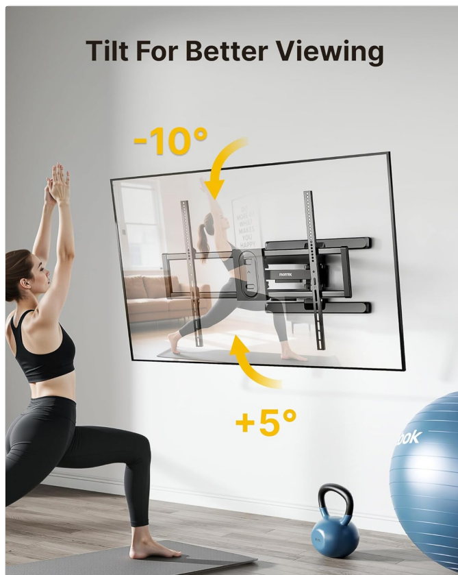
Image: A TV mounted on the monTEK mount, illustrating the +5^\circ to -10^\circ tilt adjustment for optimal viewing.