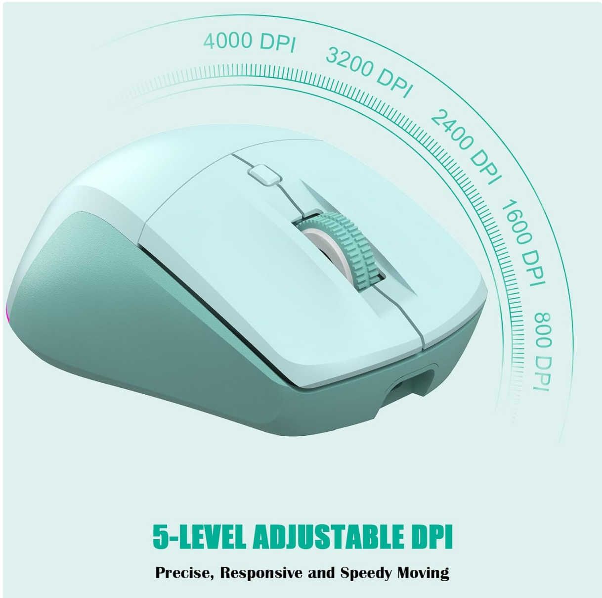
Image: Illustration of the Leadsail Q9 mouse with an overlay showing the 5 adjustable DPI settings.

The mouse features 5 adjustable DPI levels (800/1600/2400/3200/4000) to customize cursor sensitivity. To change the DPI, press the DPI button located behind the scroll wheel. Each press cycles through the available DPI settings.