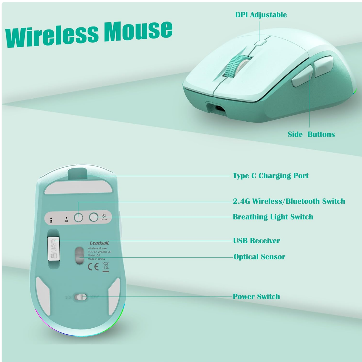
Image: Underside of the Leadsail Q9 mouse, highlighting key components like the power switch, connectivity mode switch, breathing light switch, USB receiver storage, and optical sensor.