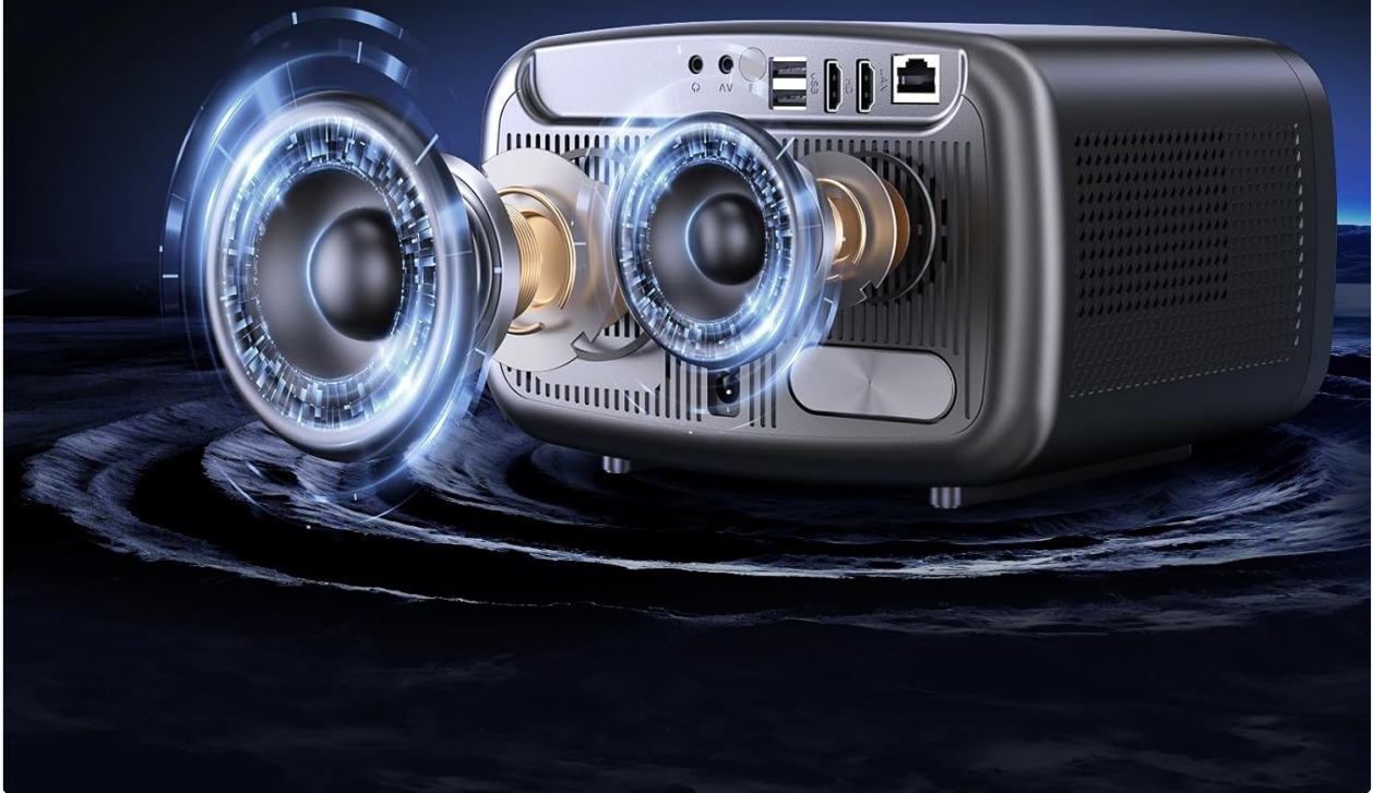
Figure 2.2: 36W Immersive Stereo Sound System