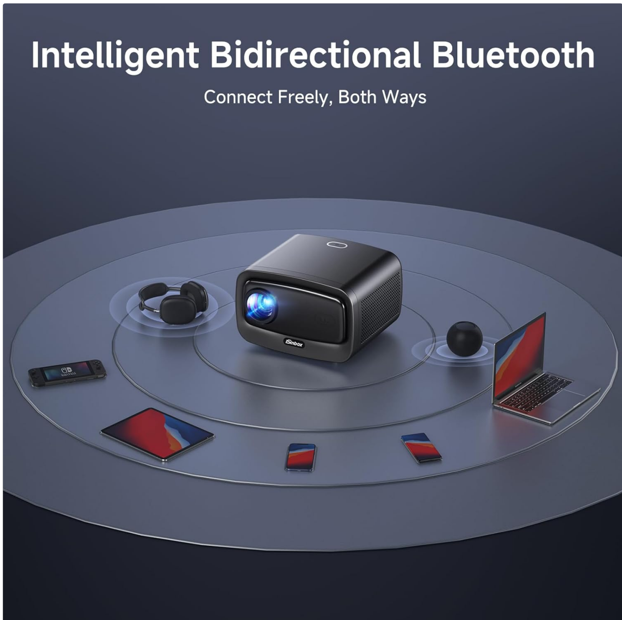
Figure 5.1: Intelligent Bi-directional Bluetooth Connectivity