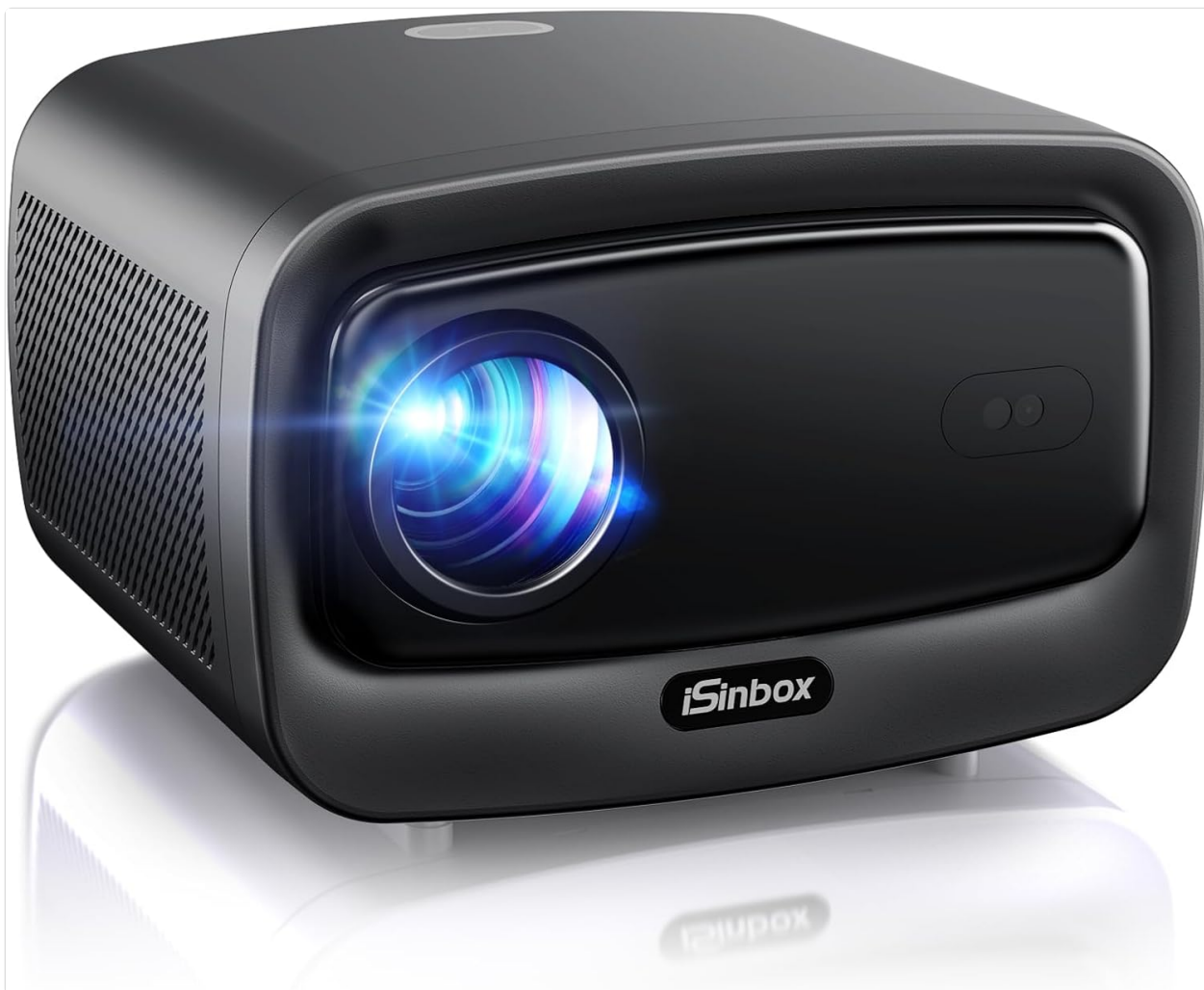
Figure 1.1: iSinbox JY821 Projector Overview

This user manual provides detailed instructions for the setup, operation, and maintenance of your iSinbox JY821 Projector. Please read this manual thoroughly before using the projector to ensure proper functionality and to maximize your viewing experience. Keep this manual for future reference.