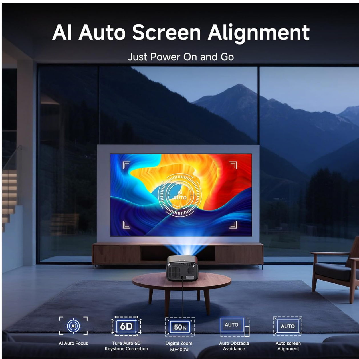
Figure 3.1: AI Auto Screen Alignment in action