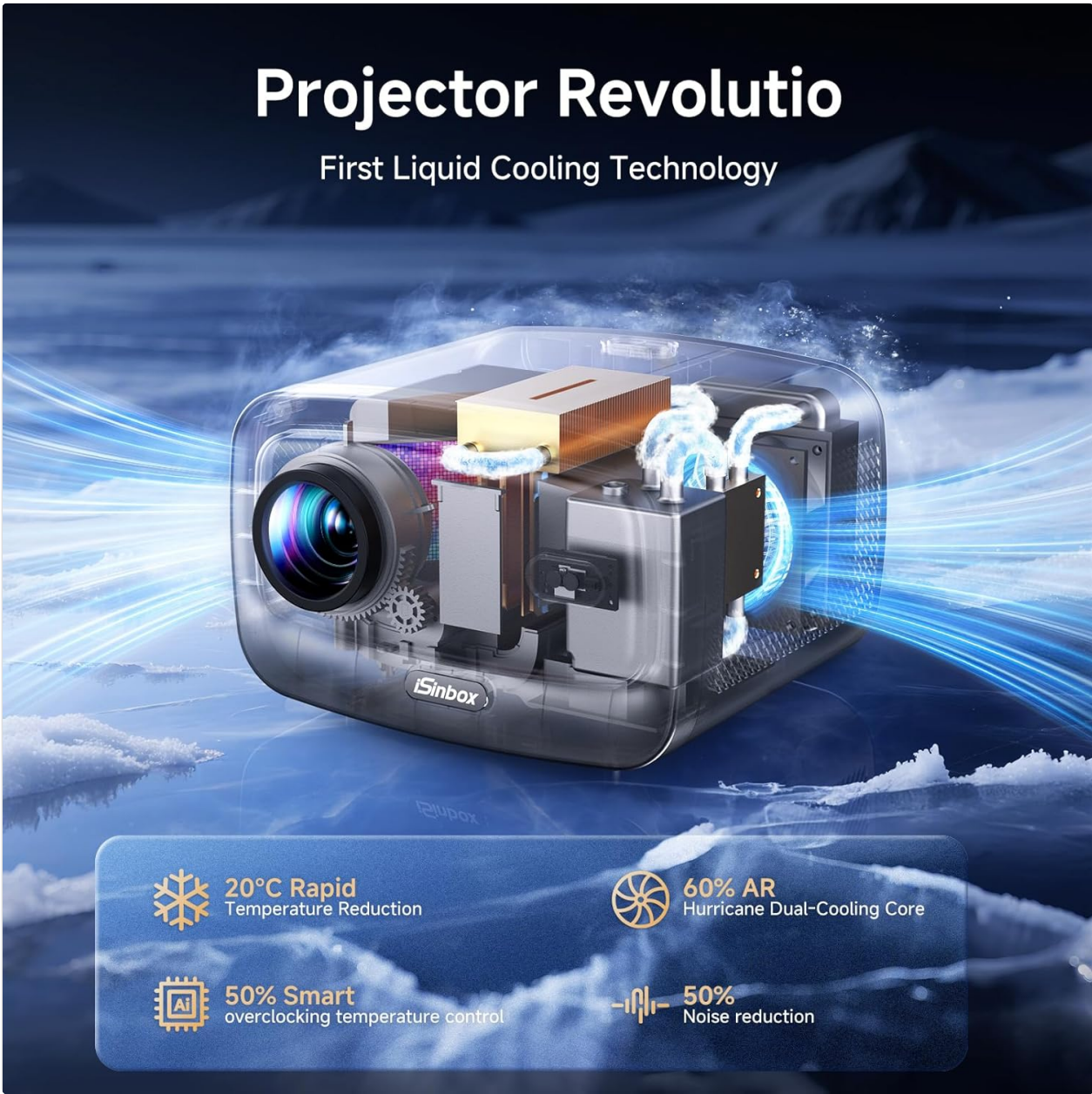
Figure 6.2: Liquid Cooling Technology