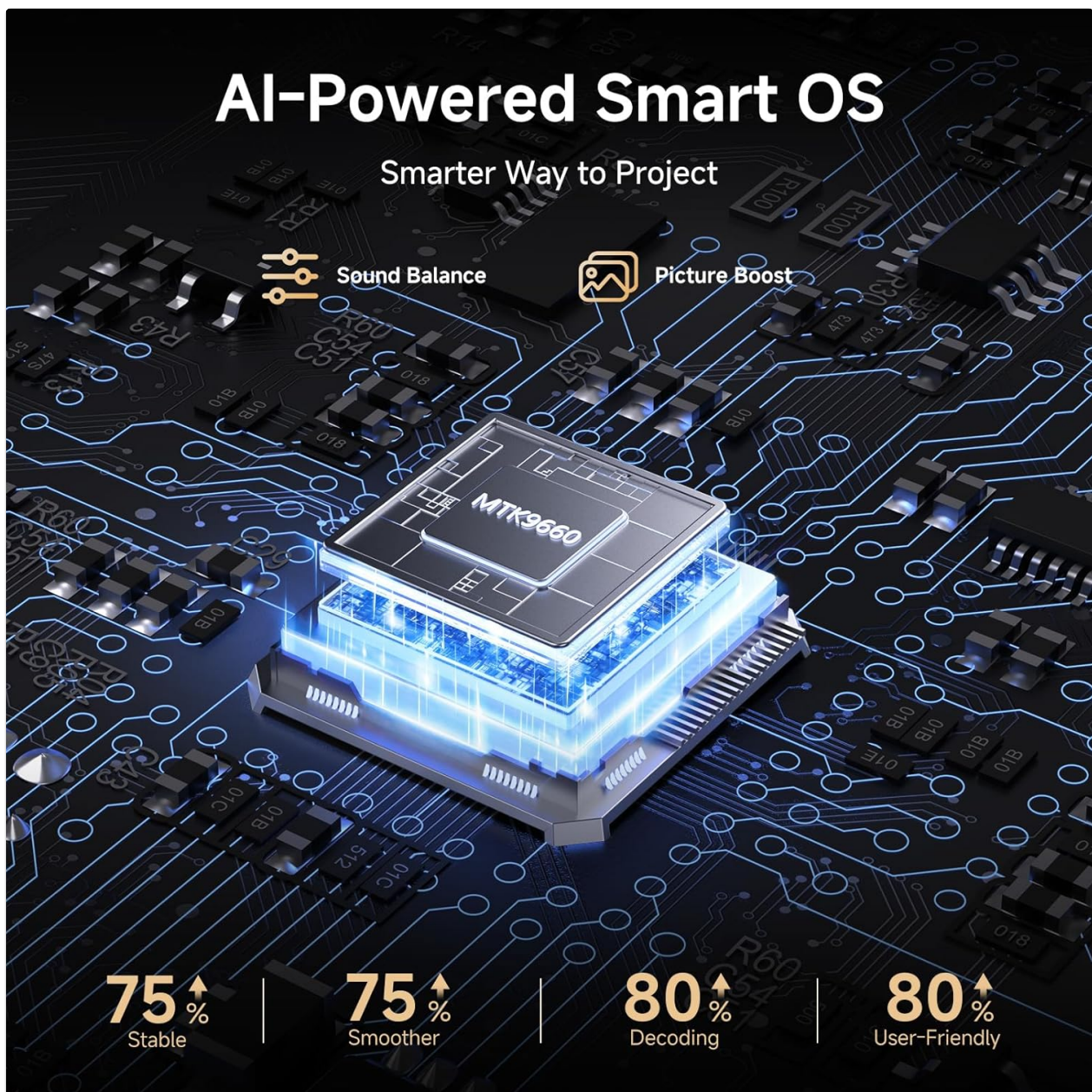
Figure 4.1: AI-Powered Smart Operating System