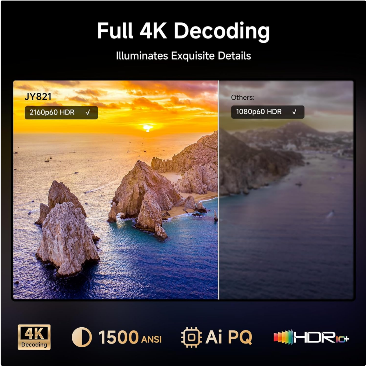
Figure 2.1: Full 4K Decoding Capability