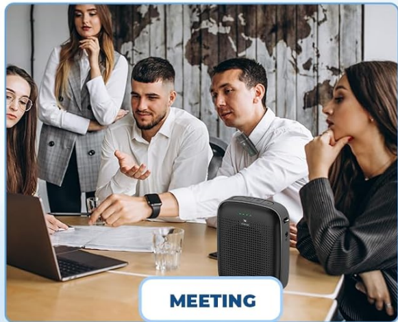
Image: Collage depicting the A006 Voice Amplifier being used in diverse professional settings, highlighting its versatility.