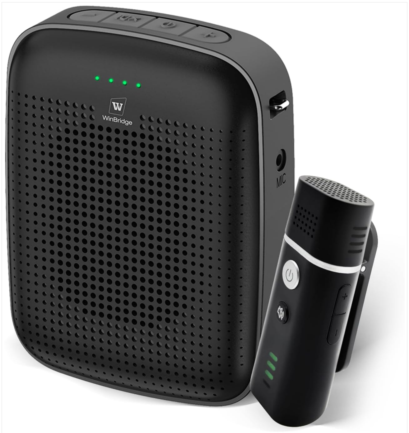
Image: The A006 Voice Amplifier and its accompanying wireless lapel microphone, showcasing the compact design of both units.