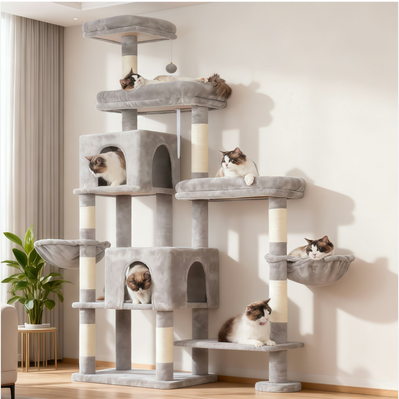
Image 1.1: Overall view of the Hey-brother XXL Cat Tree with cats.