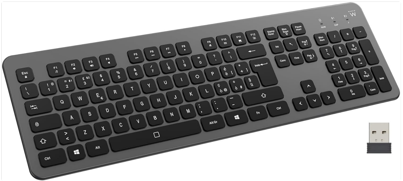
Figure 4.2: Ewent EW3295 keyboard and its USB wireless receiver.