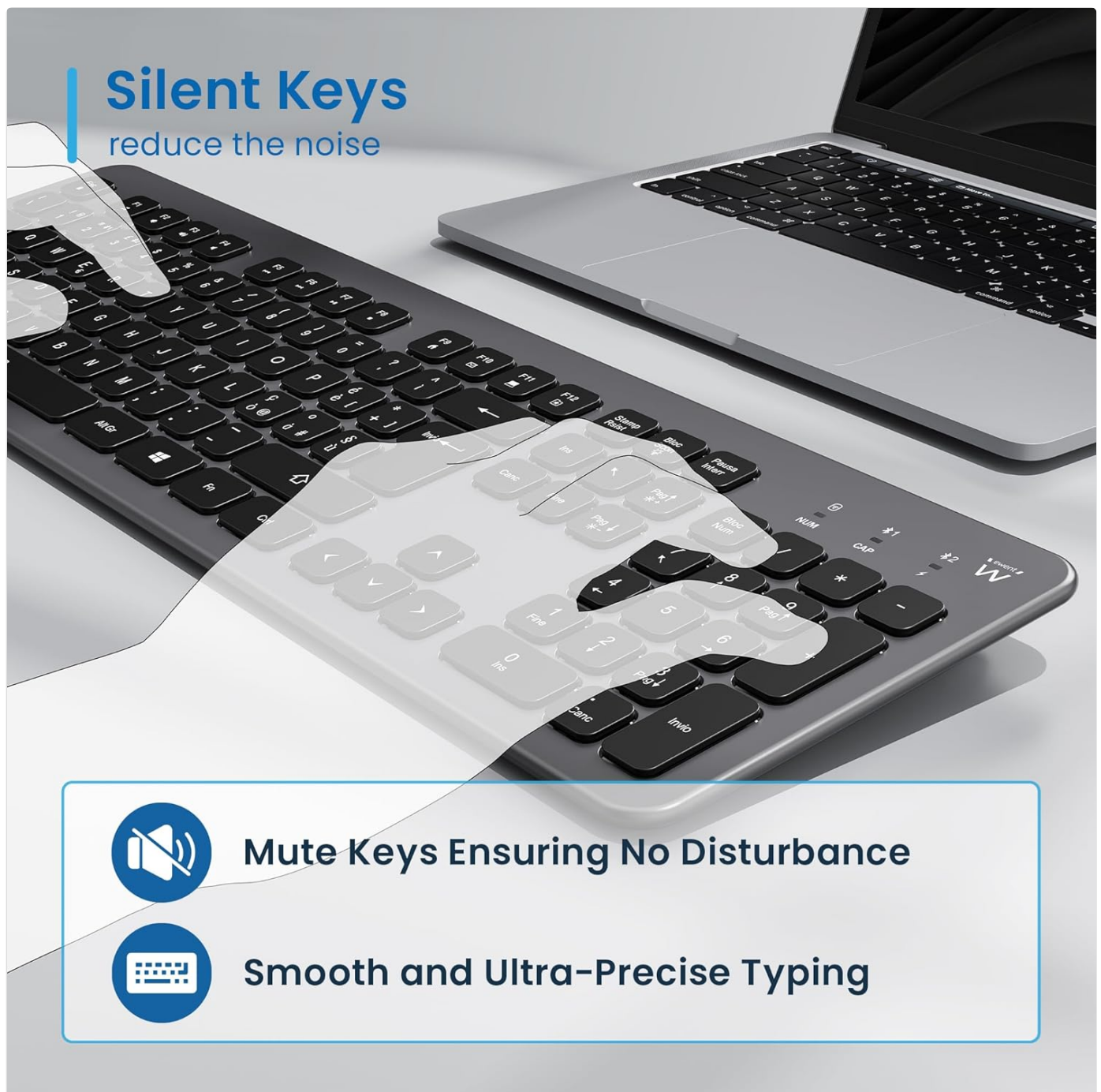
Figure 5.2: Silent keys for reduced noise.