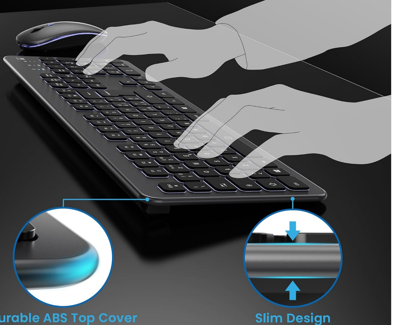
Figure 1.1: Slim and sturdy design of the EW3295 keyboard.

low profile and optimal angle ensure maximum precision and comfort for long typing