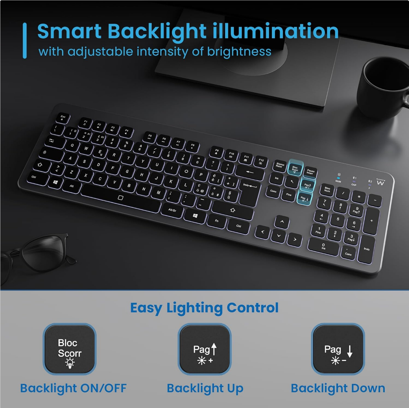
Figure 5.3: Backlight control keys.

The keyboard includes 12 dedicated multimedia keys (F1-F12) that provide quick access to various functions. To use these functions, press the Fn key simultaneously with the desired F-key.