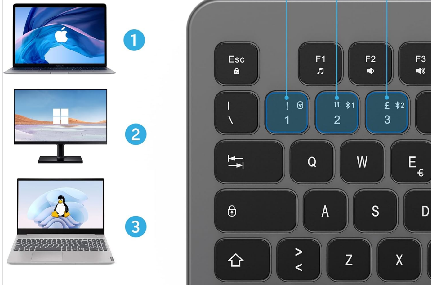
Figure 4.3: Multi-device connectivity options for the EW3295 keyboard.