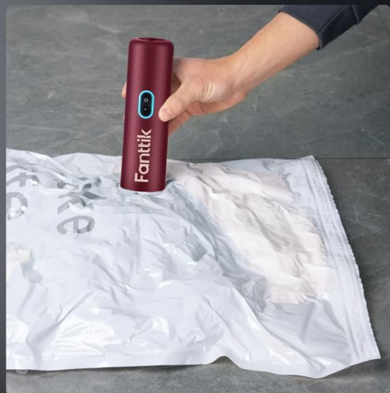
Storage Bag Vacuum

Overview of the four versatile functions of the Fanttik Slim V8 Apex. Video demonstrating the 4-in-1 multifunctional capabilities of the mini car vacuum cleaner.