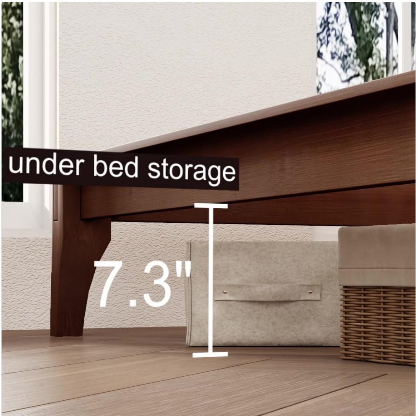
Figure 2: Overview of key design features, including the mortise and tenon structure for easy assembly and the 7.3-inch under-bed storage clearance.

not overtighten to avoid damaging the wood.