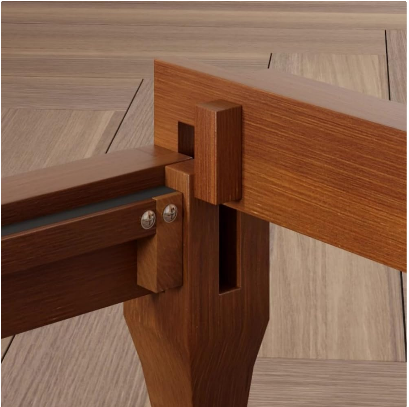
Figure 3: Detailed view of the mortise and tenon joint, illustrating the secure and tool-less connection method for frame components.