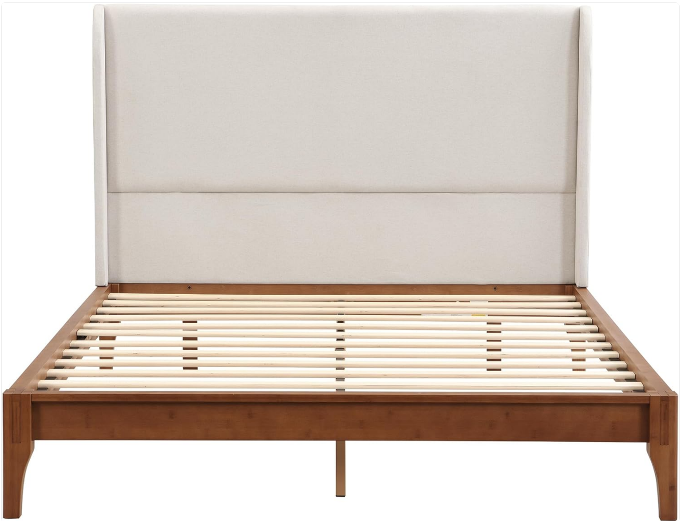
Figure 6: A front view of the Polibi King Size Platform Bed, highlighting the upholstered wingback headboard and the natural bamboo wood frame.