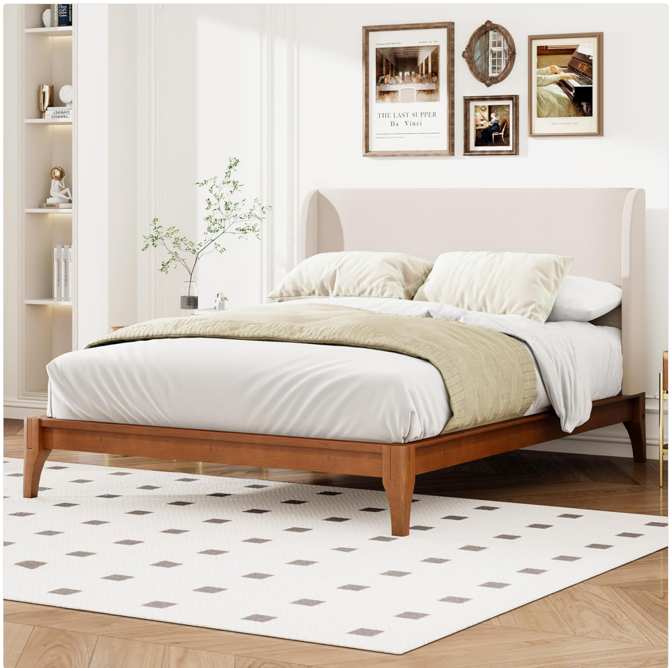
Figure 5: The Polibi King Size Platform Bed fully assembled and dressed, ready for use in a bedroom.