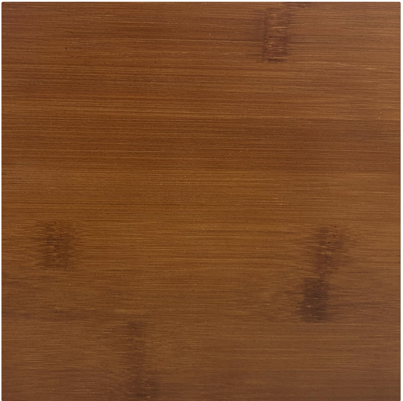
Figure 7: A close-up of the natural bamboo wood texture, showcasing the material's inherent beauty and grain.