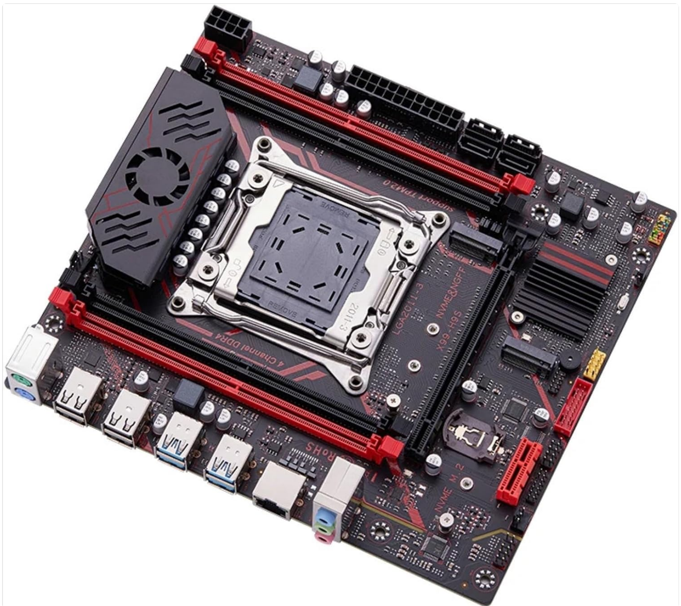
Figure 1.1: Top-down view of the DIBTEBB X99 Motherboard, showcasing its layout with the CPU socket, RAM slots, and various connectors.