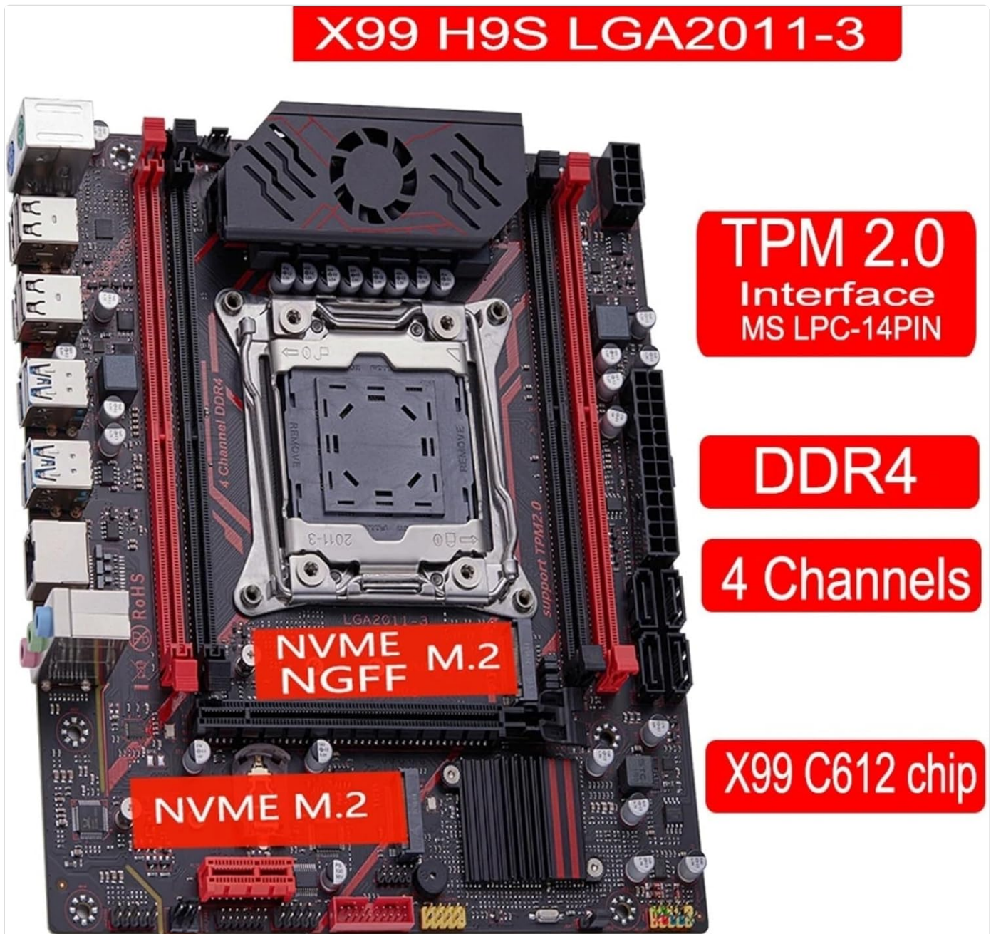
Figure 3.1: Visual representation of the motherboard highlighting key features such as LGA2011-3 socket, TPM 2.0 interface, DDR4 quad-channel support, NVME NGFF M.2, and X99 C612 chip.