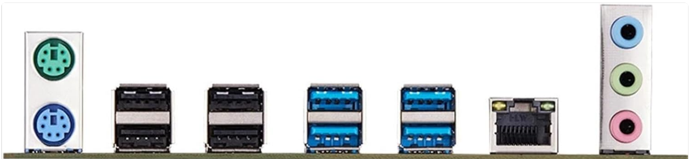
Figure 4.2: Close-up view of the rear I/O panel, showing the PS/2 ports, USB 2.0 ports, USB 3.0 ports, Gigabit Ethernet port, and audio jacks.