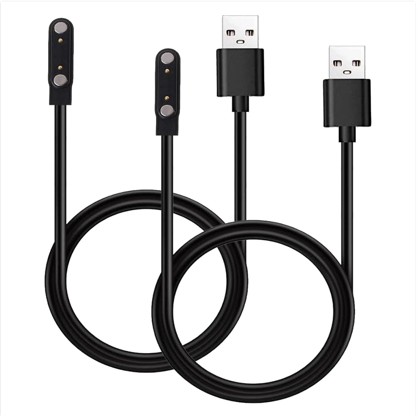
Figure 4: Detailed view of the charging cable's features, highlighting the N52 magnet for strong adsorption and the pure copper probe for sensitive contact and fast charging.