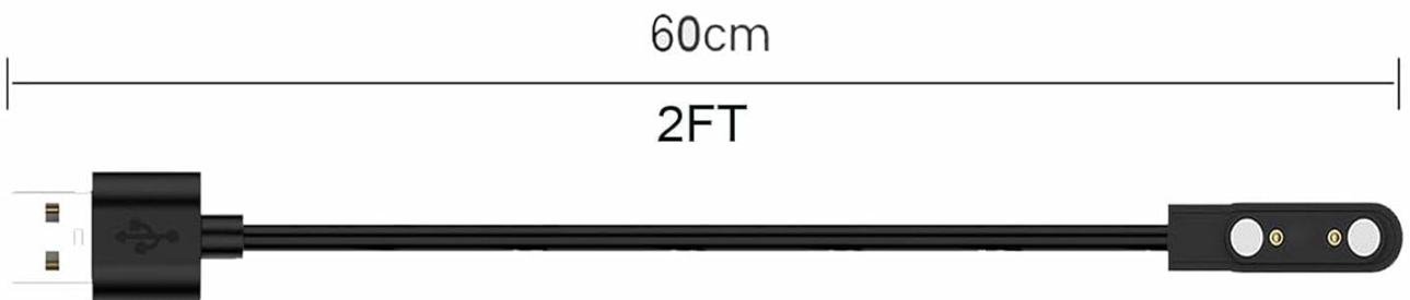
Figure 5: The portable design allows for convenient charging in diverse settings.