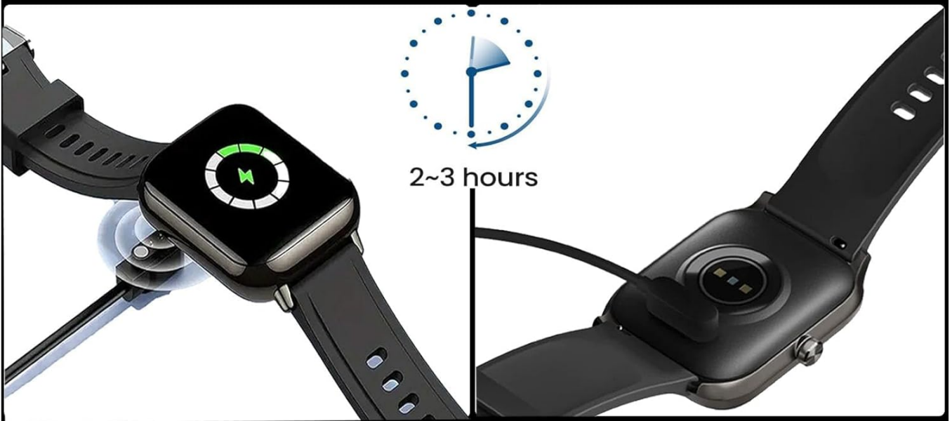
Figure 2: Connect the USB end to a power source such as a laptop, power bank, wall charger, or computer.