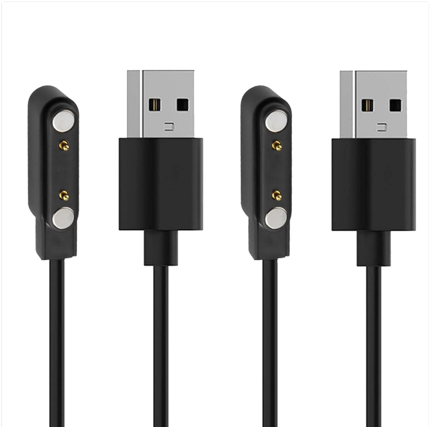
Figure 1: The Xininyia V69 Smartwatch USB Charging Cable Cord (2-pack).

The package includes two magnetic charging cables, each 60cm in length. These cables are designed for compatibility with various V69 series smartwatches, including AMAZTIM V69, FILIEKEU V69, COLMI V69, Mingtawn V69, and Mingdahn V69 models.