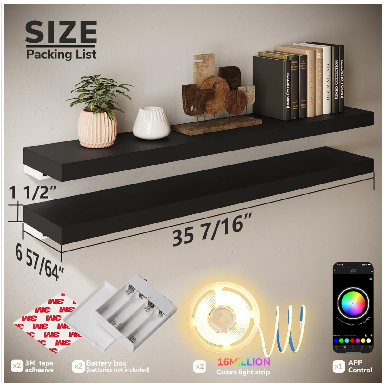
Figure 3.1: Package Contents and Dimensions