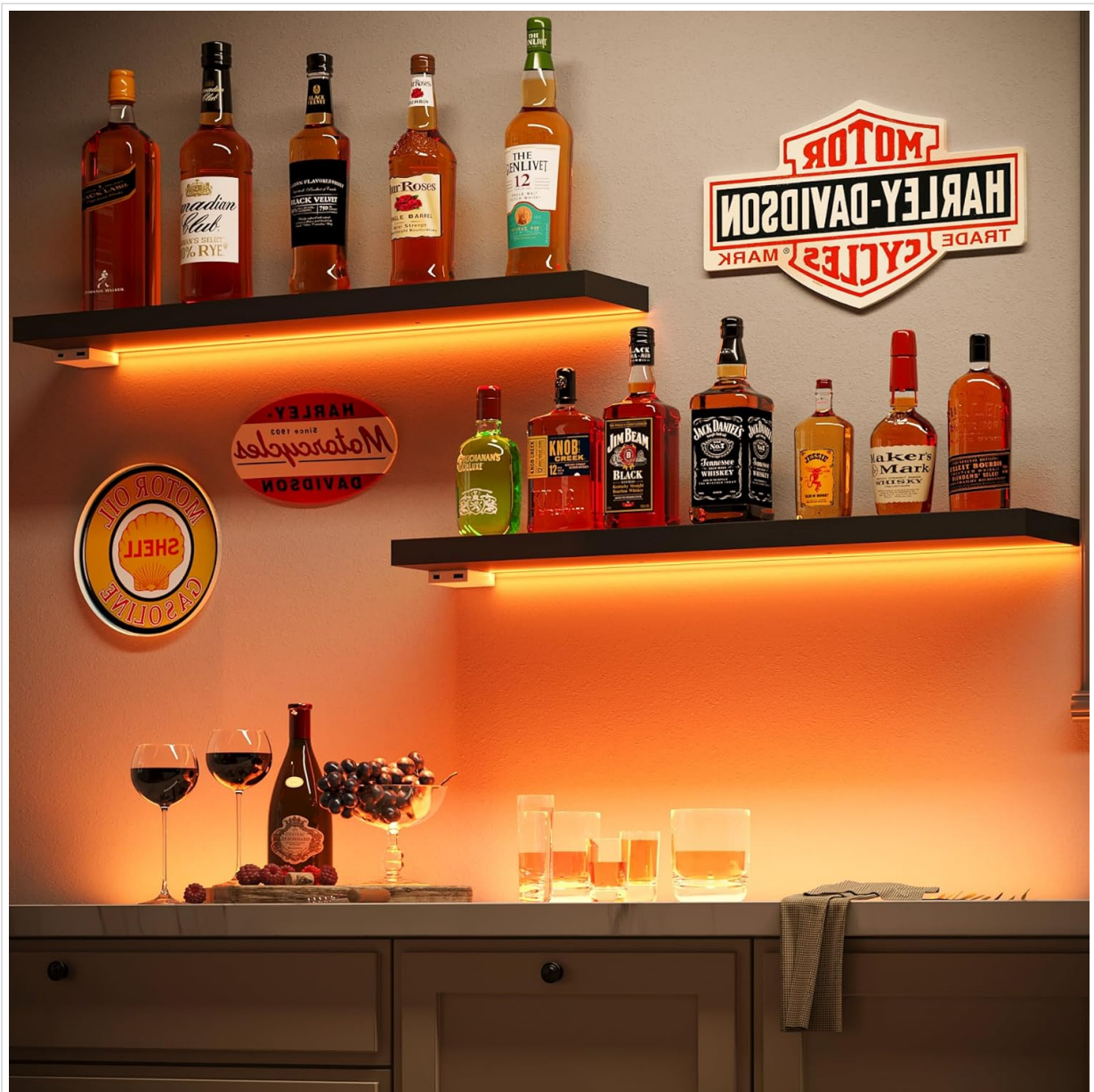
Figure 5.2: Installed Floating Shelf Example