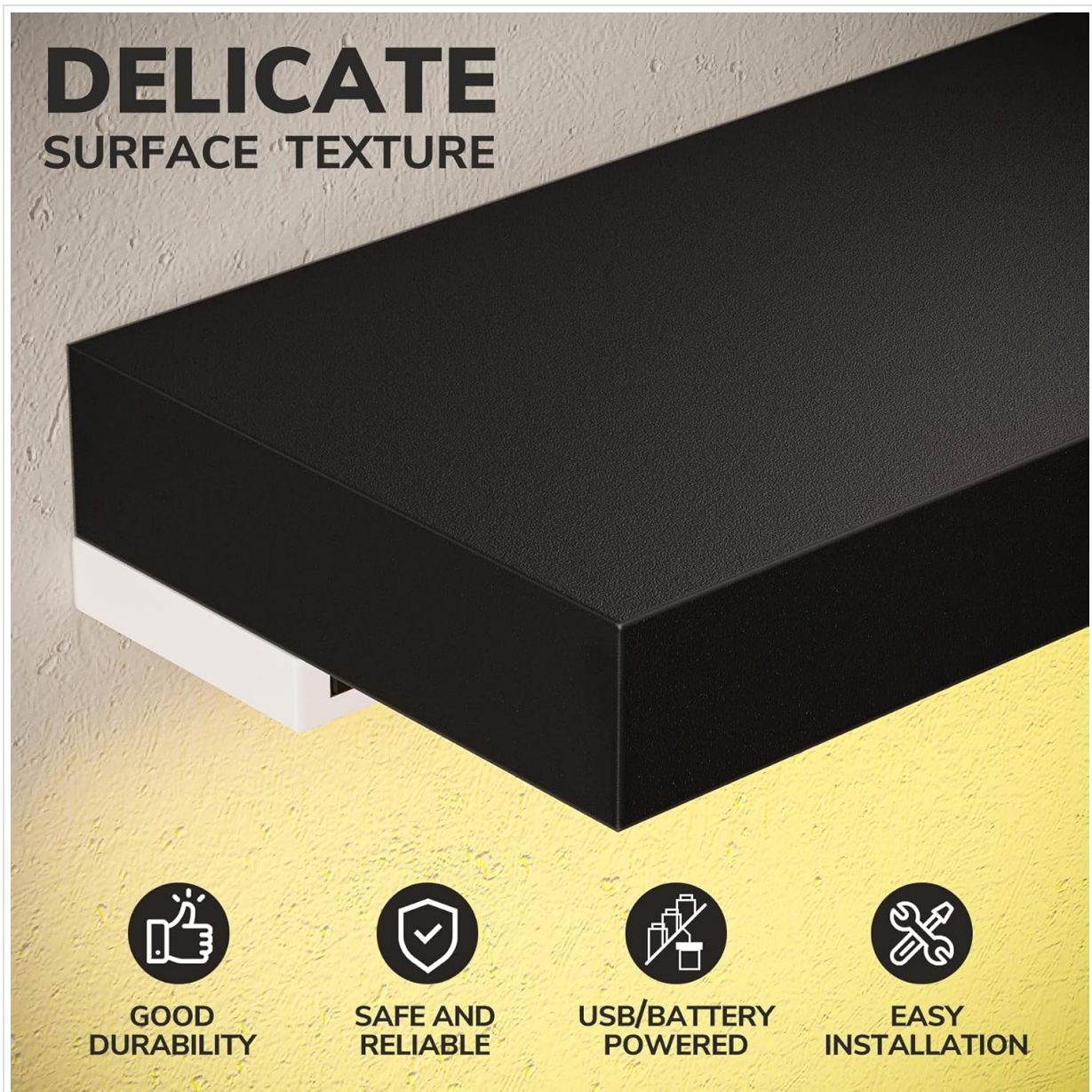
Figure 5.3: Shelf Features and Power Options