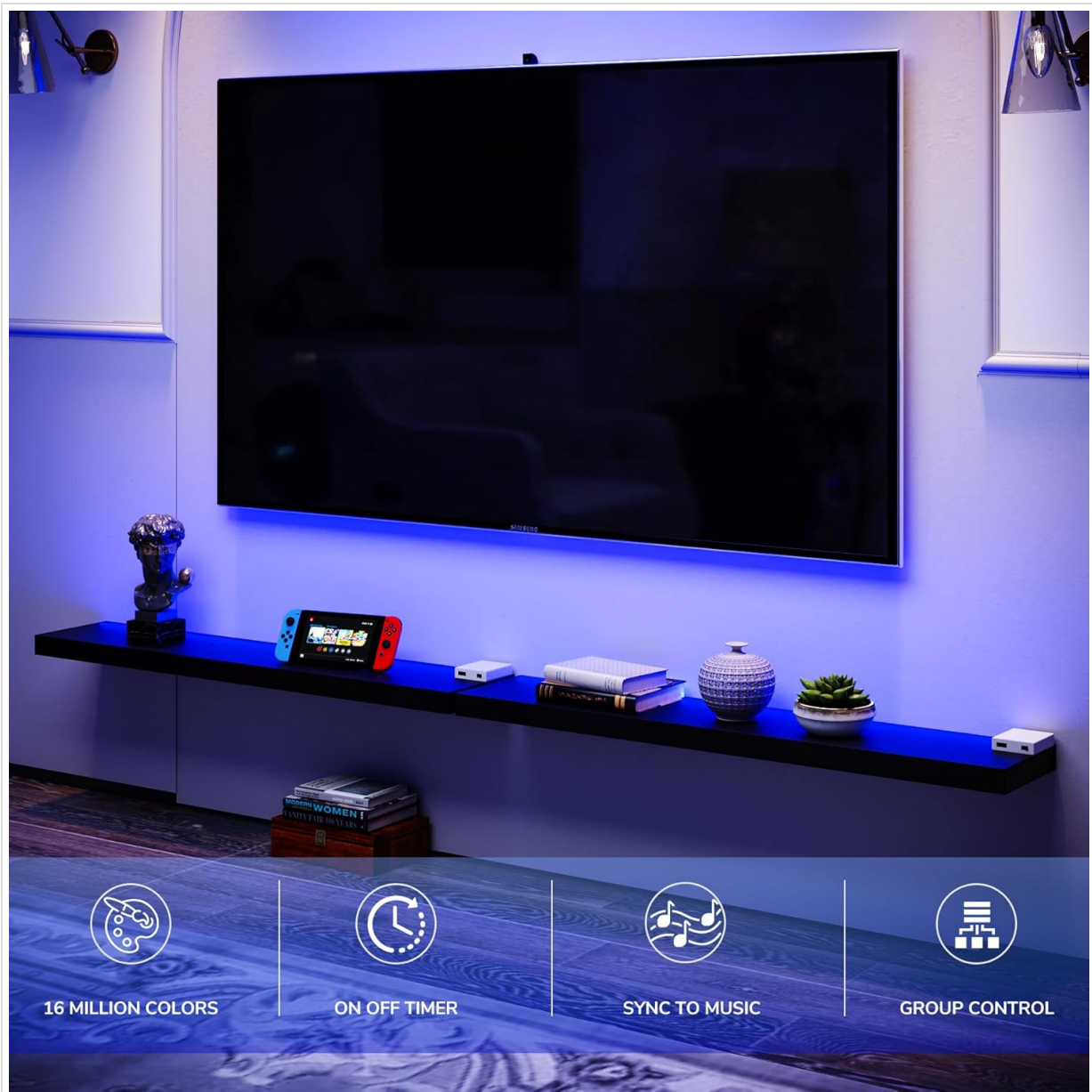
Figure 6.2: RGB LED Features Overview