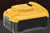
Figure 2: Snow shovel shown with compatible DeWalt 20V MAX battery (battery not included).