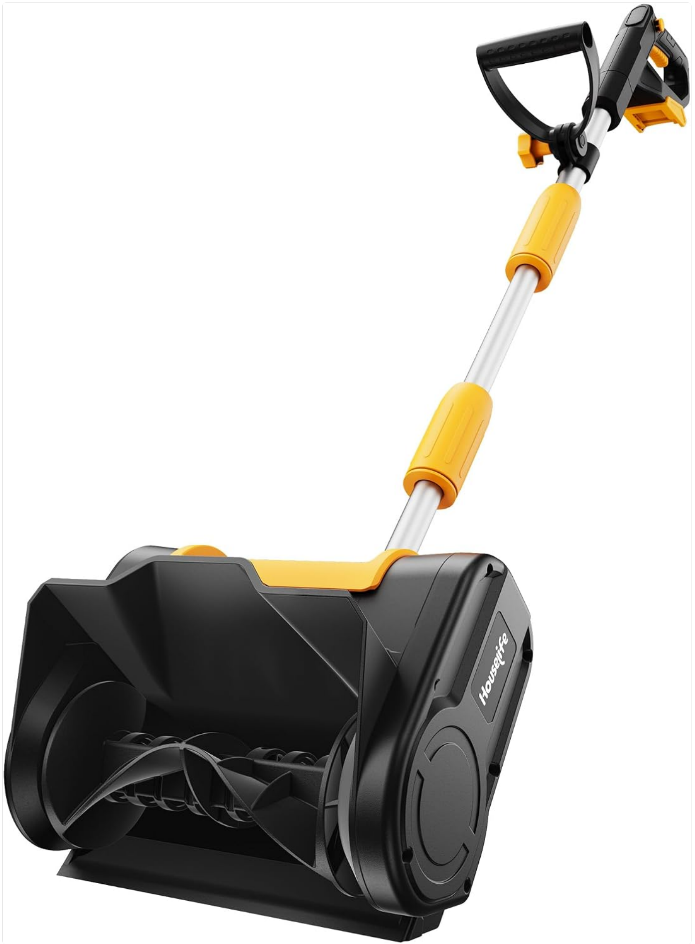
Figure 1: Houselife HL-XC-01 Cordless Snow Shovel.