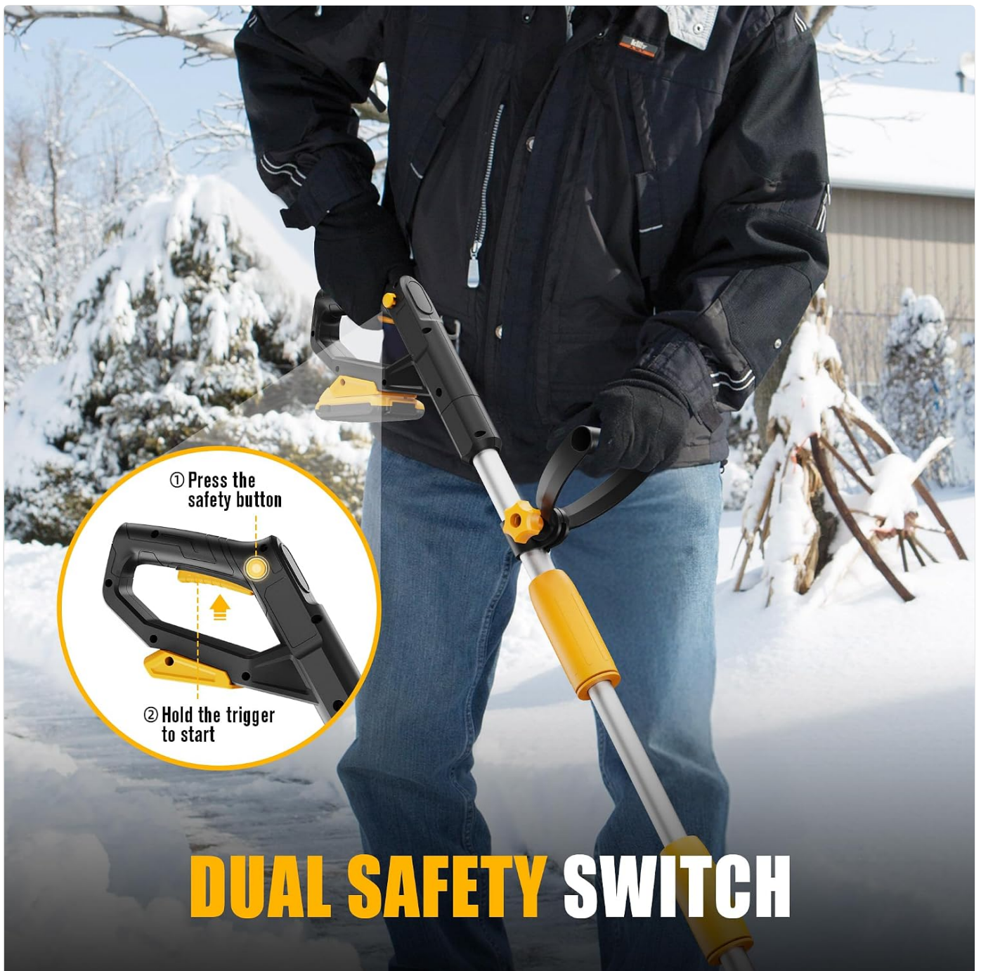
Figure 5: Illustration of the dual safety switch operation.