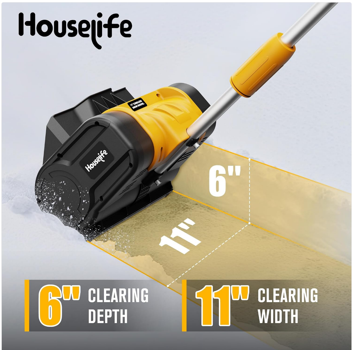
Figure 7: Clearing capabilities: 6-inch depth and 11-inch width.