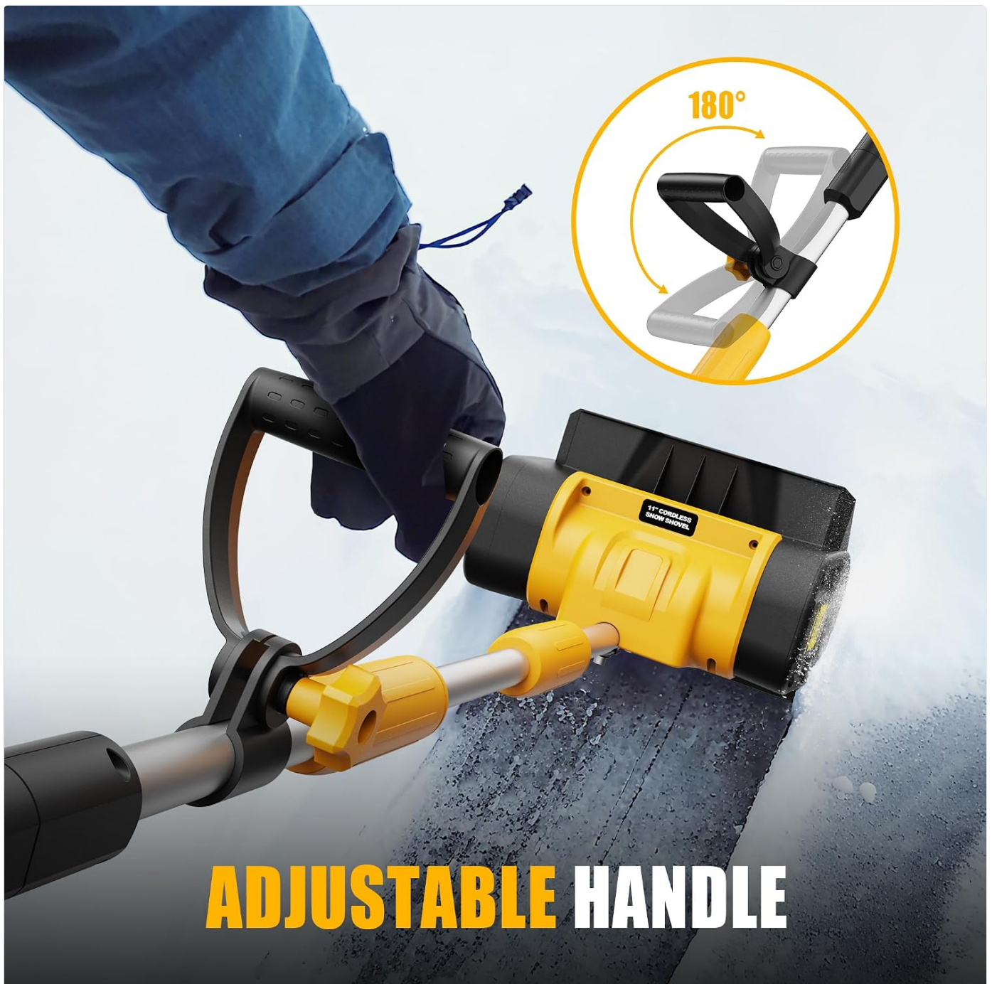
Figure 4: Close-up of the adjustable handle for ergonomic use.