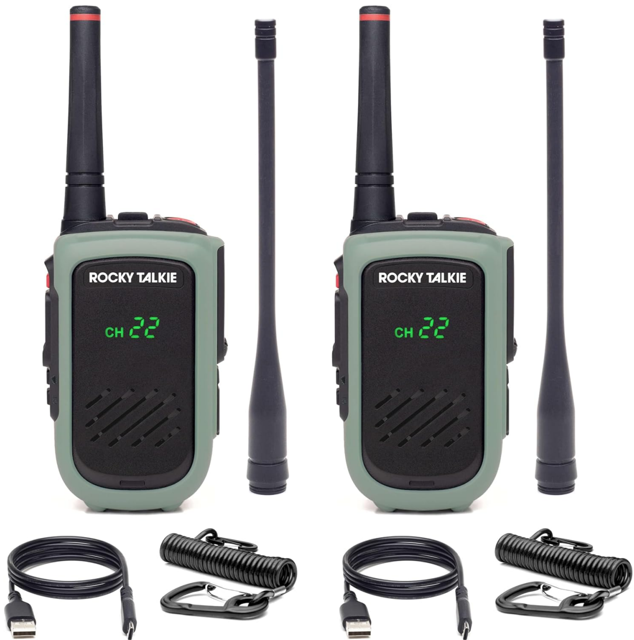
Image: Two Rocky Talkie Expedition radios, two short antennas, two long antennas, two USB-C charging cables, two steel gator clips, and two metal-reinforced backup leashes laid out on a white background.