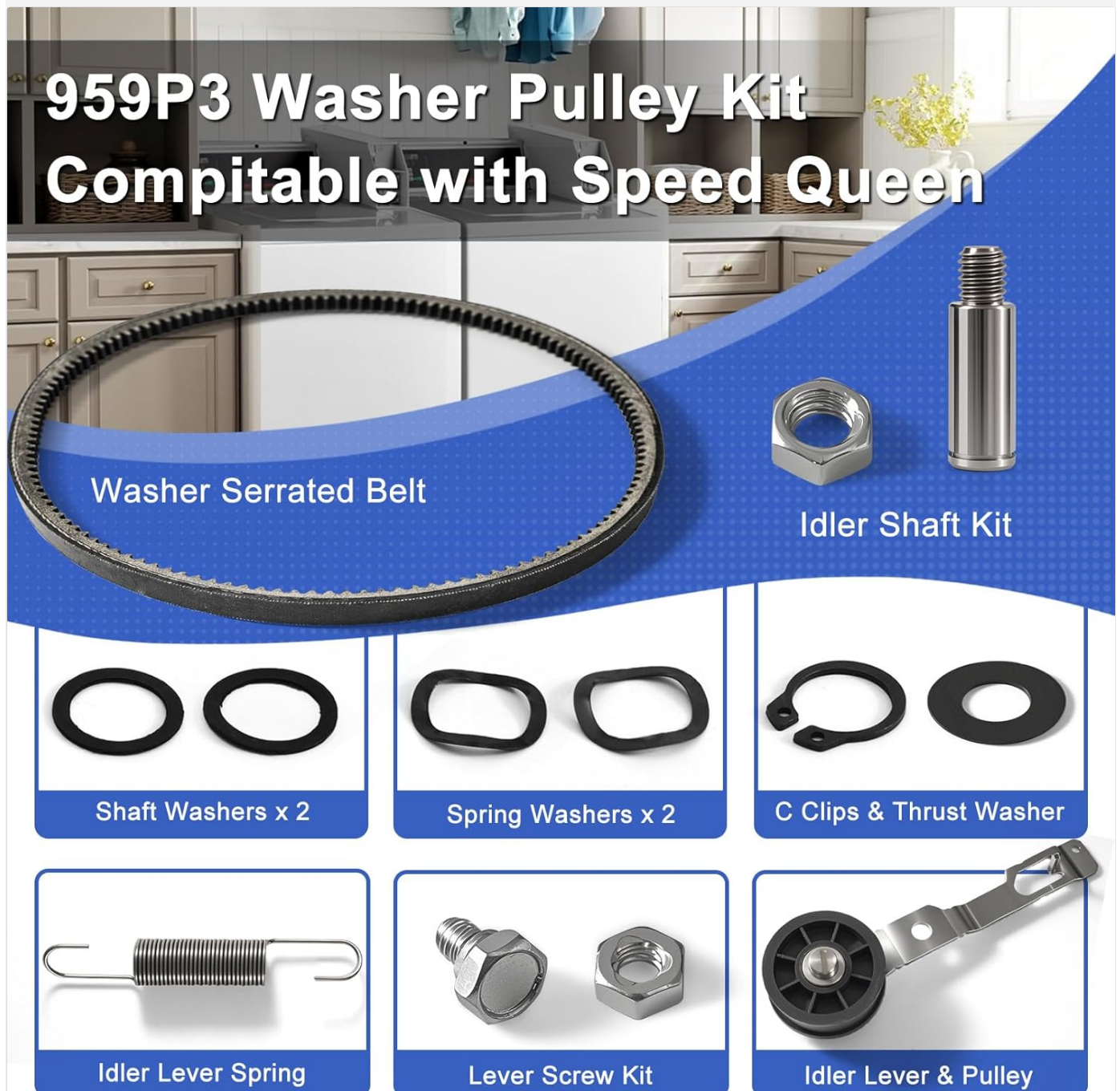
Image 2.1: Detailed view of the 959P3 Washer Pulley Kit components.