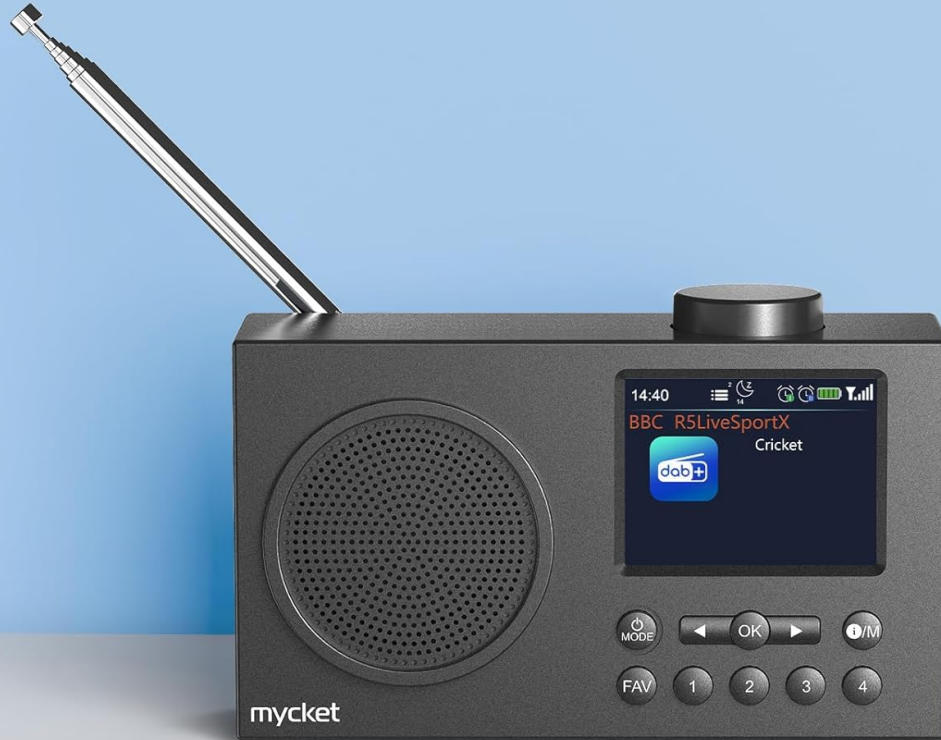
Image: The Mycket Portable DAB/DAB+ FM Digital Radio screen showing a radio station and indicating the auto scan and 40 preset features (20 DAB & 20 FM).

Auto scan radio stations and easy to save more than 40 presets with FAV button (20DAB & 20FM)