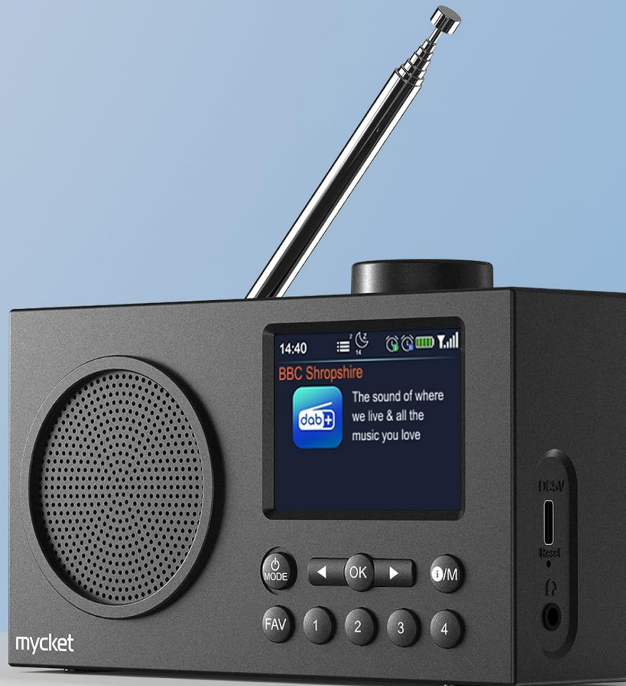
Image: The Mycket Portable DAB/DAB+ FM Digital Radio displaying battery icon, indicating sufficient charge for extended use.

Built-in 2200mAh rechargeable battery, enjoy your favorite radio anywhere