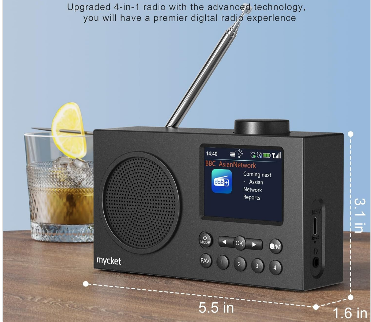
Image: Front and side view of the Mycket Portable DAB/DAB+ FM Digital Radio, showing its compact size (approximately 5.5 inches wide, 3.1 inches high, 1.6 inches deep), extendable antenna, speaker, 2.4-inch color display, control buttons (Mode, OK, O/M, FAV, 1-4), and USB-C port.

Upgraded 4-in-1 radio with the advanced technology, you will have a premier digital radio experience