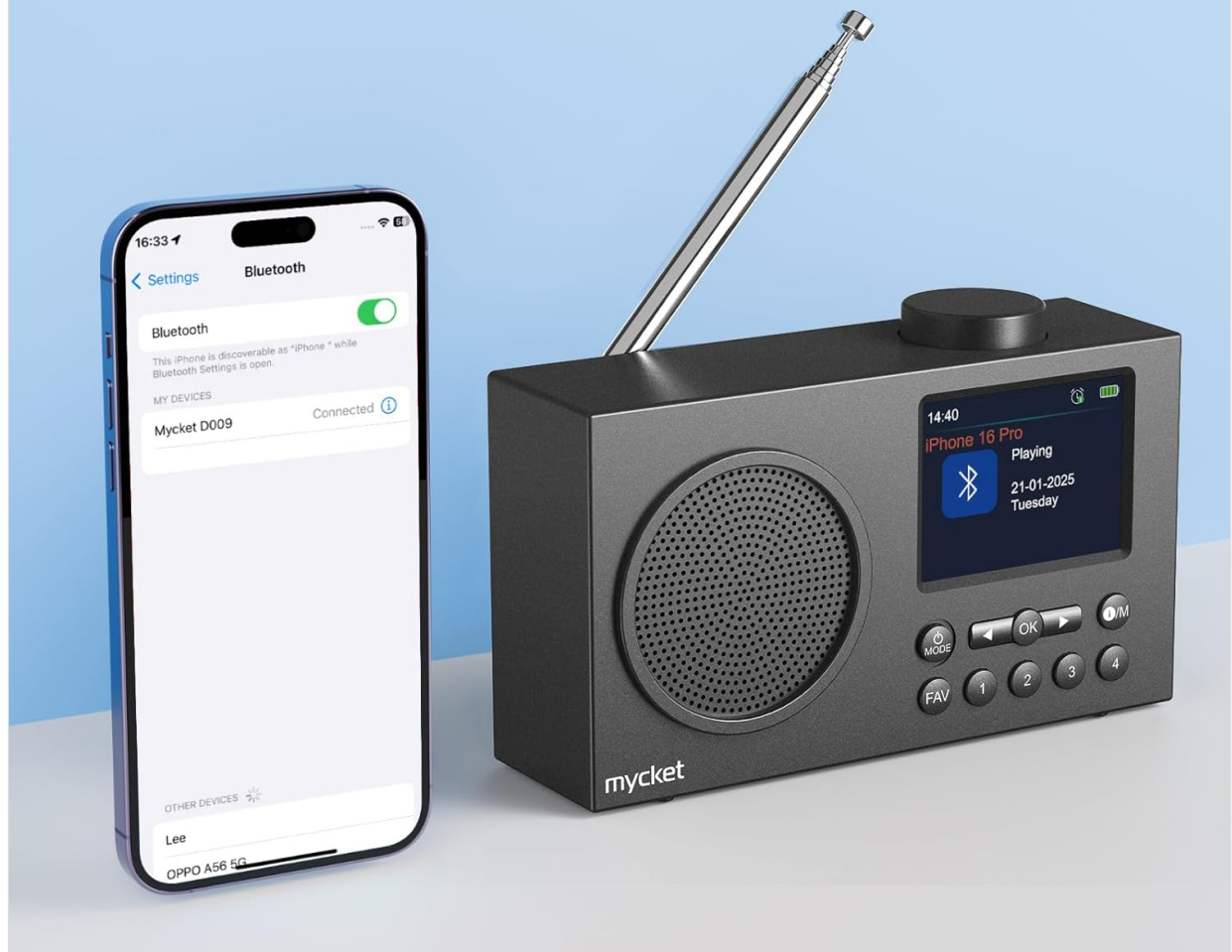
Image: The Mycket Portable DAB/DAB+ FM Digital Radio displaying "Bluetooth Connected" while a smartphone shows "Mycket D009" as a connected device, illustrating Bluetooth 5.0 connectivity.

Enjoy your favorite music by connecting Bluetooth "Mycket D009"