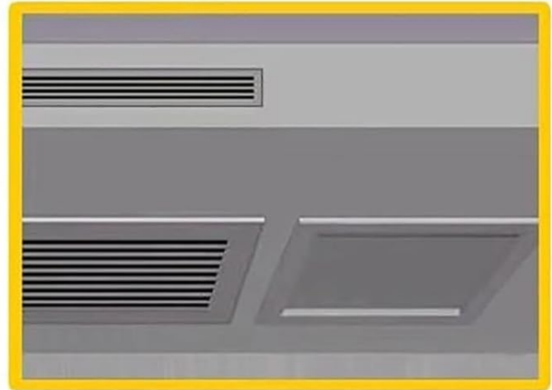
Figure 2.5: Examples of the access panel installed in different settings, showcasing its elegant and compact appearance when integrated into ceilings and walls.