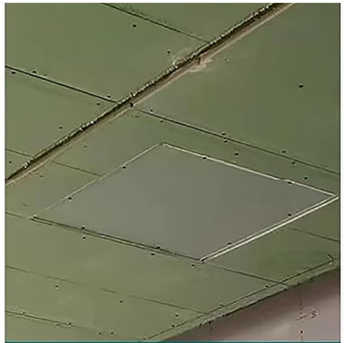
After Pre-embedded Installation