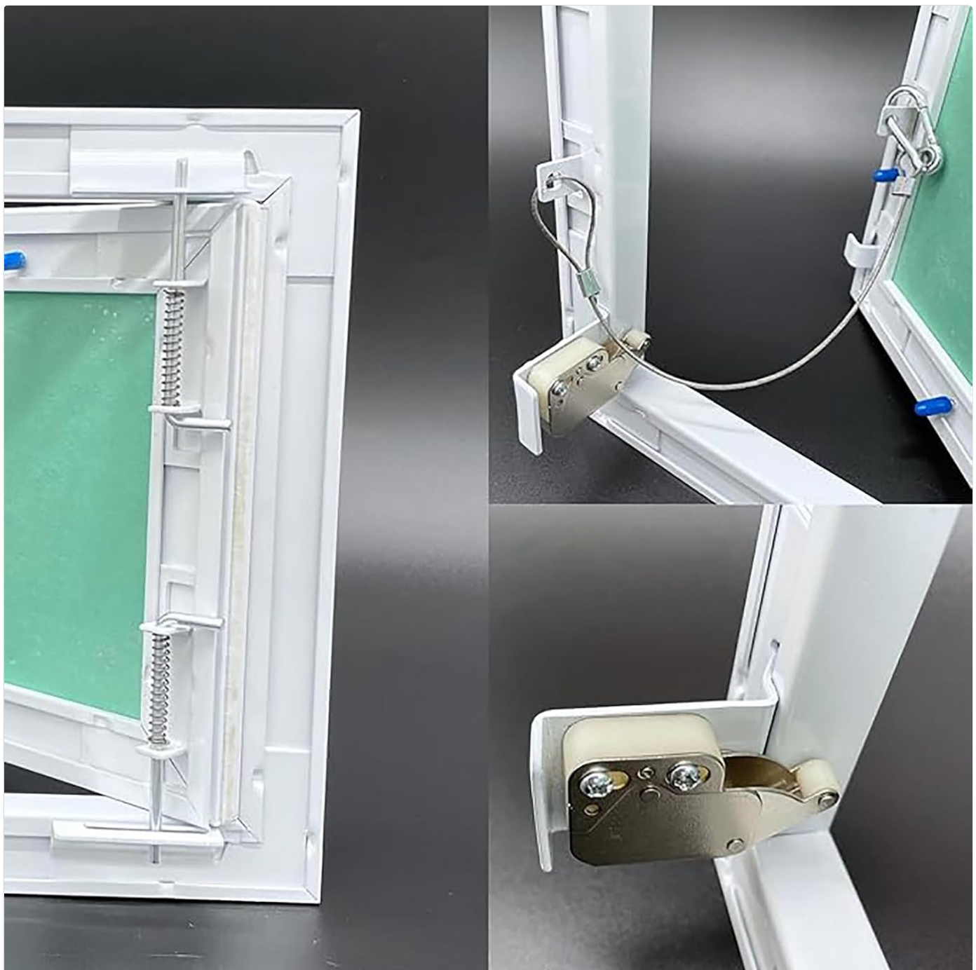
Figure 3.1: Detailed view of the push-release latch mechanism and the integrated safety wire, ensuring secure closure and controlled opening.