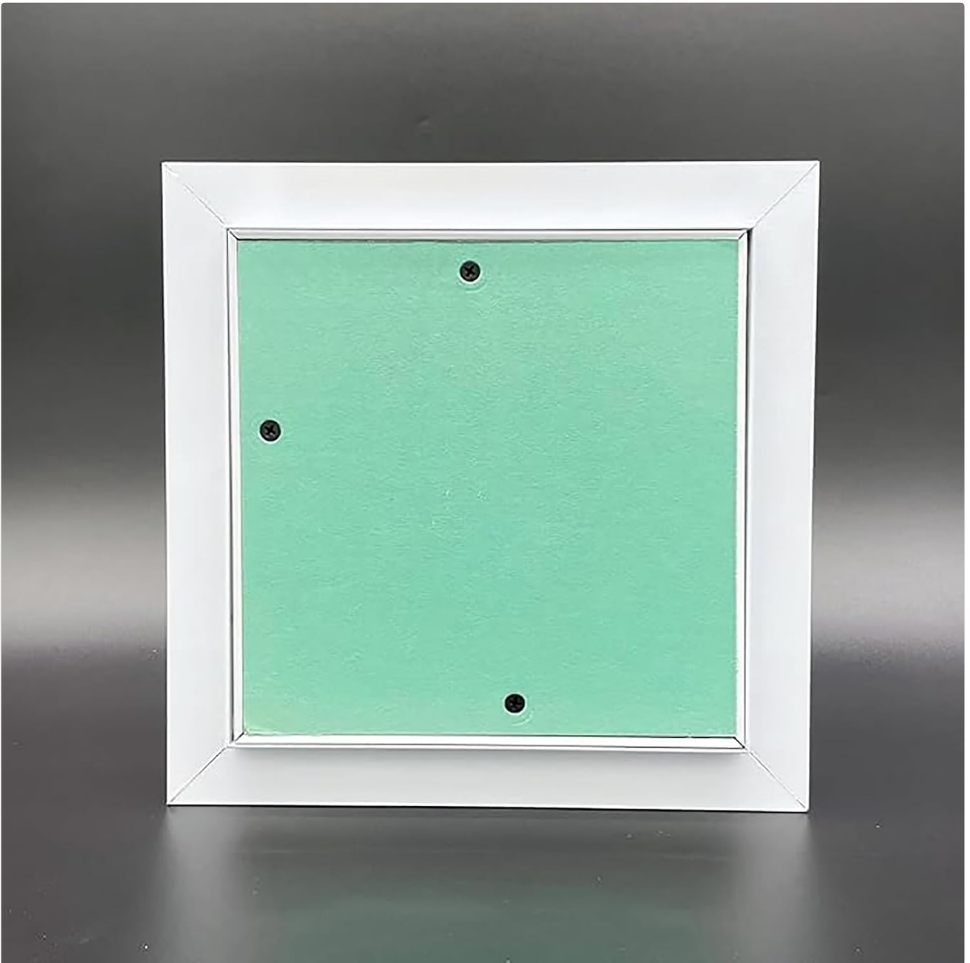
Figure 1.1: Front view of the 500x500mm Plasterboard Access Panel, showing its clean, white frame and green plasterboard face.