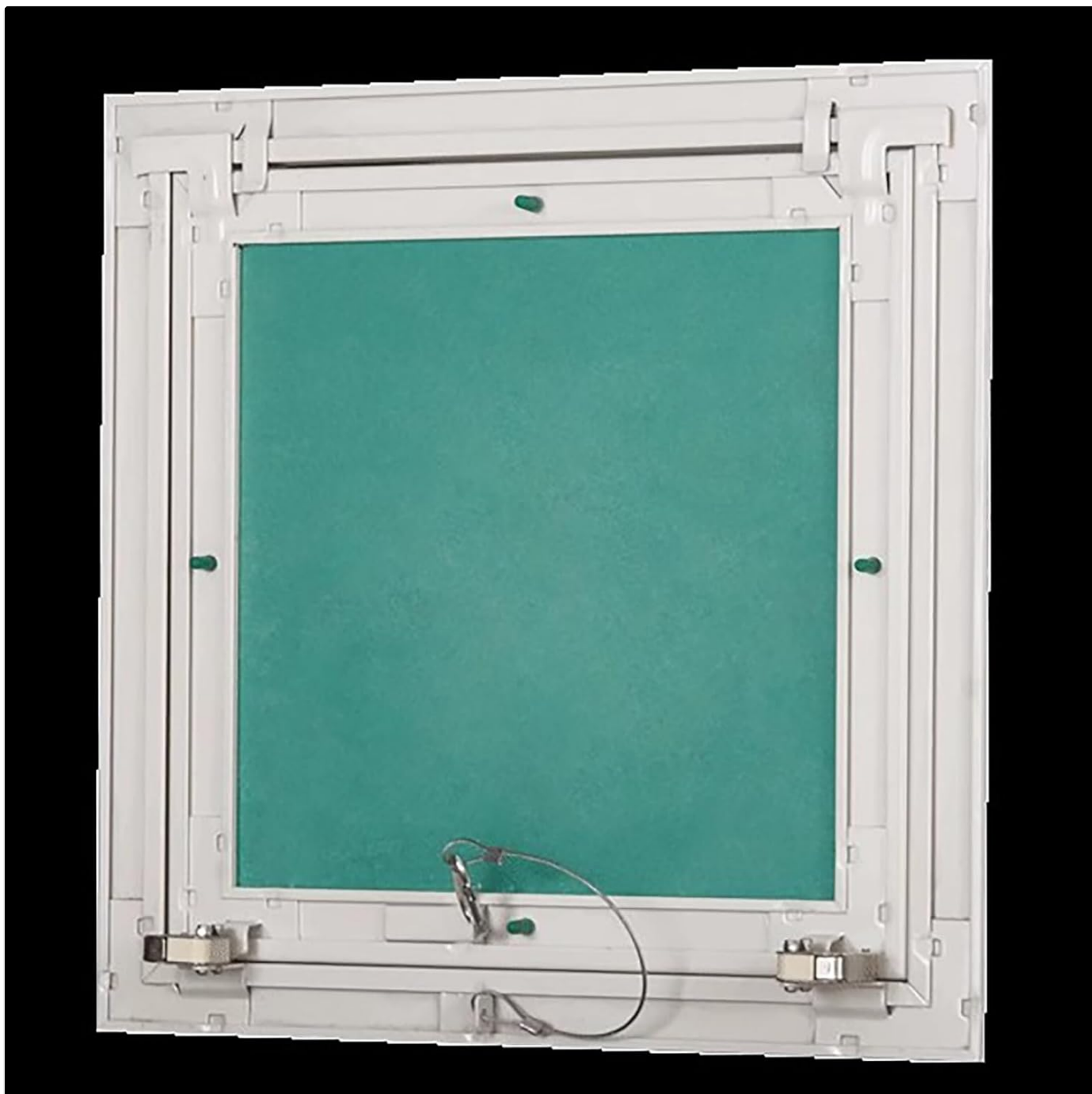
Figure 2.2: Rear view of the access panel, detailing the fixed screws and the robust aluminium frame designed for secure installation.