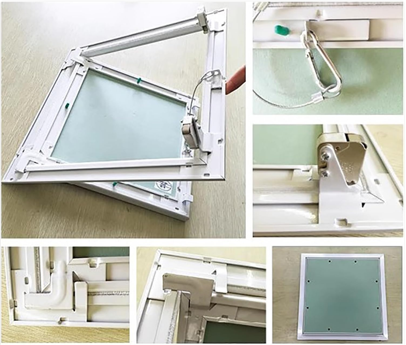
Figure 2.3: A composite image illustrating the installation process, highlighting the frame's structure, the push-release latch, and how the panel integrates into a wall or ceiling.