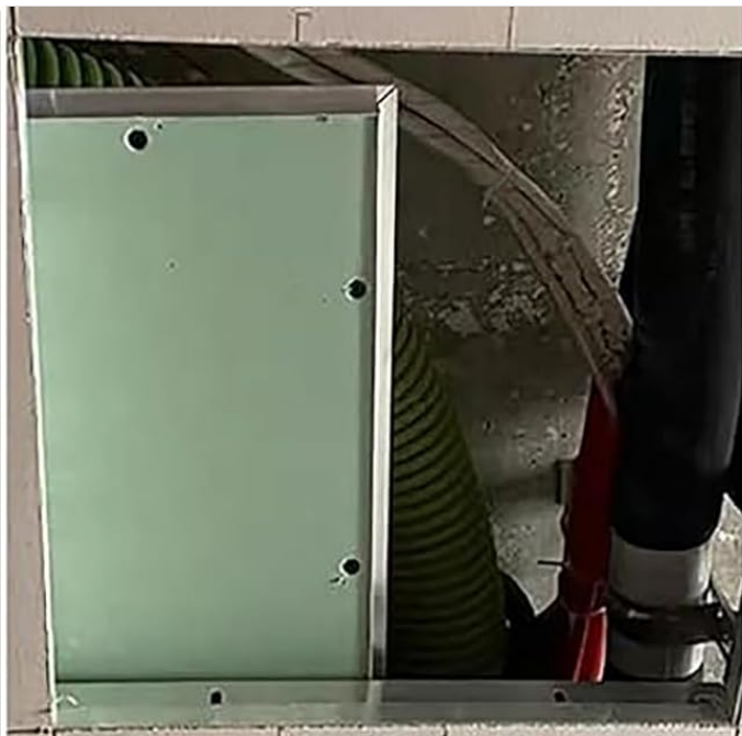
Before Pre-embedded Installation