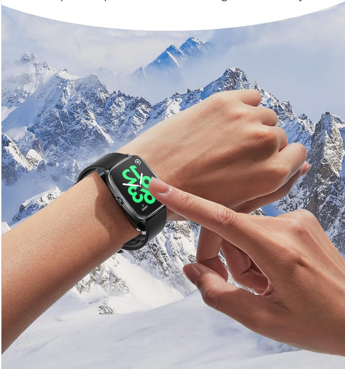
Image: High Touch Sensitivity. The protector ensures a clear view and responsive touch.

The protector provides a clear view and high touch sensitivity