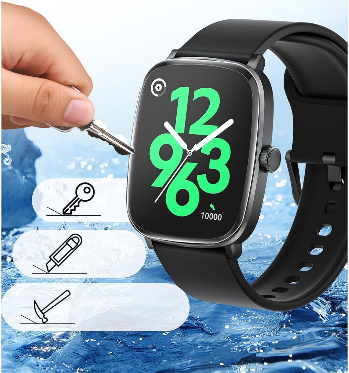
Image: Scratch-Proof Protection. The film protects against scratches from metal objects.

Protect the screen to prevent metal scratches such as keys