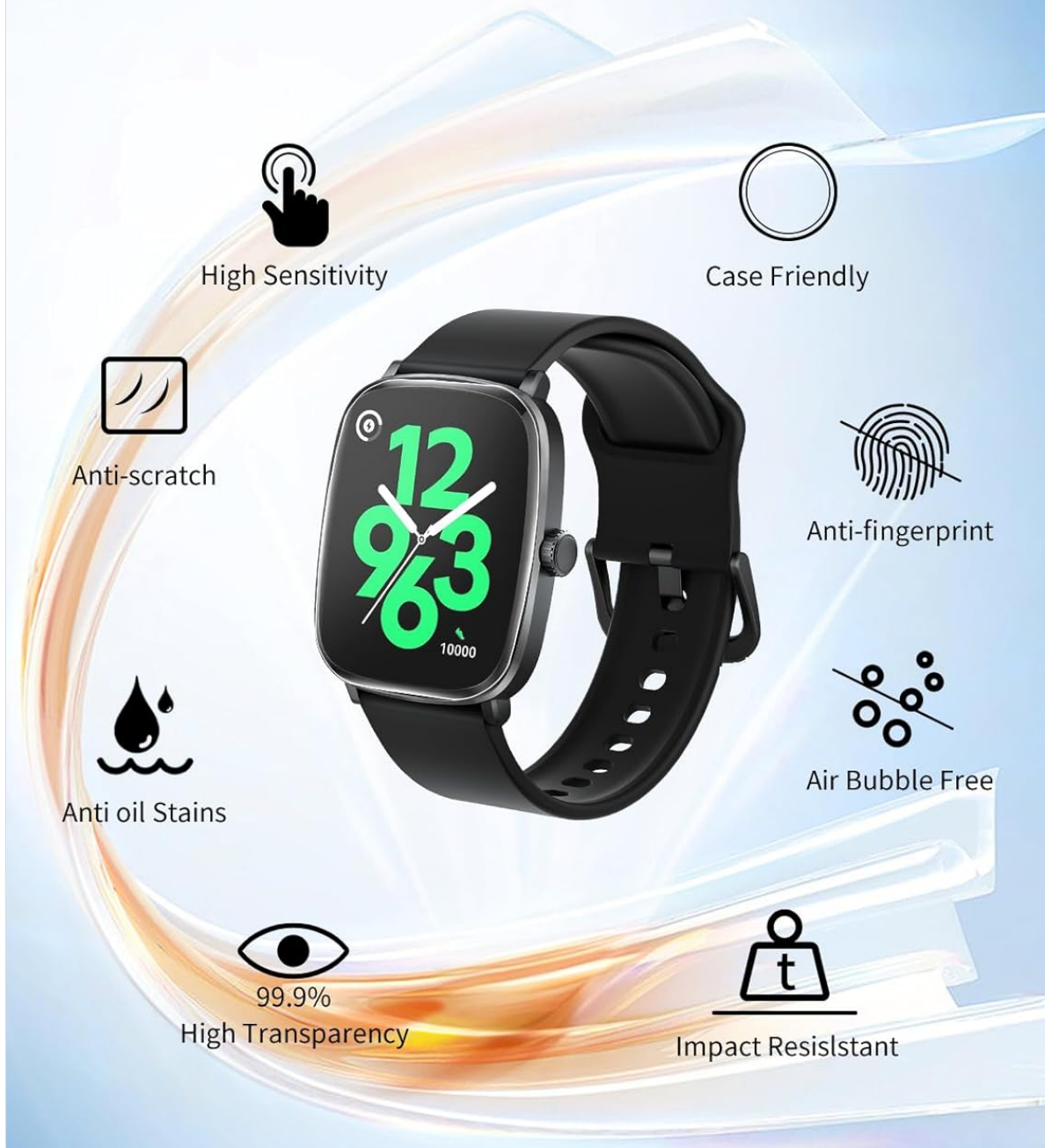
Image: High-Quality Features. Overview of the protector's benefits including sensitivity, scratch resistance, and clarity.