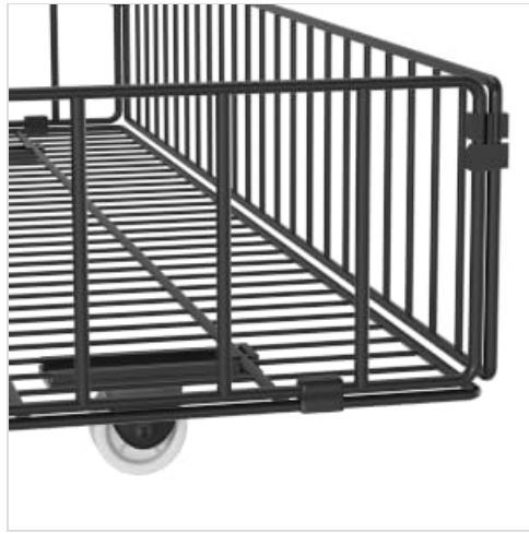
Image: Detail of the sturdy metal and wood slat support system.