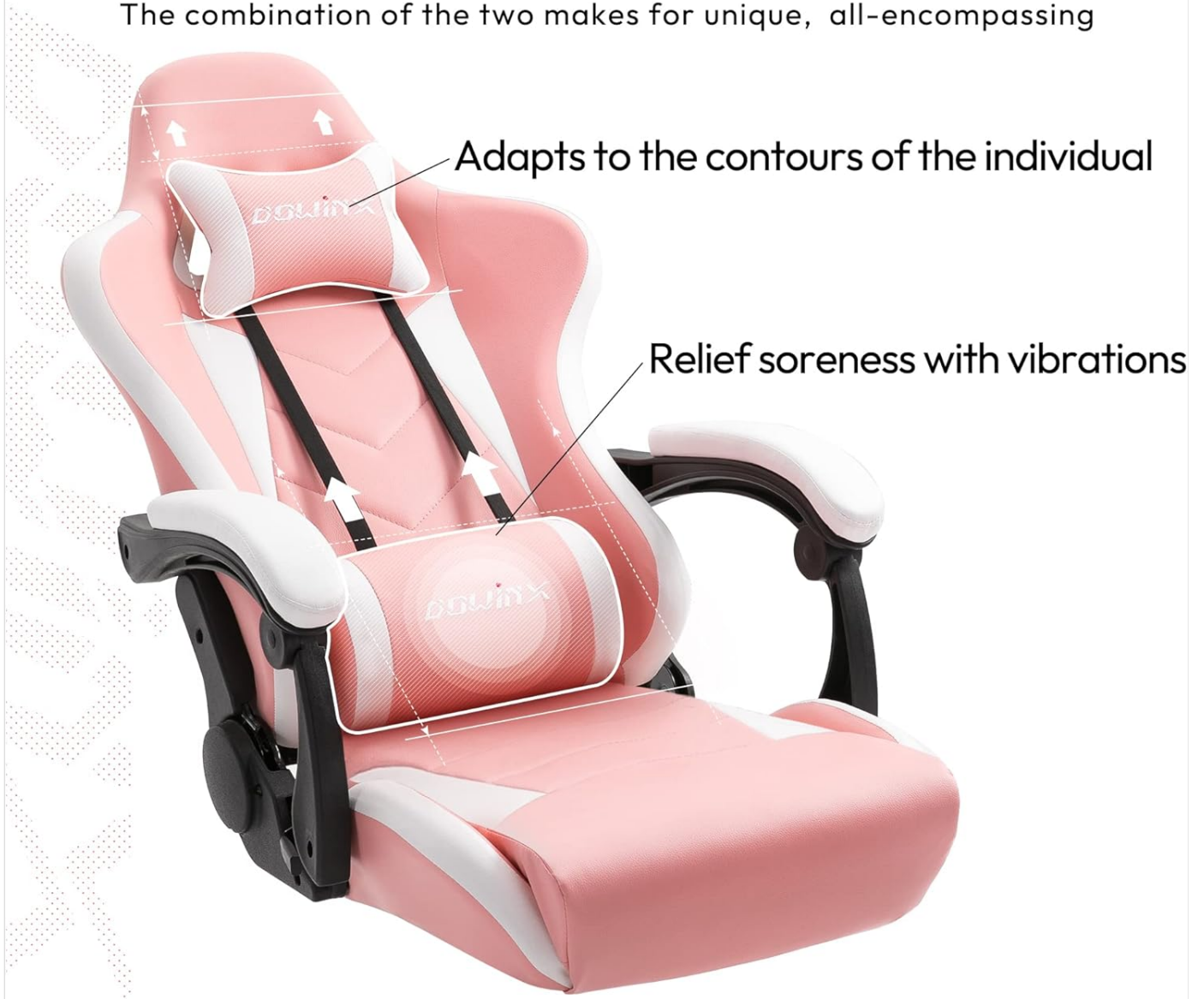
Figure 5: Lumbar support pillow with massage function.

The combination of the two makes for unique, all-encompassing