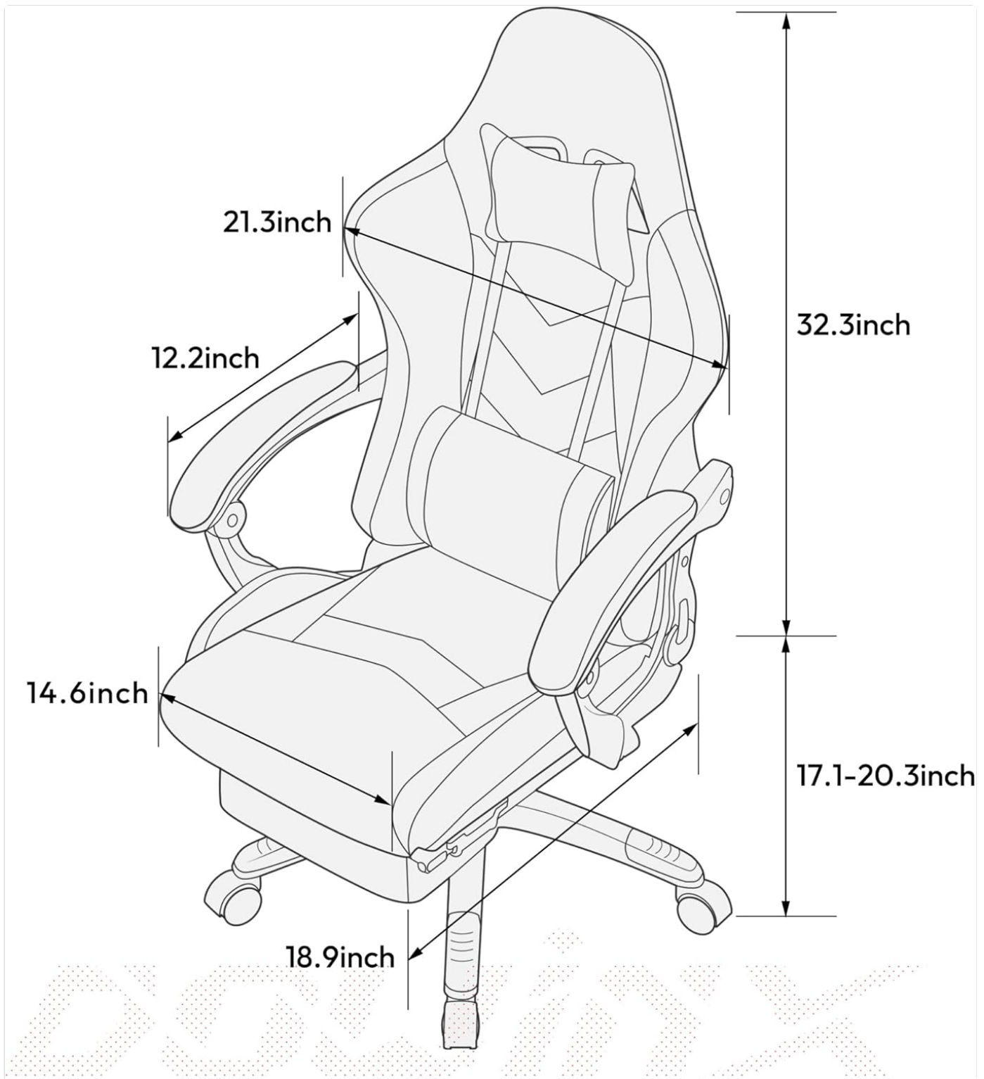
Figure 1: Chair dimensions and overall structure.

Image Description: A line drawing of the Dowinx Gaming Chair with various dimensions labeled in inches, including backrest height, seat width, seat depth, and adjustable seat height range.