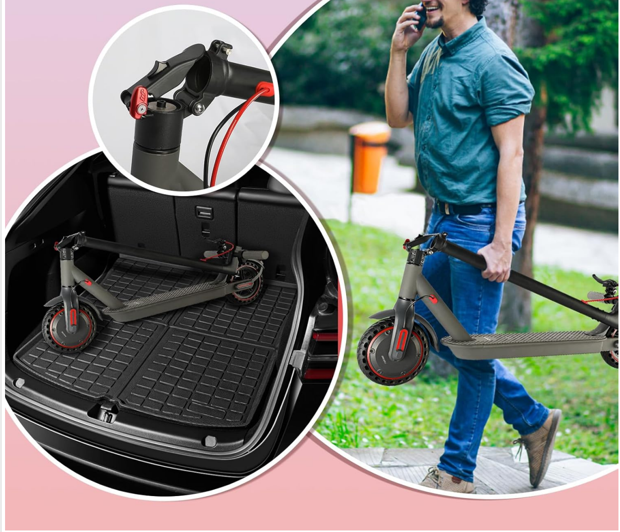
Image: The scooter shown in its folded state, being placed into a car trunk and carried by hand.