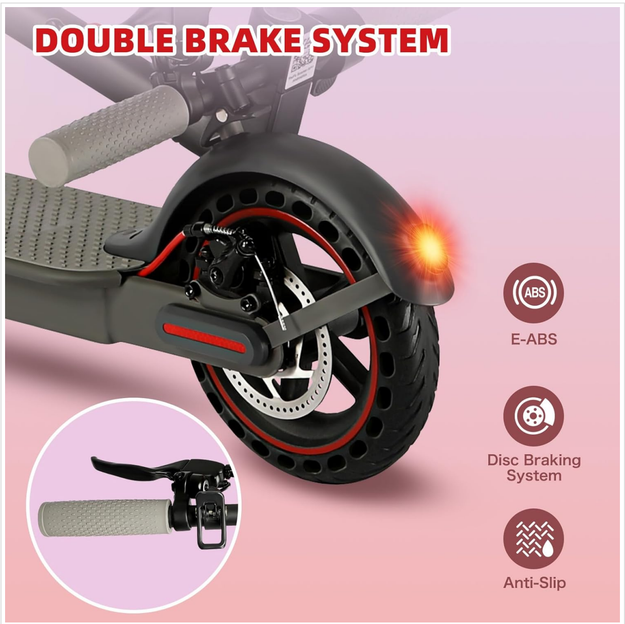
Image: Close-up of the scooter's rear wheel, showcasing the disc brake system and taillight.