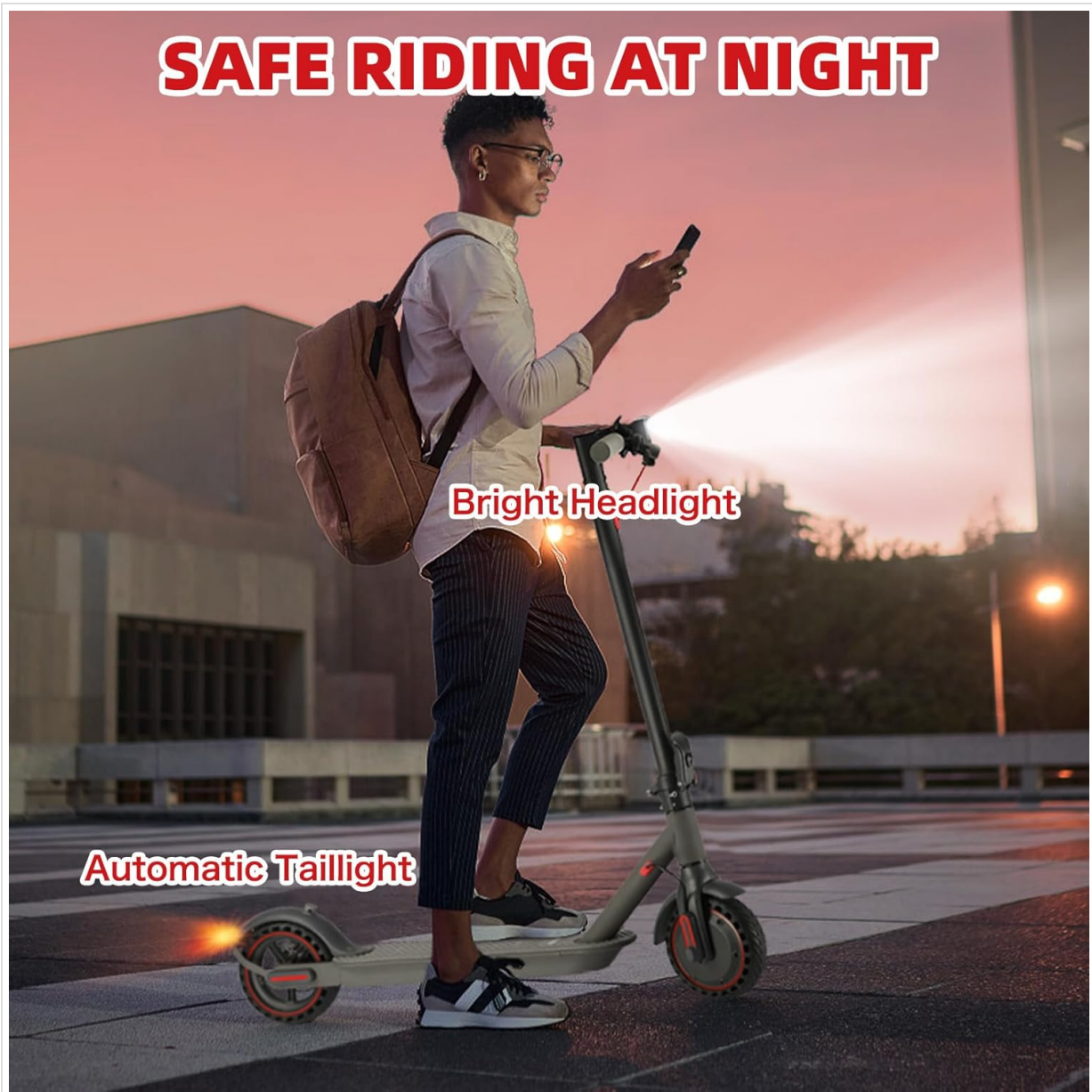
Image: A person riding the scooter at dusk, demonstrating the illuminated headlight and taillight.