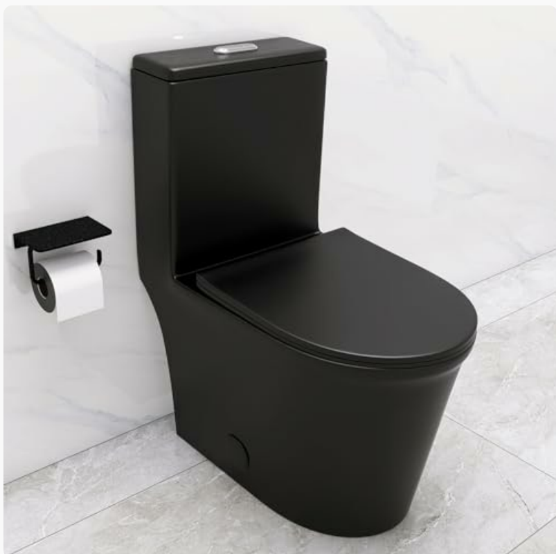
Figure 10: Functions of the one-touch side knob.