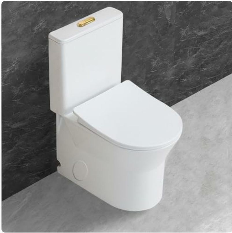
Figure 9: The smart toilet's integrated LED night light.