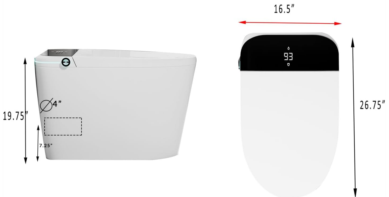
Figure 11: Detailed product dimensions.