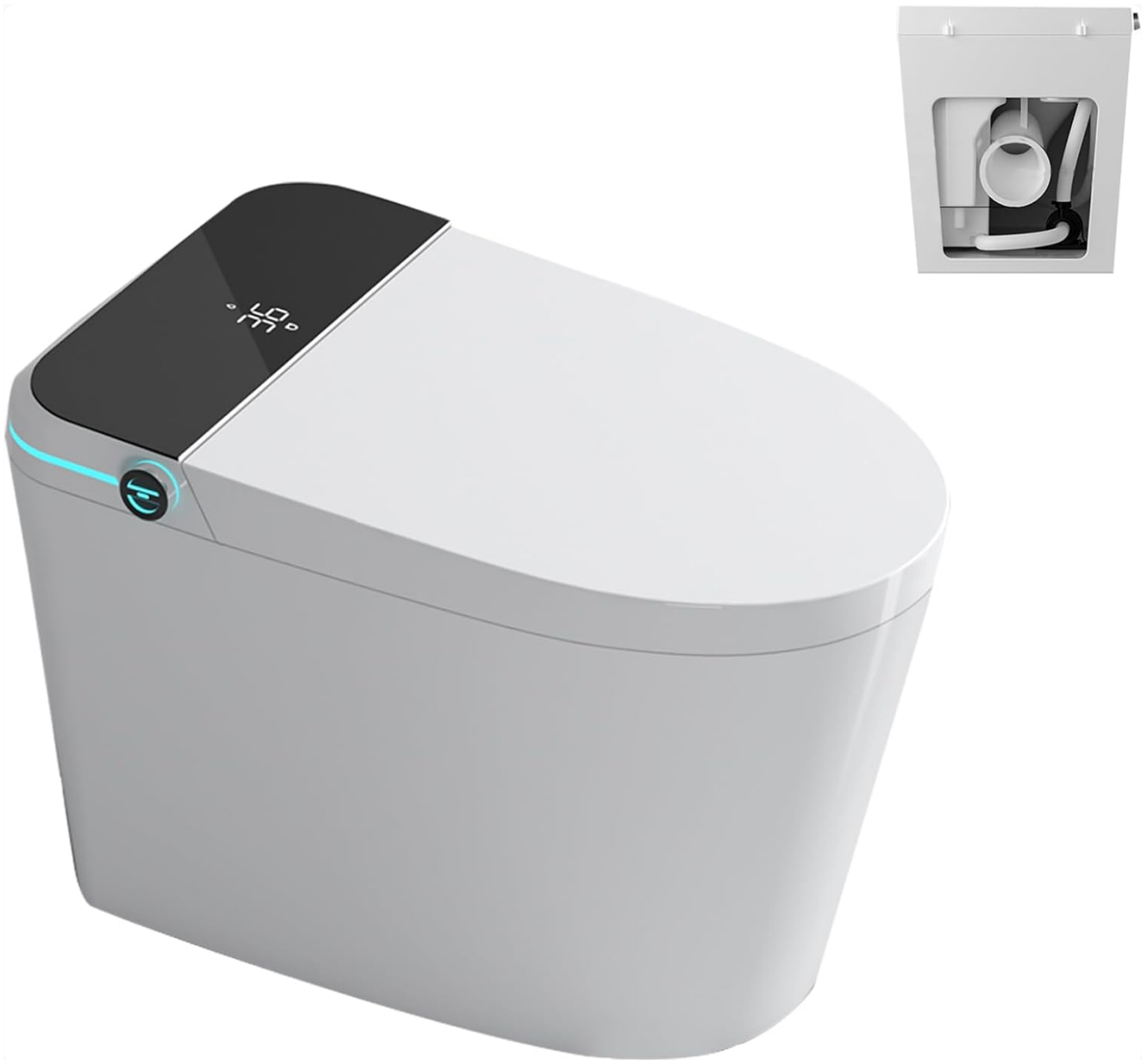
Figure 1: Main view of the WinZo Rear Outlet Smart Toilet.