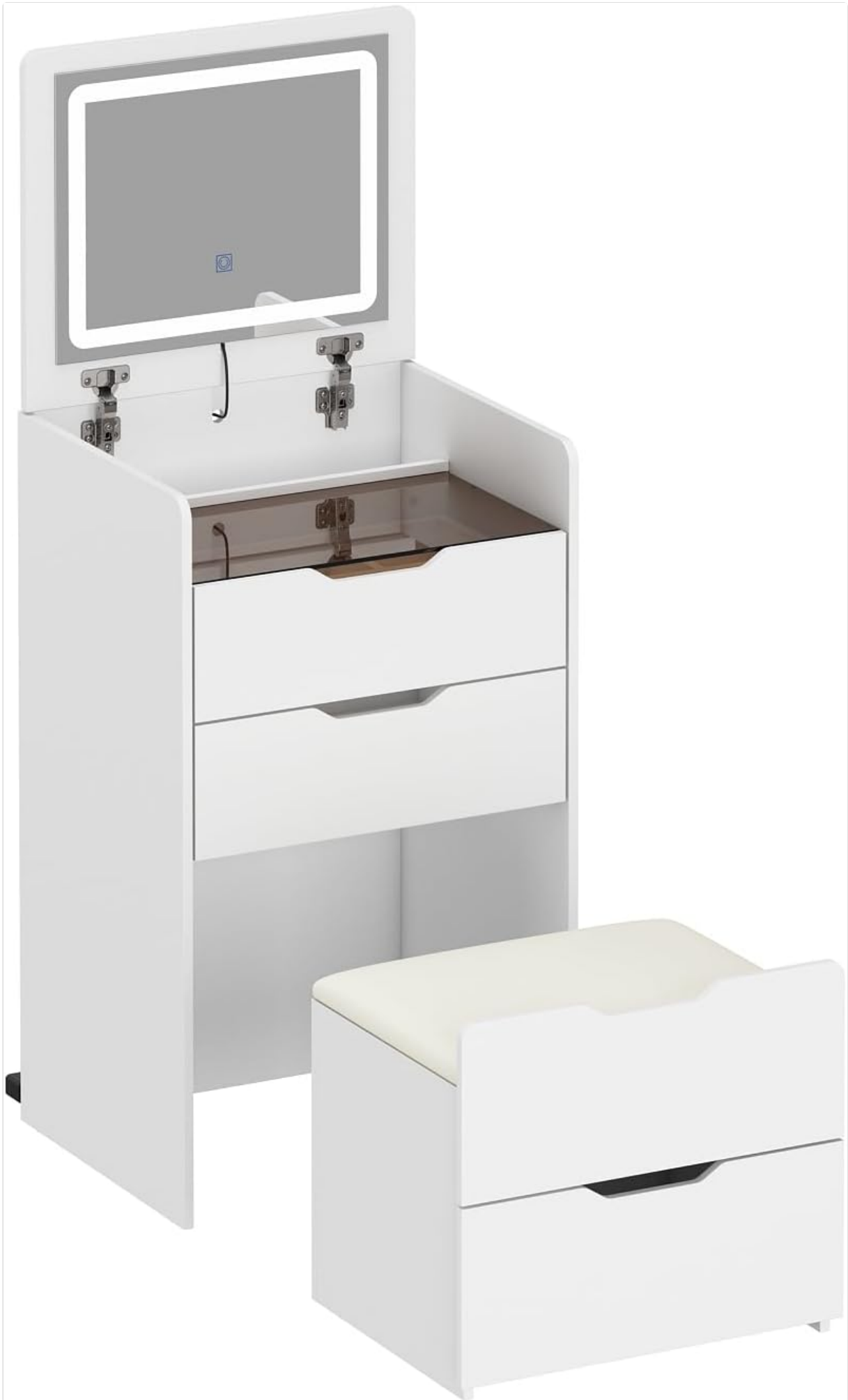
Image 4.1: The vanity desk with its mirror in the upright position, revealing the storage compartments, and the matching