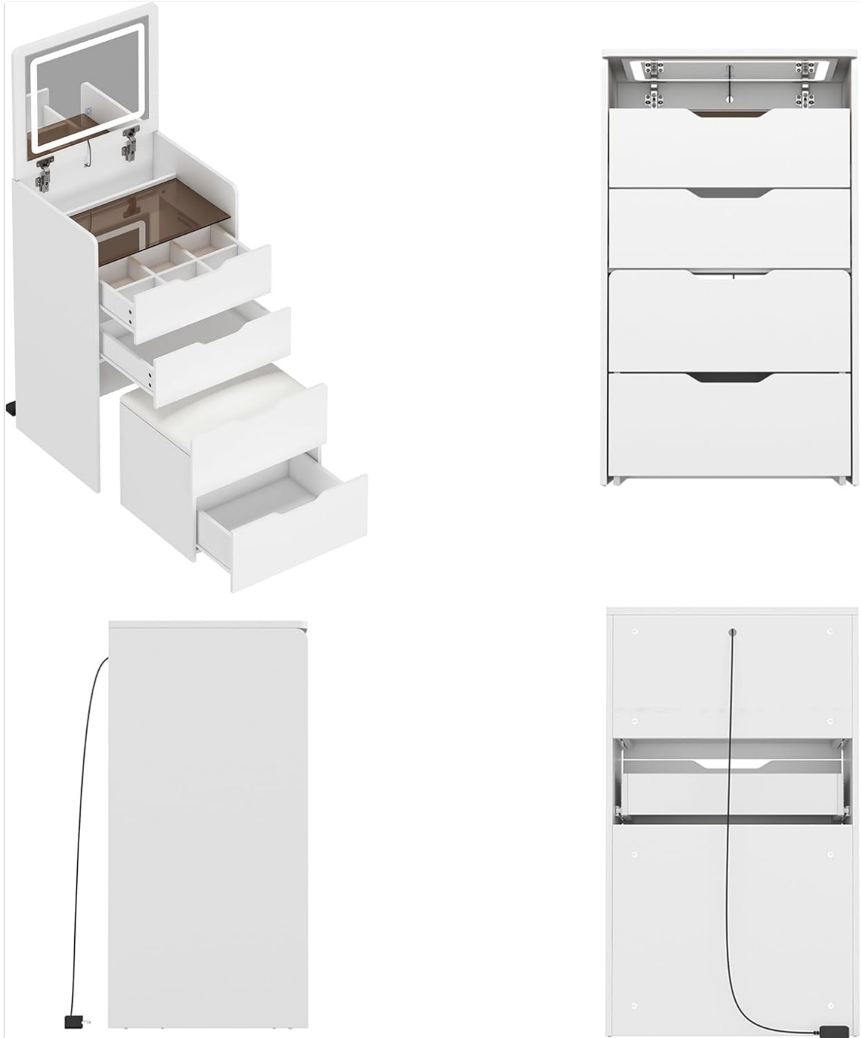
Image 3.1: An exploded diagram illustrating the individual components of the vanity desk, including the frame, drawers, mirror, and stool.