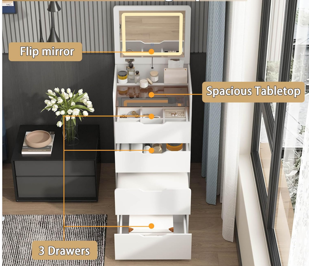
Image 5.2: An annotated image demonstrating the vanity's storage capabilities, including the flip mirror, spacious tabletop, and three pull-out drawers.