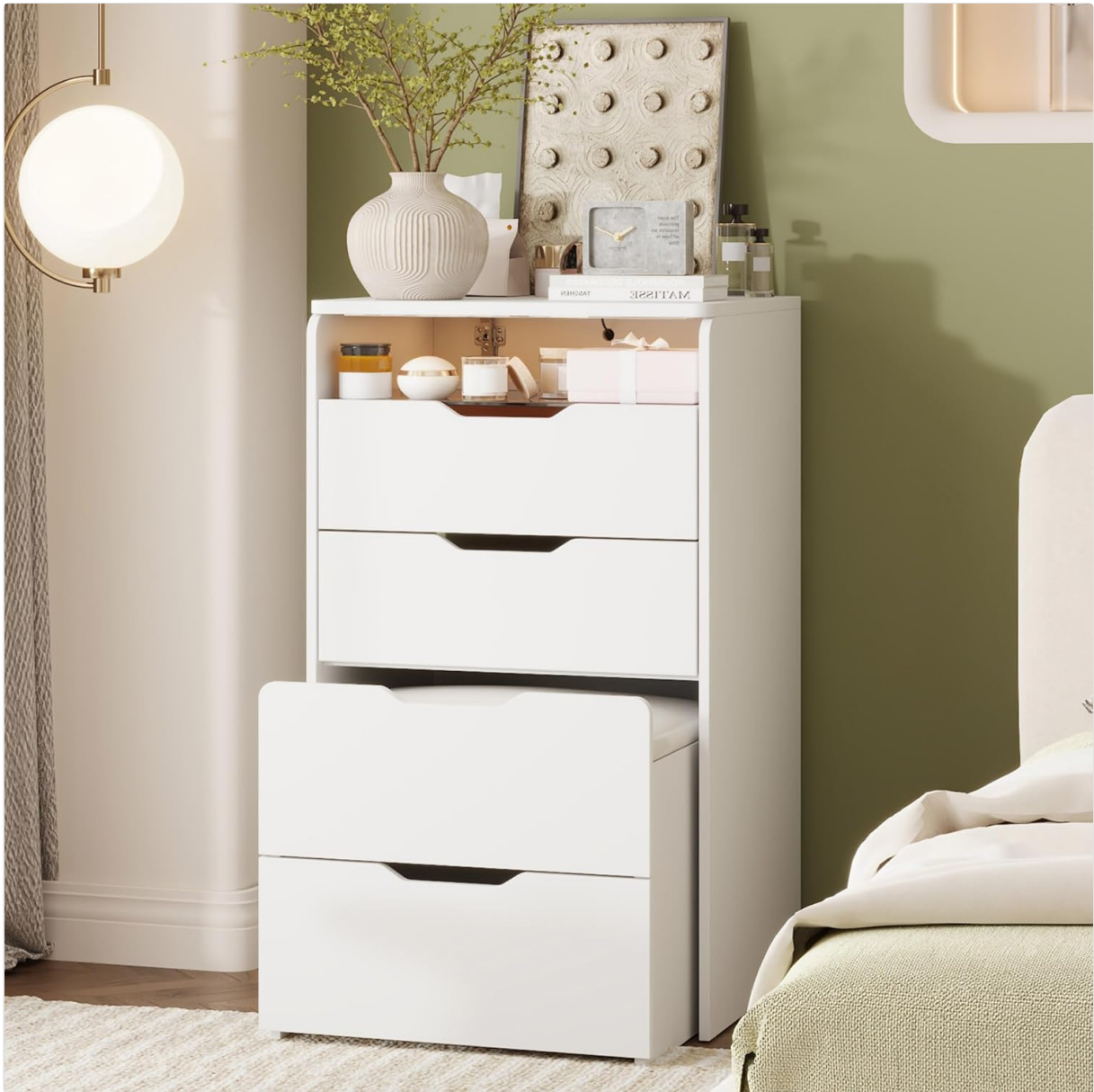
Image 5.3: The vanity desk with its mirror closed, showcasing its appearance as a compact, multi-functional cabinet.