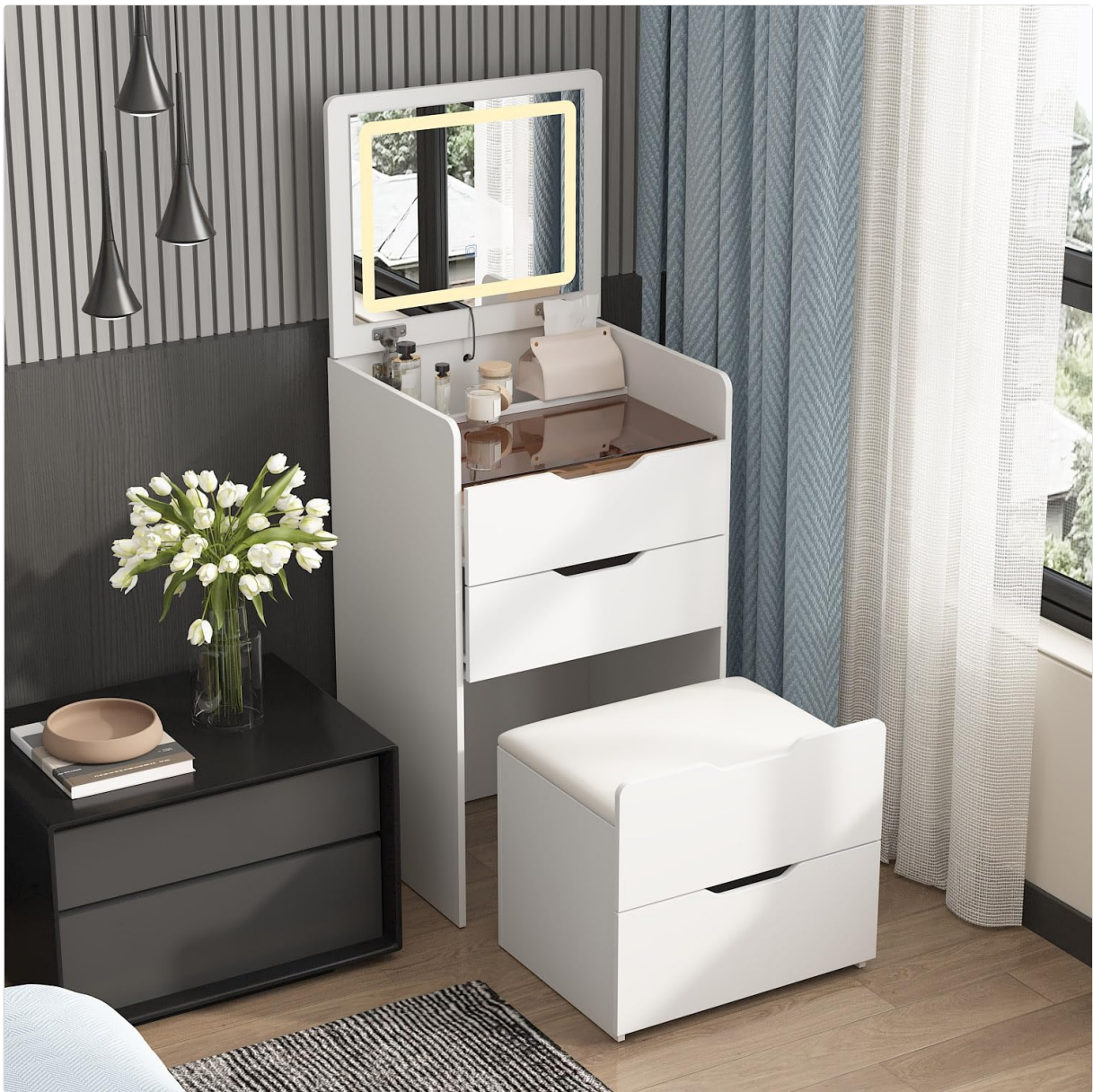
Image 1.1: The Timechee Vanity Desk with Mirror and Lights, featuring a white finish and a hidden stool, positioned next to a bed.