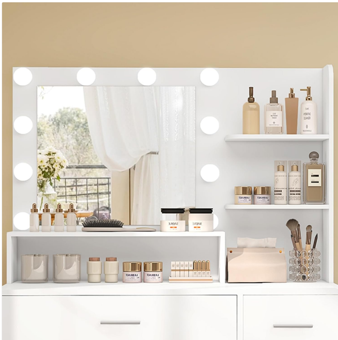
Figure 5.1: Lighting Modes and Brightness Adjustment

This image demonstrates the three available lighting modes (Cold White, Warm White, Warm Yellow) and explains how to adjust brightness and change color using the touch control.