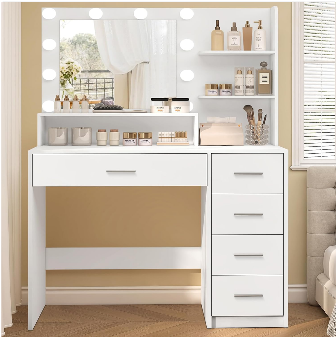
Figure 1.1: FIONESO Vanity Desk with Mirror and Lights

This image displays the complete FIONESO Vanity Desk, showcasing its white finish, lighted mirror, and integrated storage solutions including drawers and open shelves.