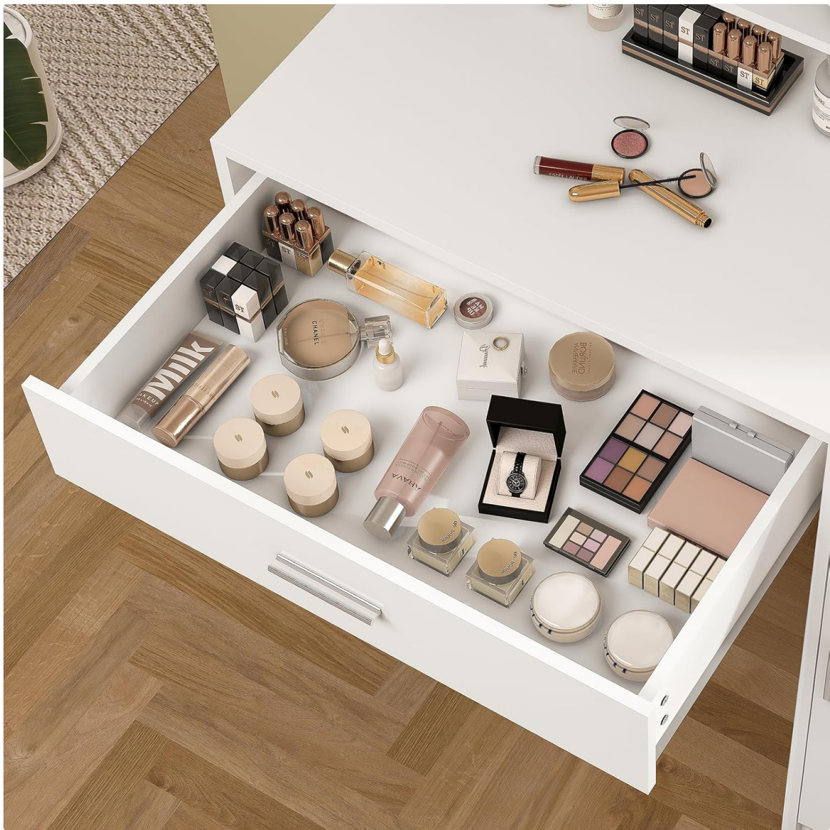
Figure 5.2: Spacious Drawer Storage

This image provides a close-up view of an open drawer, illustrating the ample space available for organizing various makeup and beauty products.