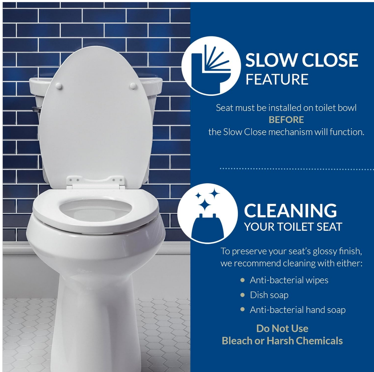
Image: Slow Close Feature and Cleaning. This image provides visual instructions for cleaning your toilet seat and highlights the slow-close feature.