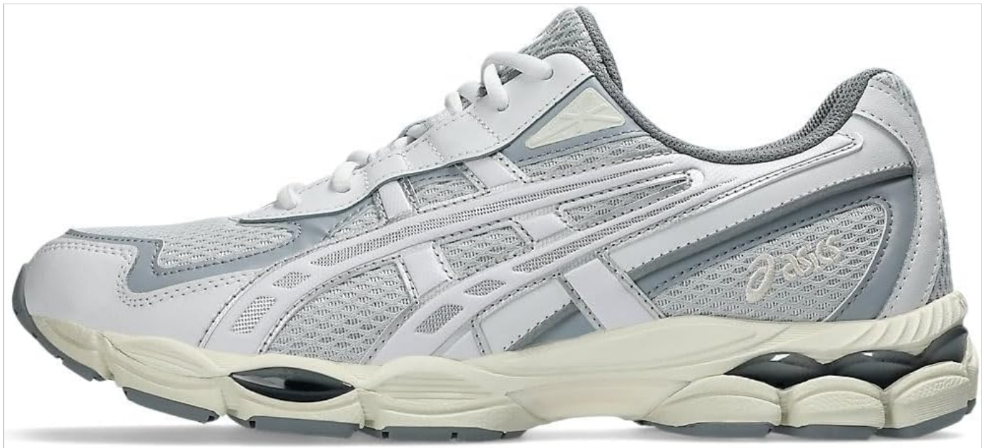
Image: Side view of the ASICS Men's Gymnastics Shoes, highlighting the lacing system and general profile.