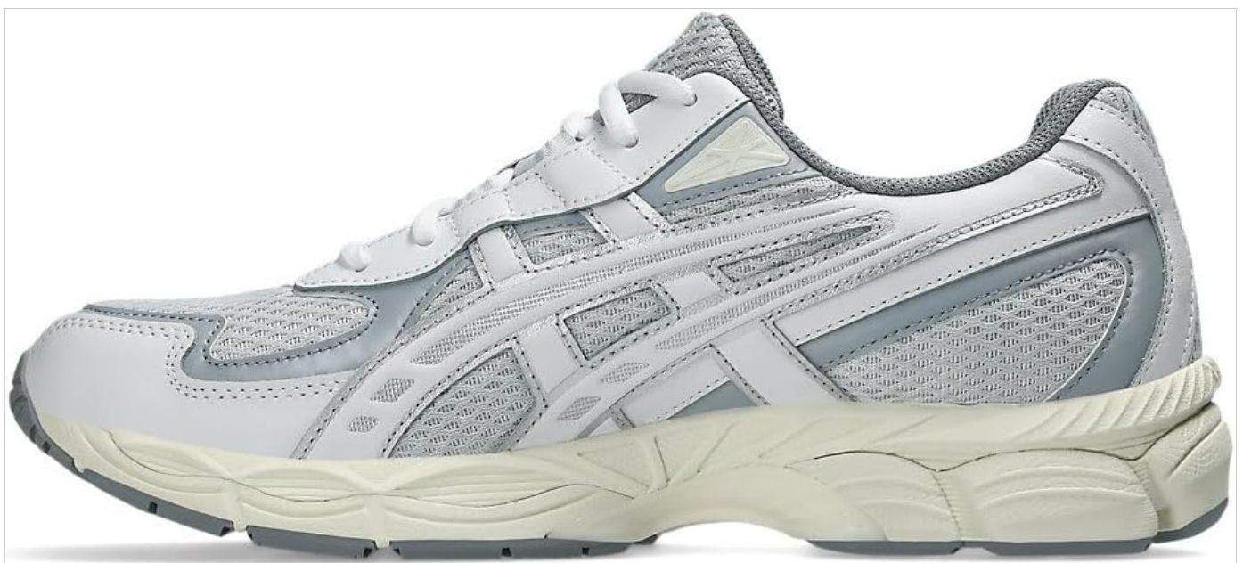
Image: Side profile of the ASICS Men's Gymnastics Shoes, illustrating the sole design and upper construction.