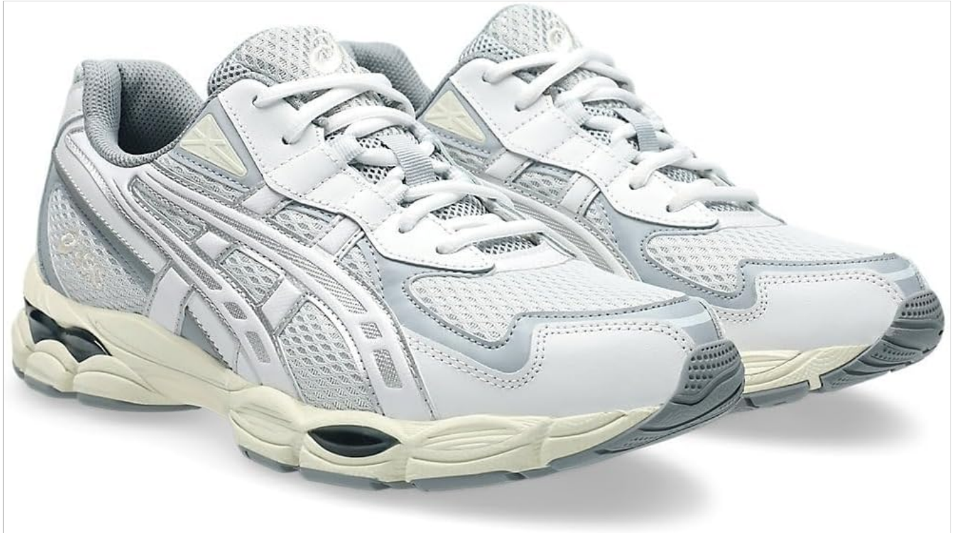
Image: Front-side view of a pair of ASICS Men's Gymnastics Shoes, showcasing the design and Glacier Grey White color scheme.