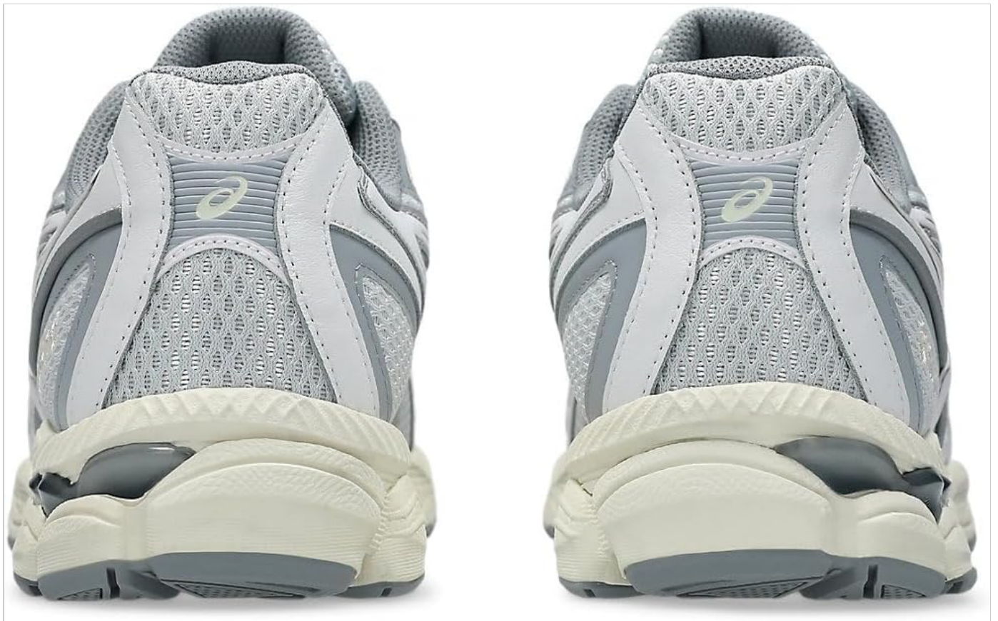
Image: Rear-side view of a pair of ASICS Men's Gymnastics Shoes, focusing on the heel structure and ASICS logo.