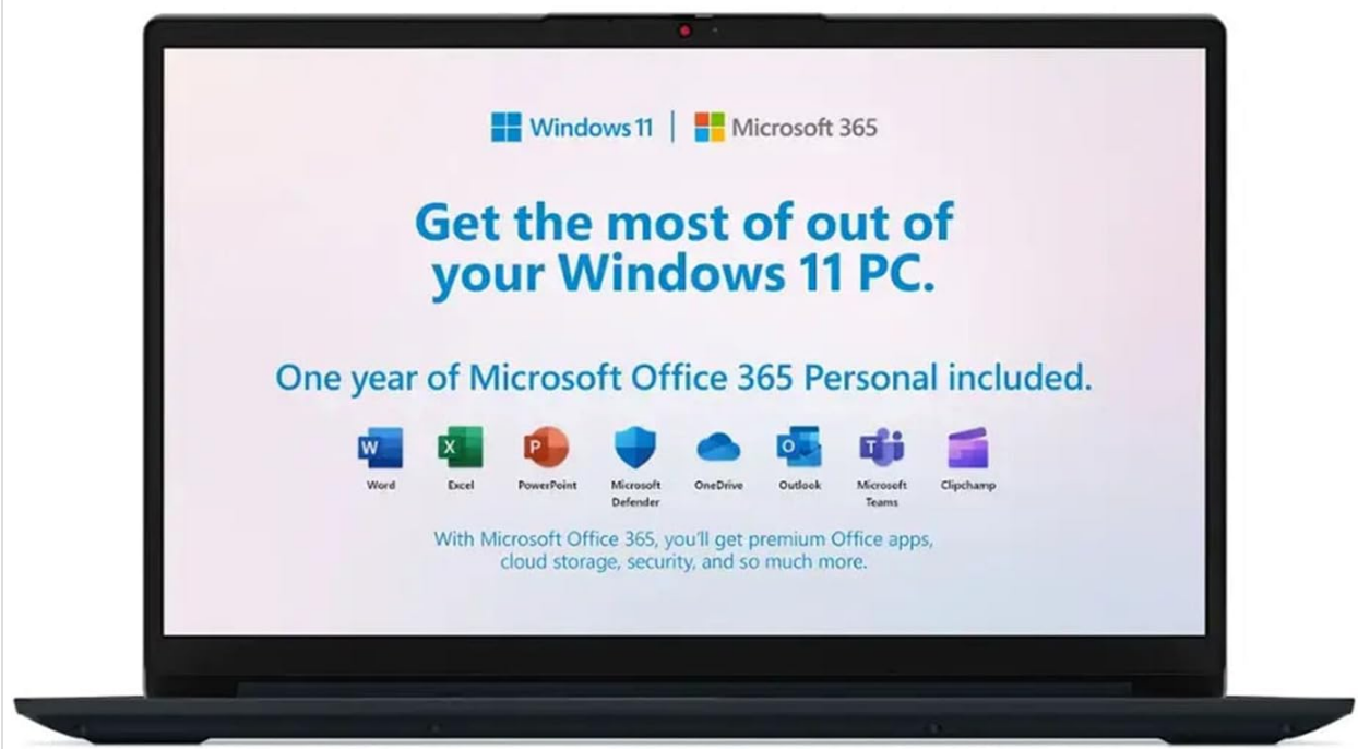
Image: The laptop screen shows the Windows 11 logo and Microsoft 365 logo, with text stating "Get the most out of your Windows 11 PC. One year of Microsoft Office 365 Personal included." Below are icons for Word, Excel, PowerPoint, Microsoft Defender, OneDrive, Outlook, Clipchamp, and Teams.

Your device includes a 12-month Microsoft 365 Personal subscription. Follow the prompts during Windows setup or refer to the included documentation to activate your subscription.