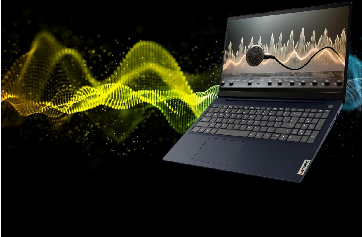
Image: The laptop is displayed with vibrant sound waves and a microphone graphic, highlighting the Dolby Audio feature for enhanced sound quality.

Enhance your entertainment experience with robust and rich Dolby Audio speakers. Watch on-the-go anytime, anywhere