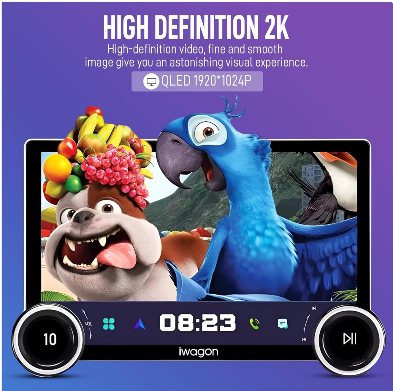
Figure 3: High-definition 2K display showcasing multimedia content.

The system features a 10.1-inch 2K resolution touchscreen (1920x1024P QLED) for clear and vibrant visuals. The full capacitance touch screen allows for easy operation. Adjust brightness and volume settings via the on-screen menu or physical knobs.