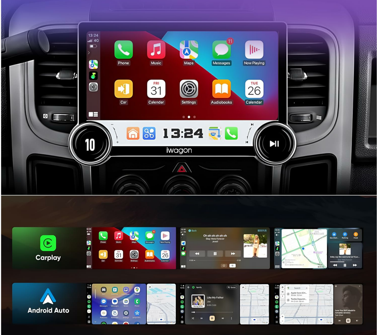
Figure 4: Wireless CarPlay and Android Auto interface.