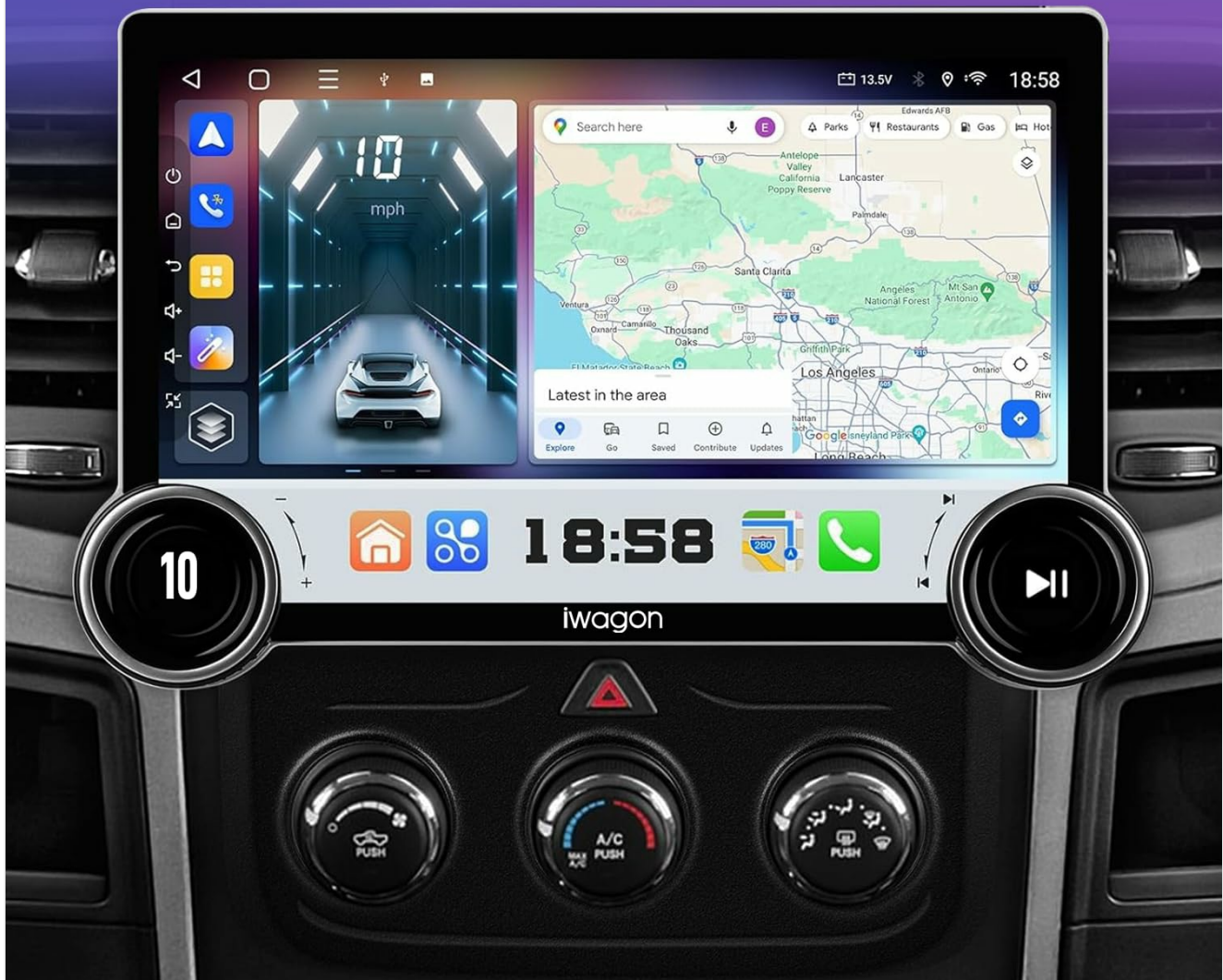
Figure 6: Dual knobs for intuitive control.