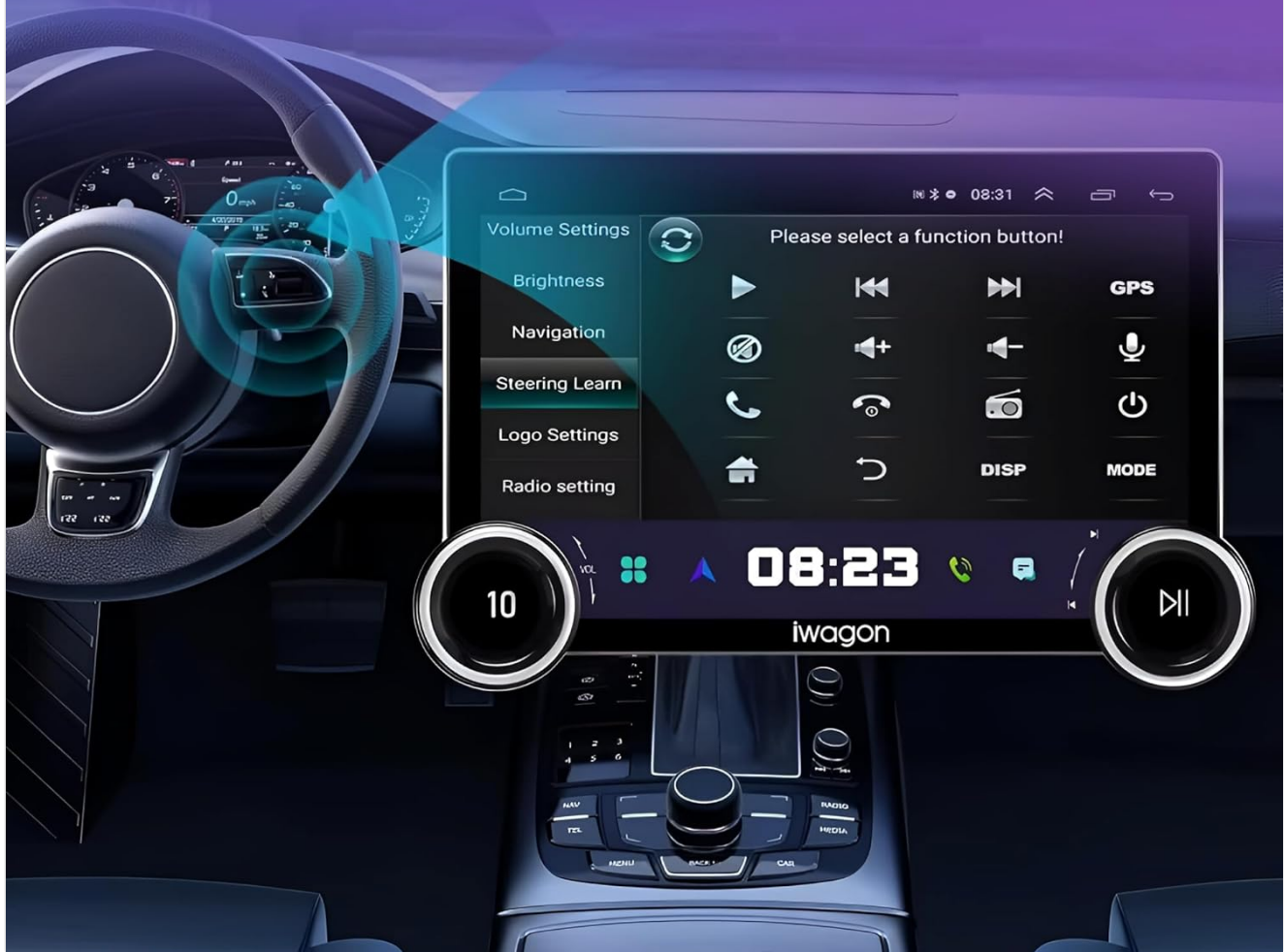
Figure 5: Steering wheel control integration.

With the steering wheel control, you can easily switch songs, channels and adjust volume for a safe and enjoyable drive.