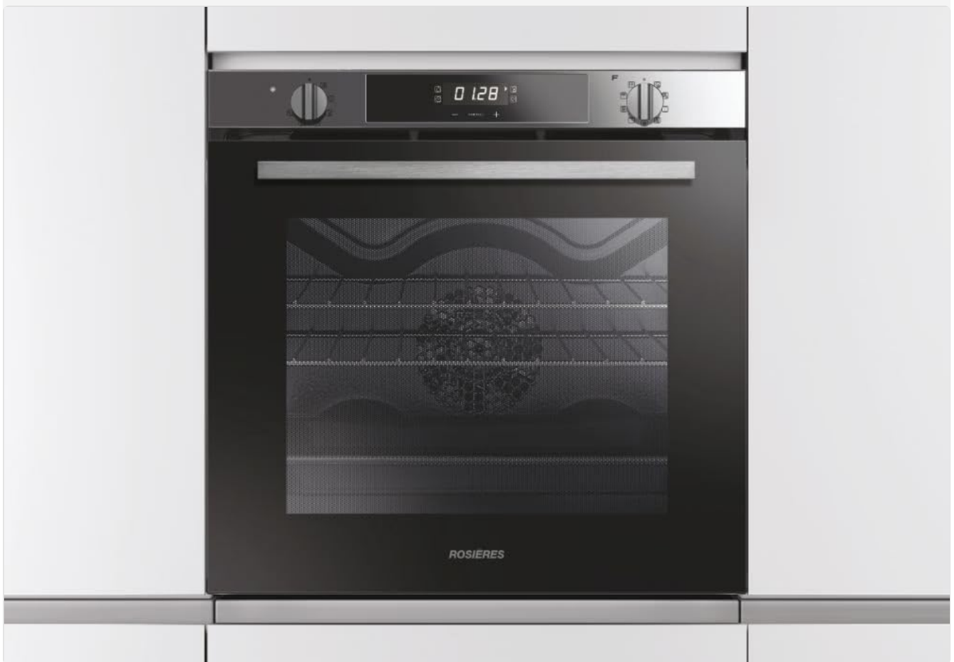
Figure 3.1: The Rosières RFC3O3351IN oven seamlessly integrated into a kitchen cabinet, highlighting its built-in design.