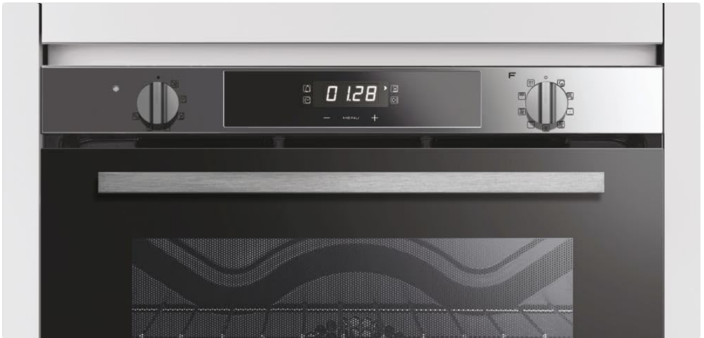
Figure 3.2: Detailed view of the oven's control panel, showing the LED display and rotary knobs.