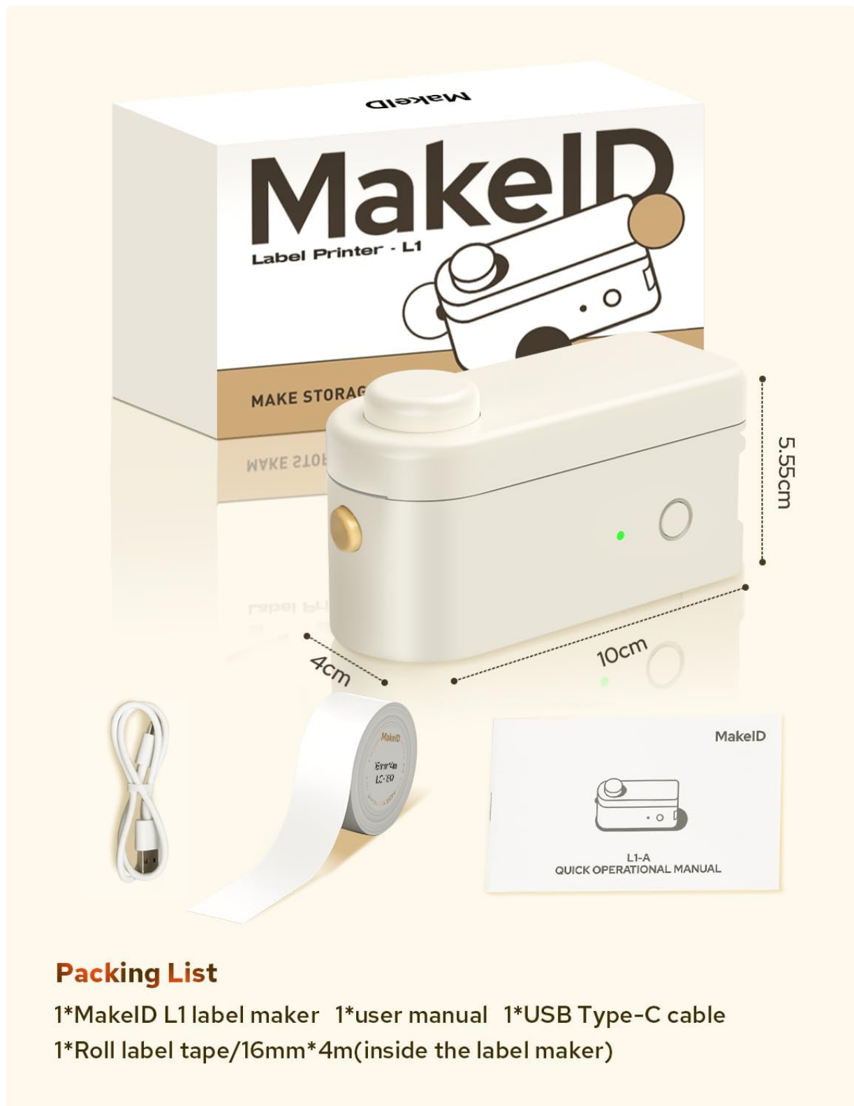
Figure 2: Detailed view of the MakeID L1-C Label Maker's packing list, showing the label maker, USB-C charging cable, user manual, and a pre-installed roll of 16mm label tape.