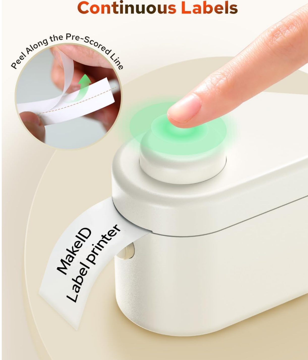
Figure 7: The one-touch precision cutter in action, demonstrating how to cleanly trim labels after printing.