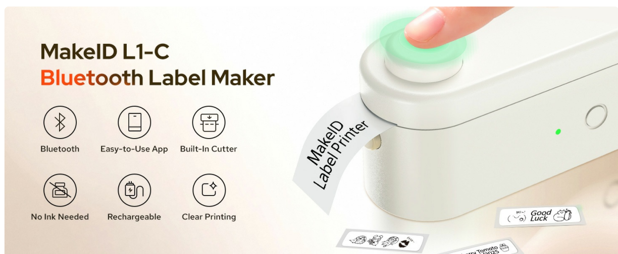
Figure 1: Overview of the MakeID L1-C Bluetooth Label Maker and its core features including Bluetooth connectivity, ease of use, built-in cutter, no ink needed, rechargeable battery, and clear printing.

The Makeid L1-C Smart Label Maker is a compact, portable, and rechargeable device designed for creating custom labels. It connects wirelessly to your iOS or Android device via Bluetooth, allowing you to design and print labels using a dedicated mobile application. The device features thermal printing technology, eliminating the need for ink, and includes a built-in precision cutter for clean label separation. It supports various label tape widths (9mm, 12mm, 16mm) and offers enhanced print quality (203 or 300 DPI) for waterproof and fade-resistant labels.