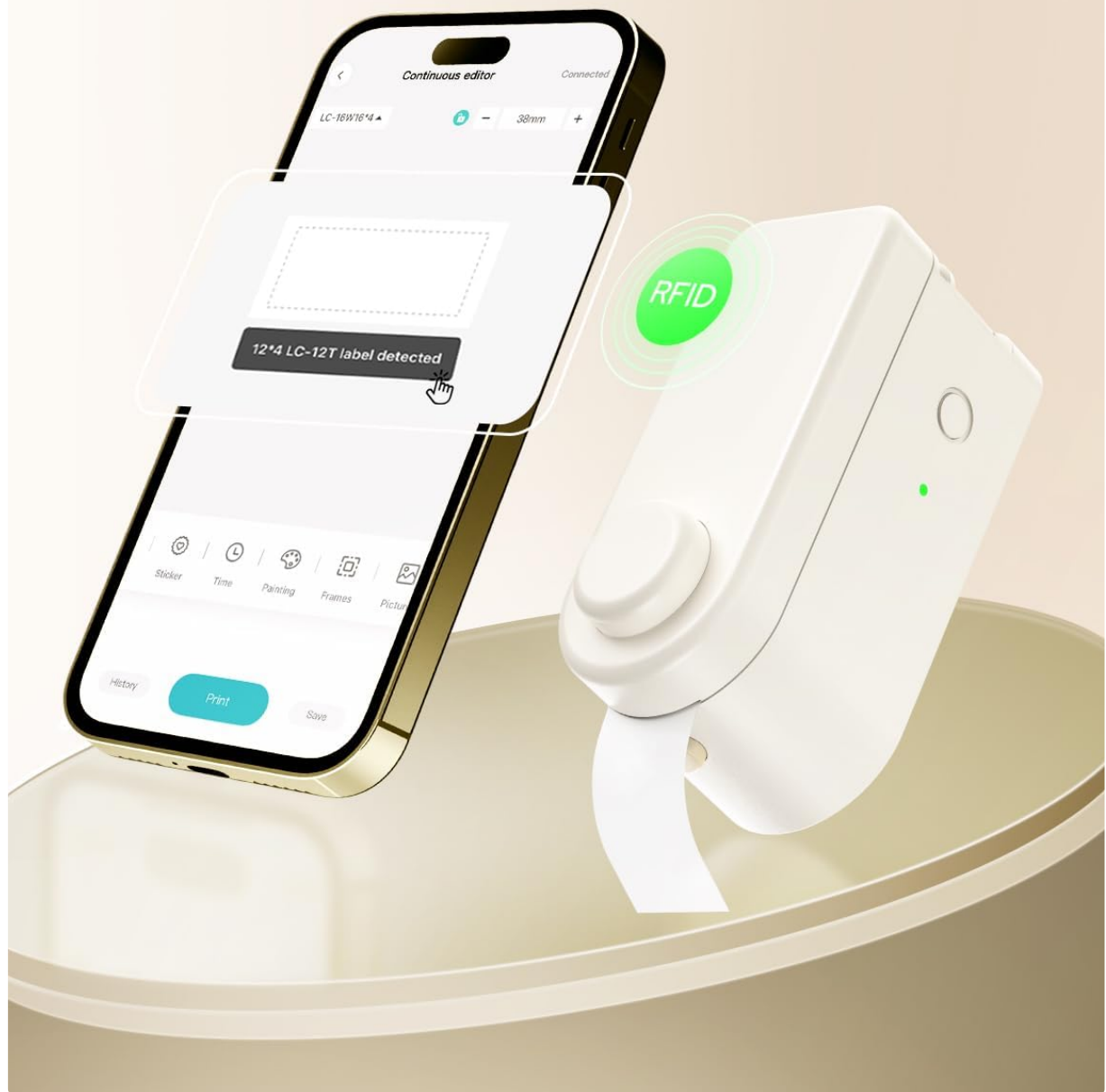
Figure 6: The MakeID L1-C label maker's auto-detect label size feature, simplifying the printing process by automatically recognizing the label dimensions.