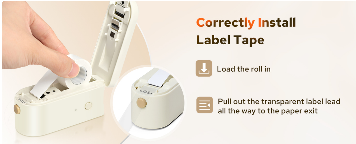
Figure 3: Visual guide for correctly installing label tape: load the roll in and pull the transparent label lead to the paper exit.