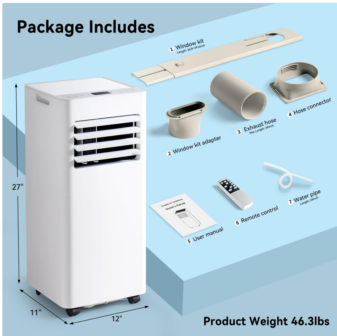
Figure 2: All components included in the Aoxun Portable Air Conditioner package.