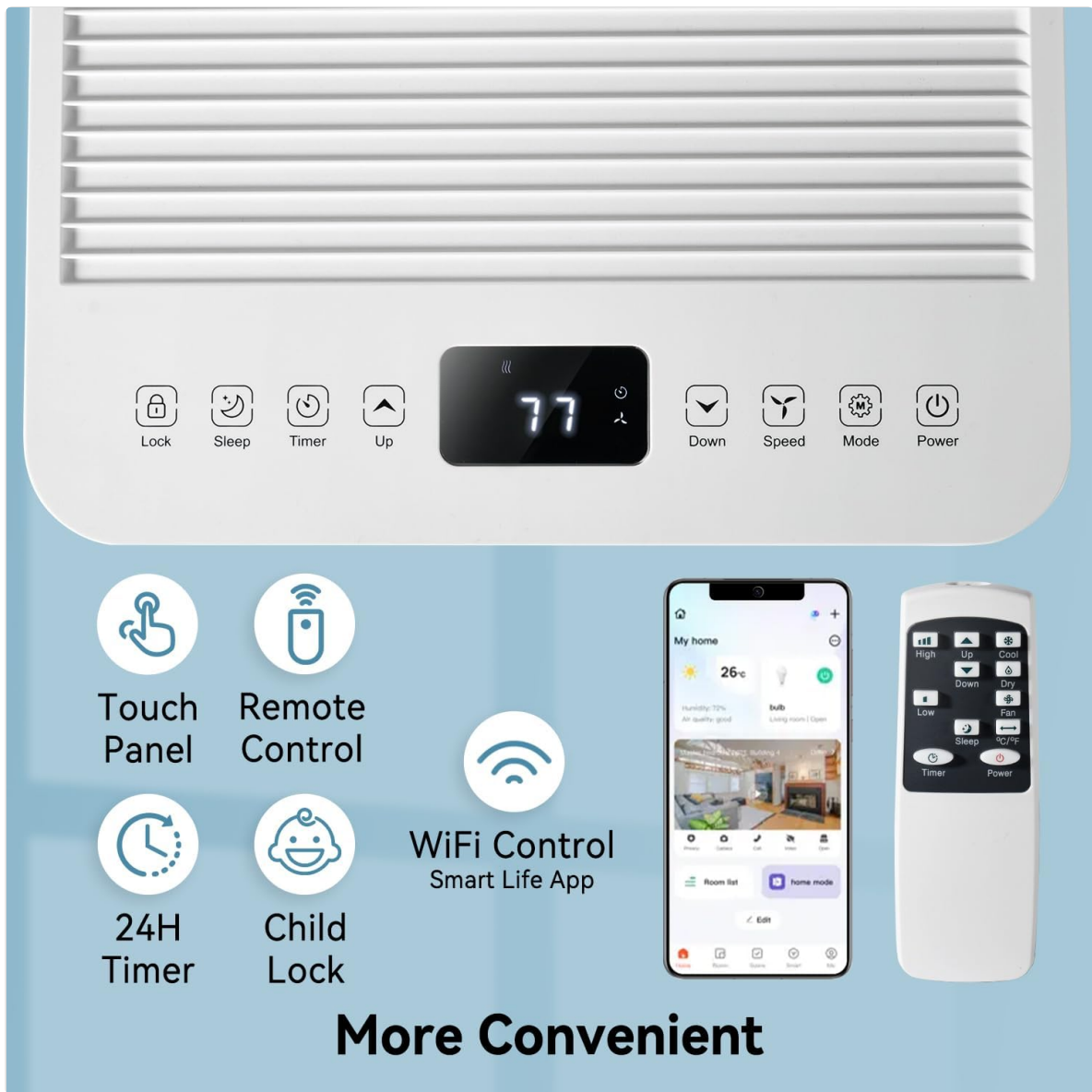
Figure 5: Overview of the control panel, remote control, and WiFi app for convenient operation.