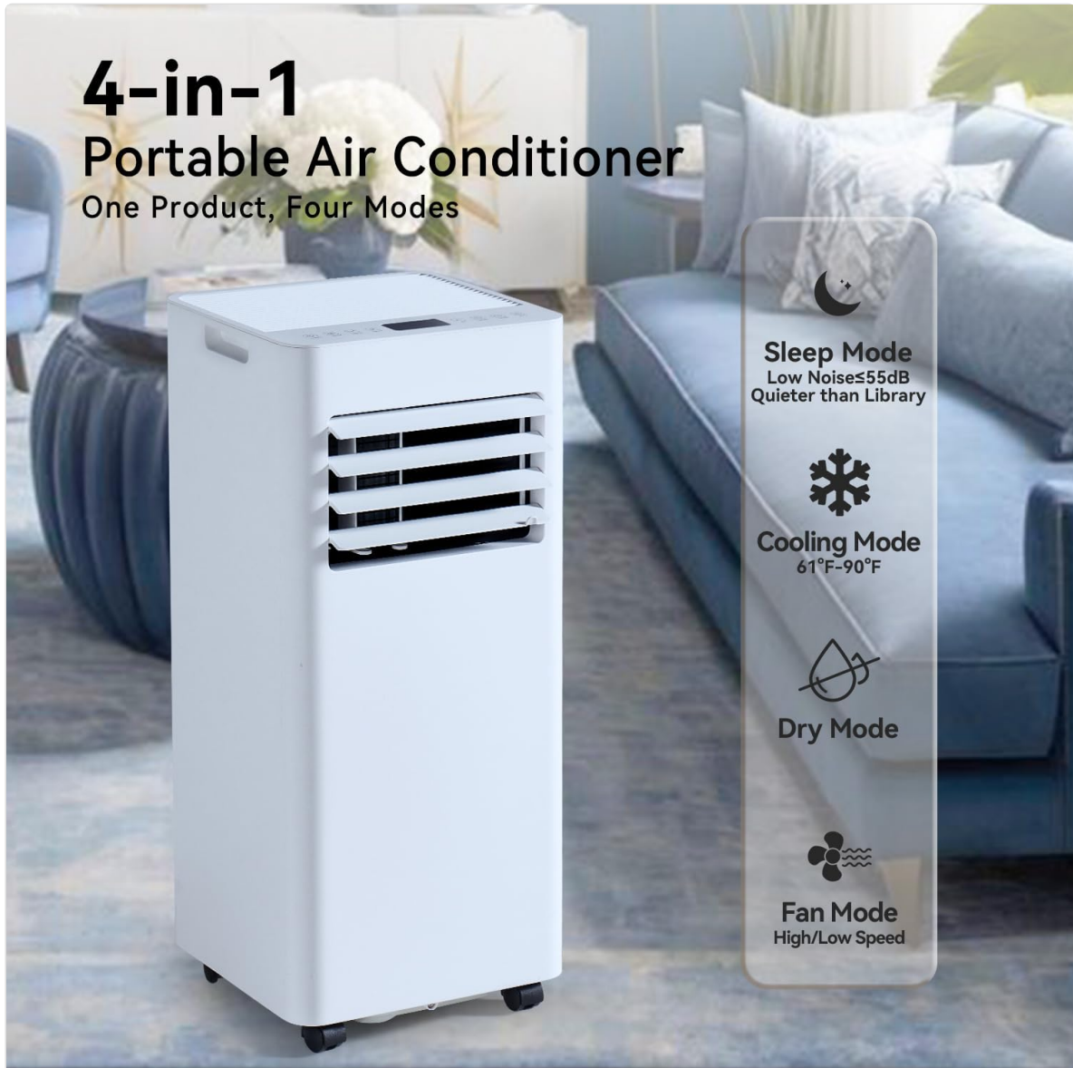
Figure 3: The 4-in-1 functionality of the Aoxun Portable Air Conditioner.