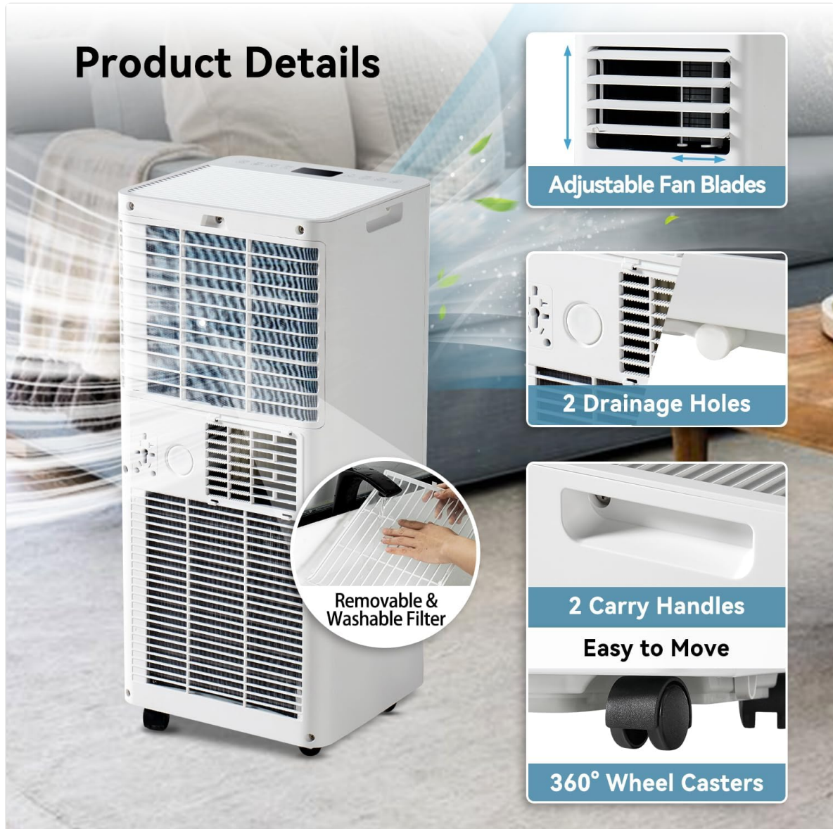
Figure 7: Product details highlighting the removable washable filter and dual drainage holes.