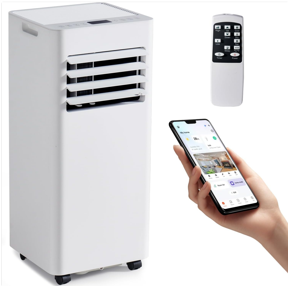
Figure 1: Aoxun 10000 BTU Portable Air Conditioner with remote control and smartphone app interface.