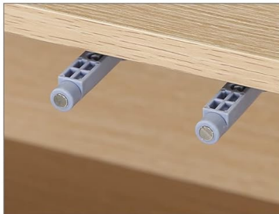
Inner Rebound mechanic