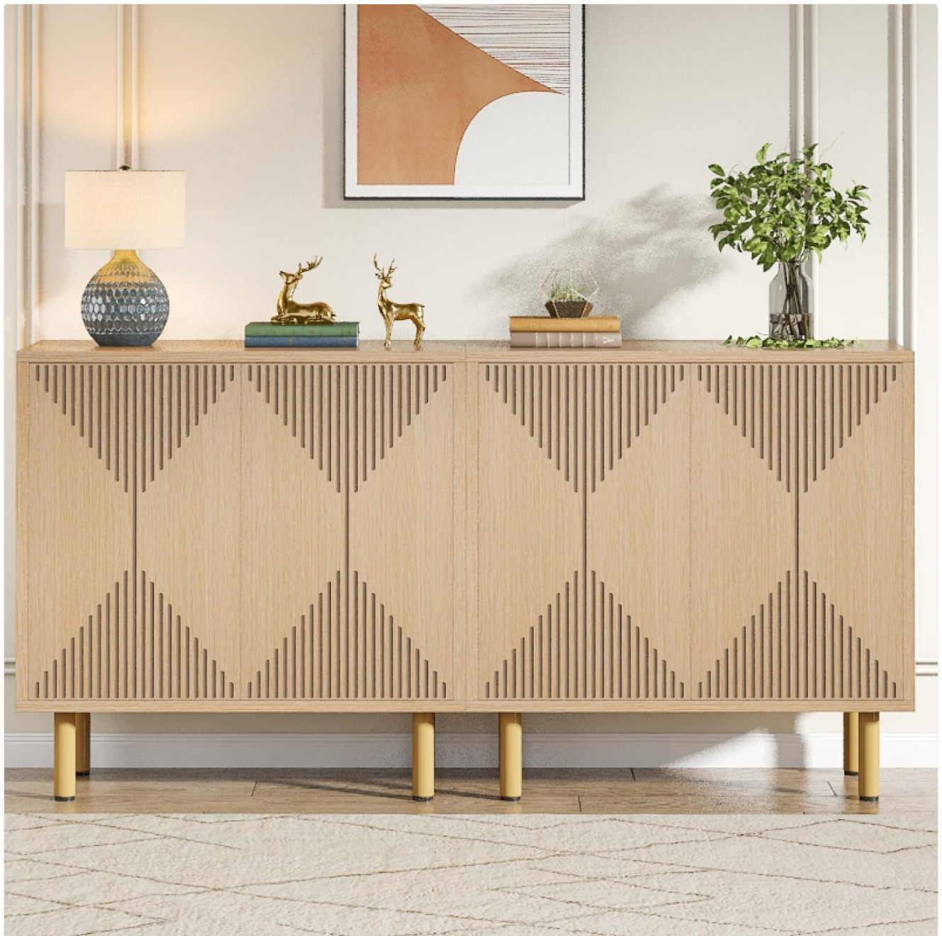
The cabinet in a dining room setting, demonstrating its adaptability.