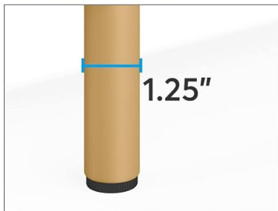
Thick Metal Legs